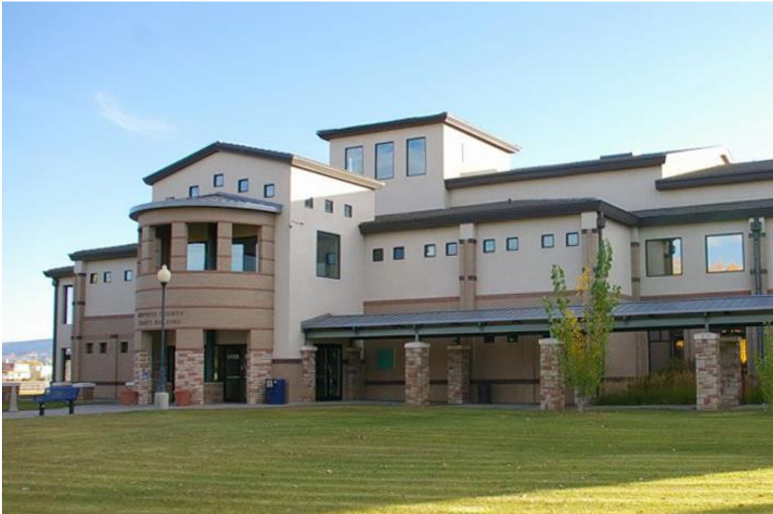
MONTROSE COUNTY JUSTICE CENTER – 1998