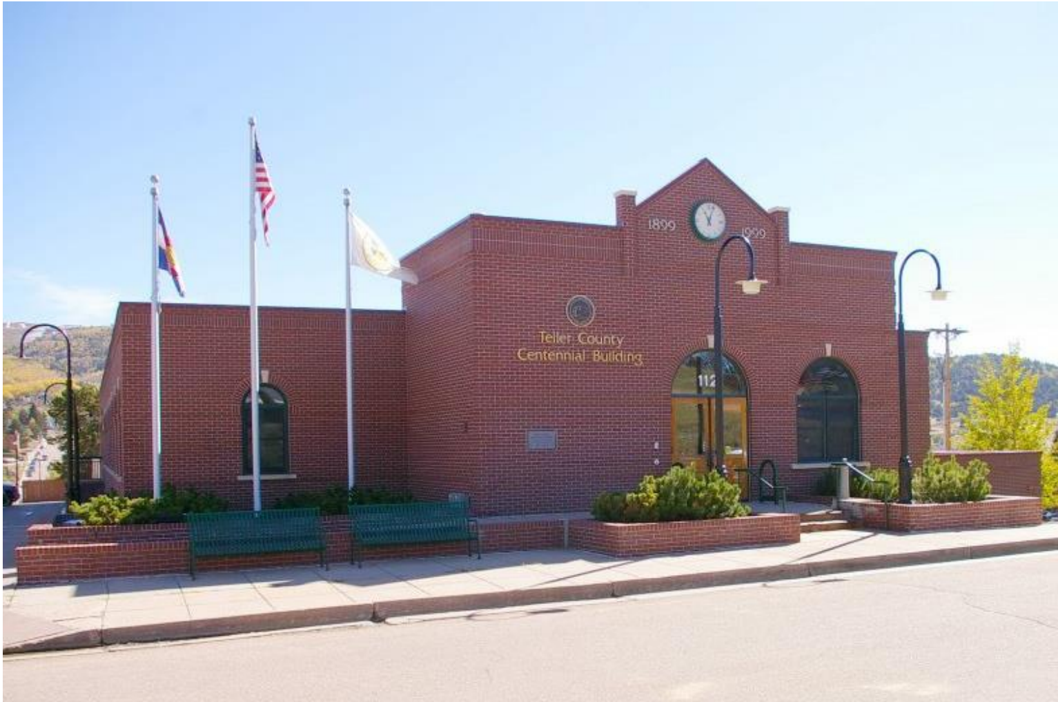
TELLER COUNTY CENTENNIAL BUILDING – 1999