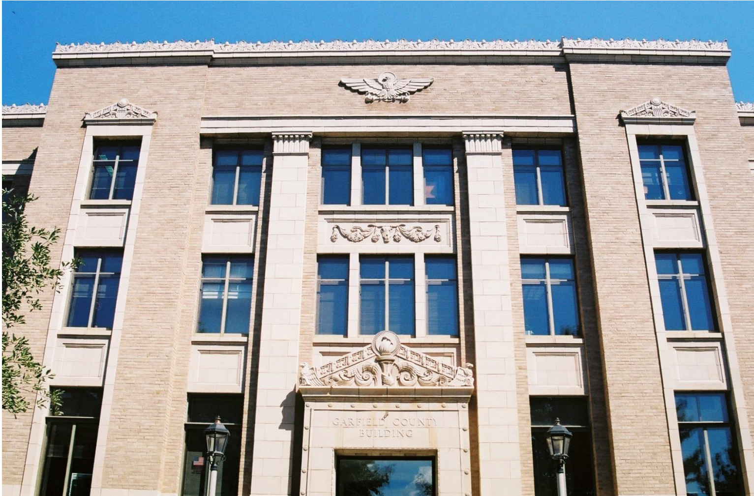
GARFIELD COUNTY BUILDING