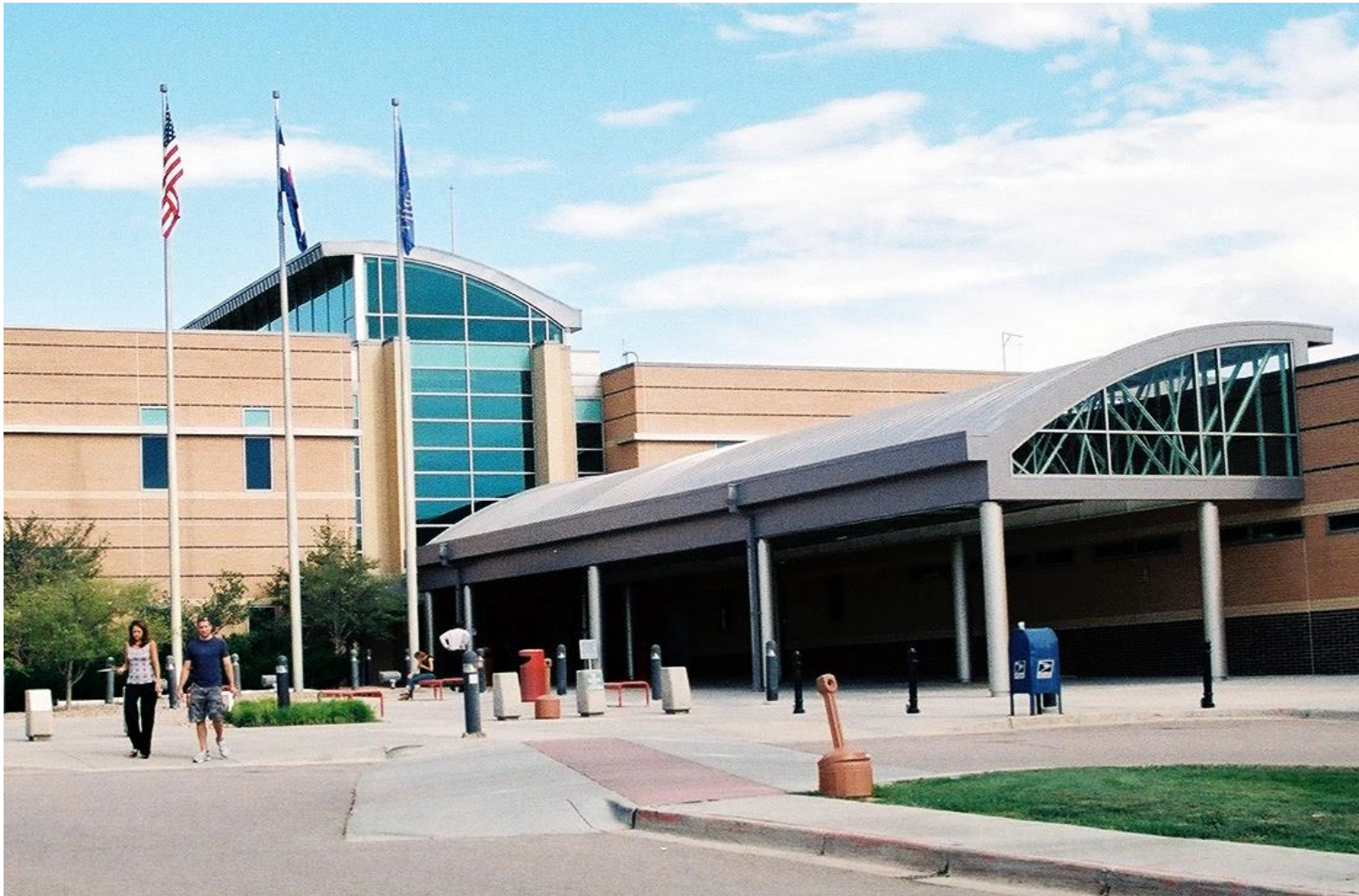
DOUGLAS COUNTY JUSTICE CENTER – 1998