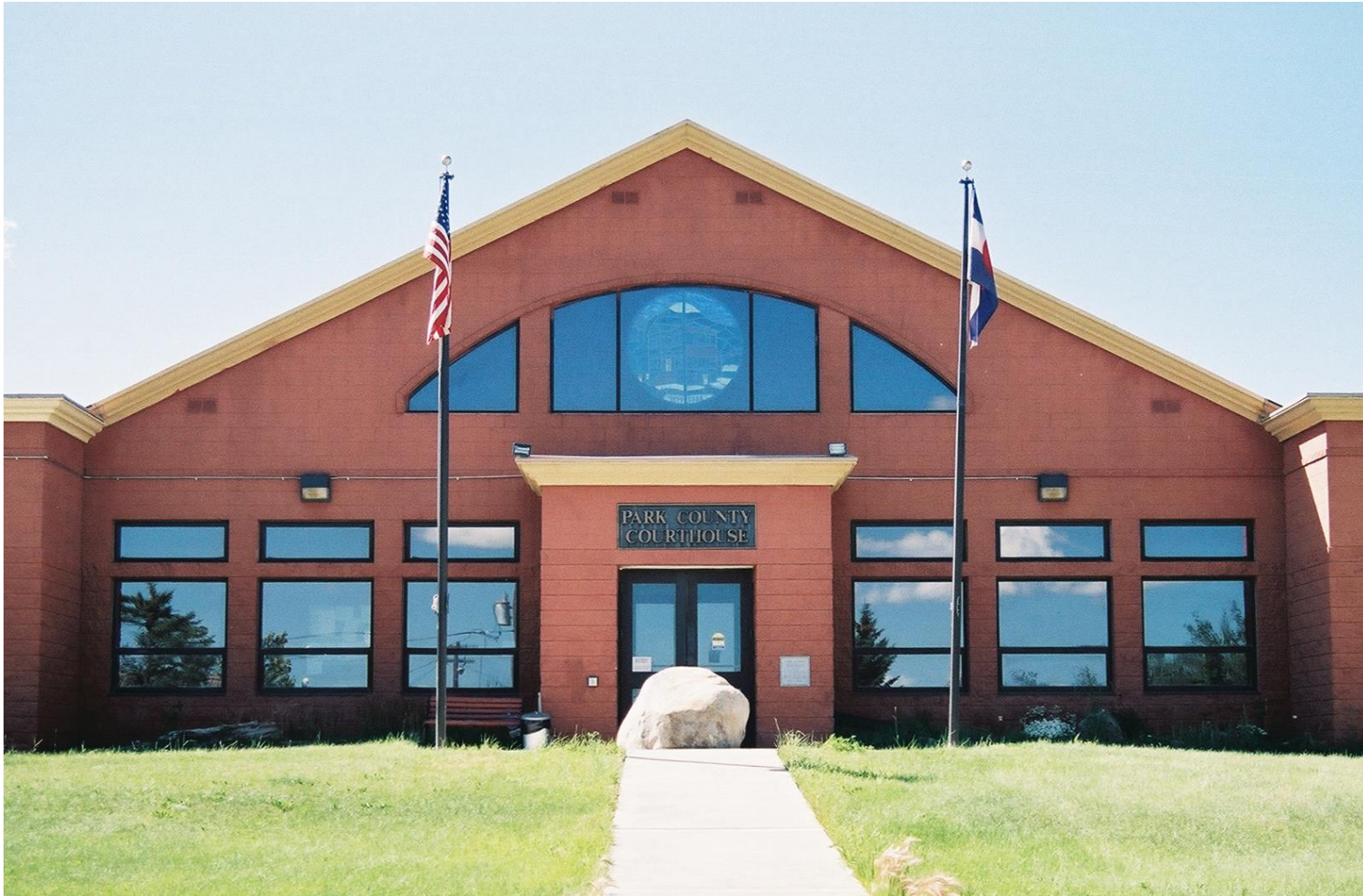
PARK COUNTY COURT HOUSE – 1986