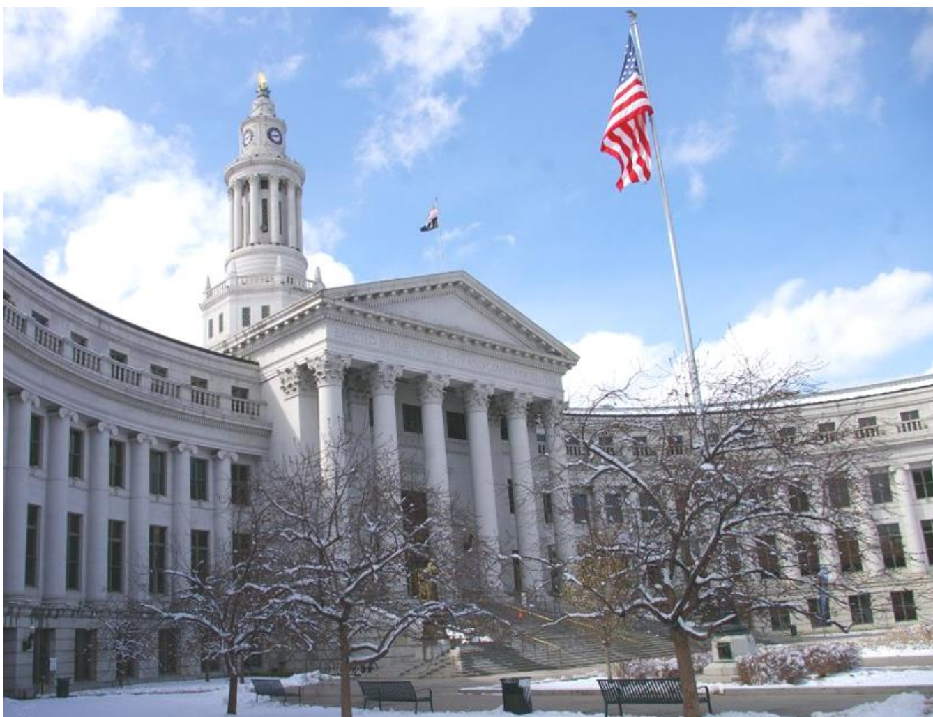
DENVER CITY AND COUNTY BUILDING – 1932