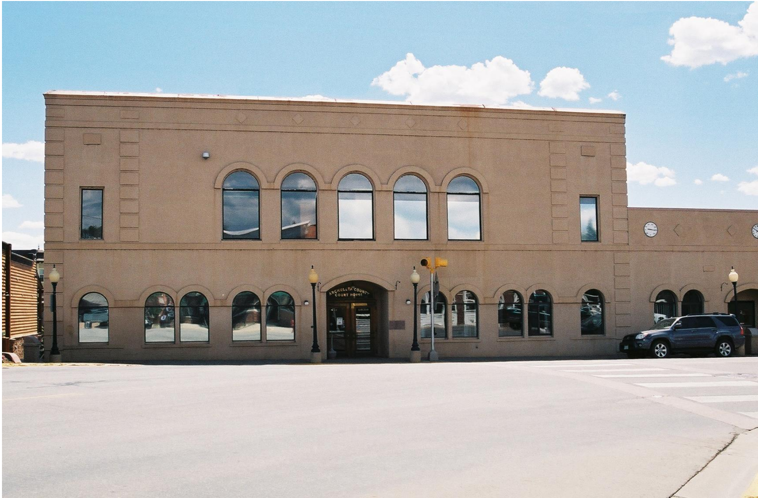
ARCHULETA COUNTY COURT HOUSE – 1929