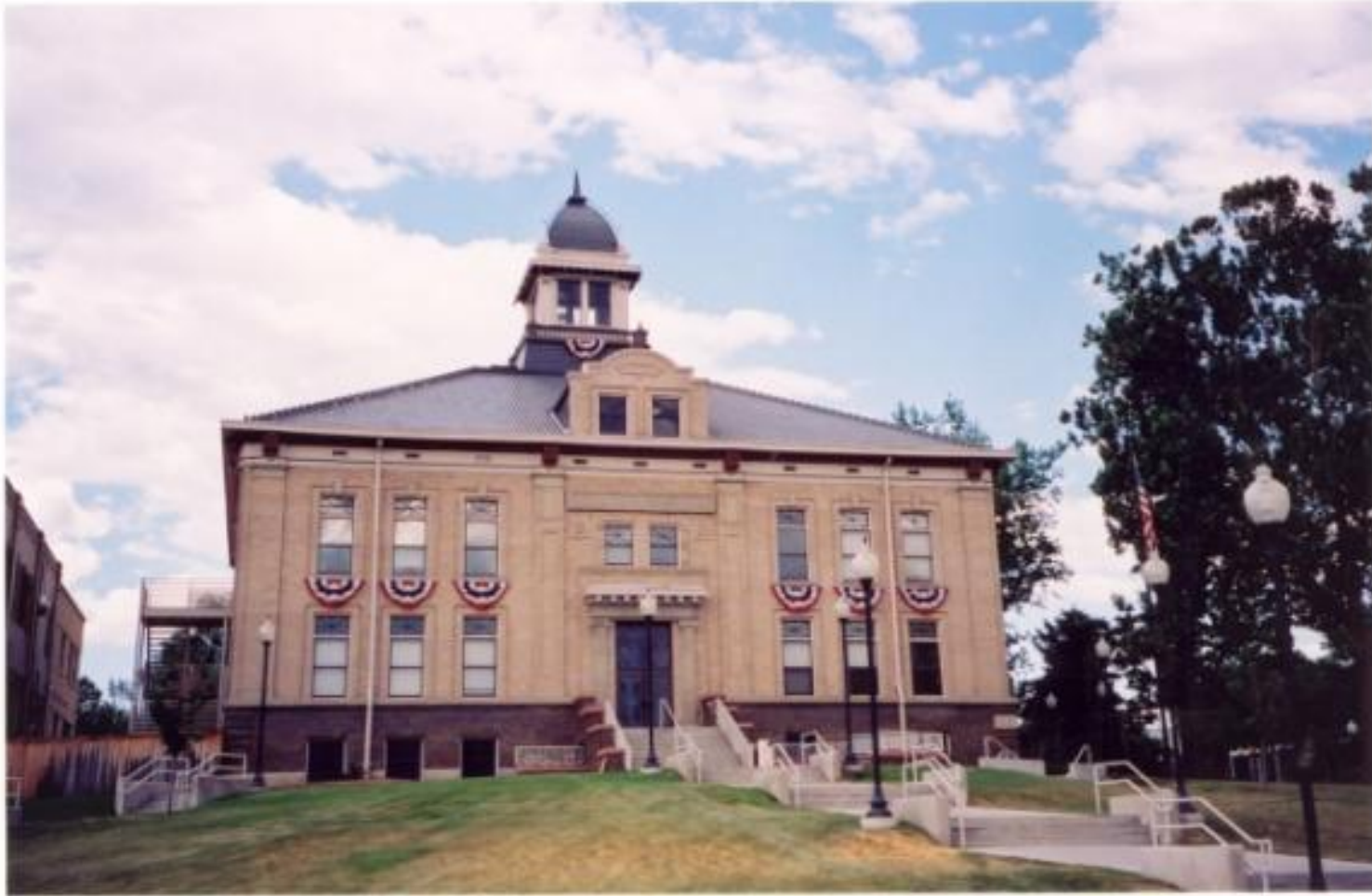
ARAPAHOE COUNTY COURT HOUSE – 1908