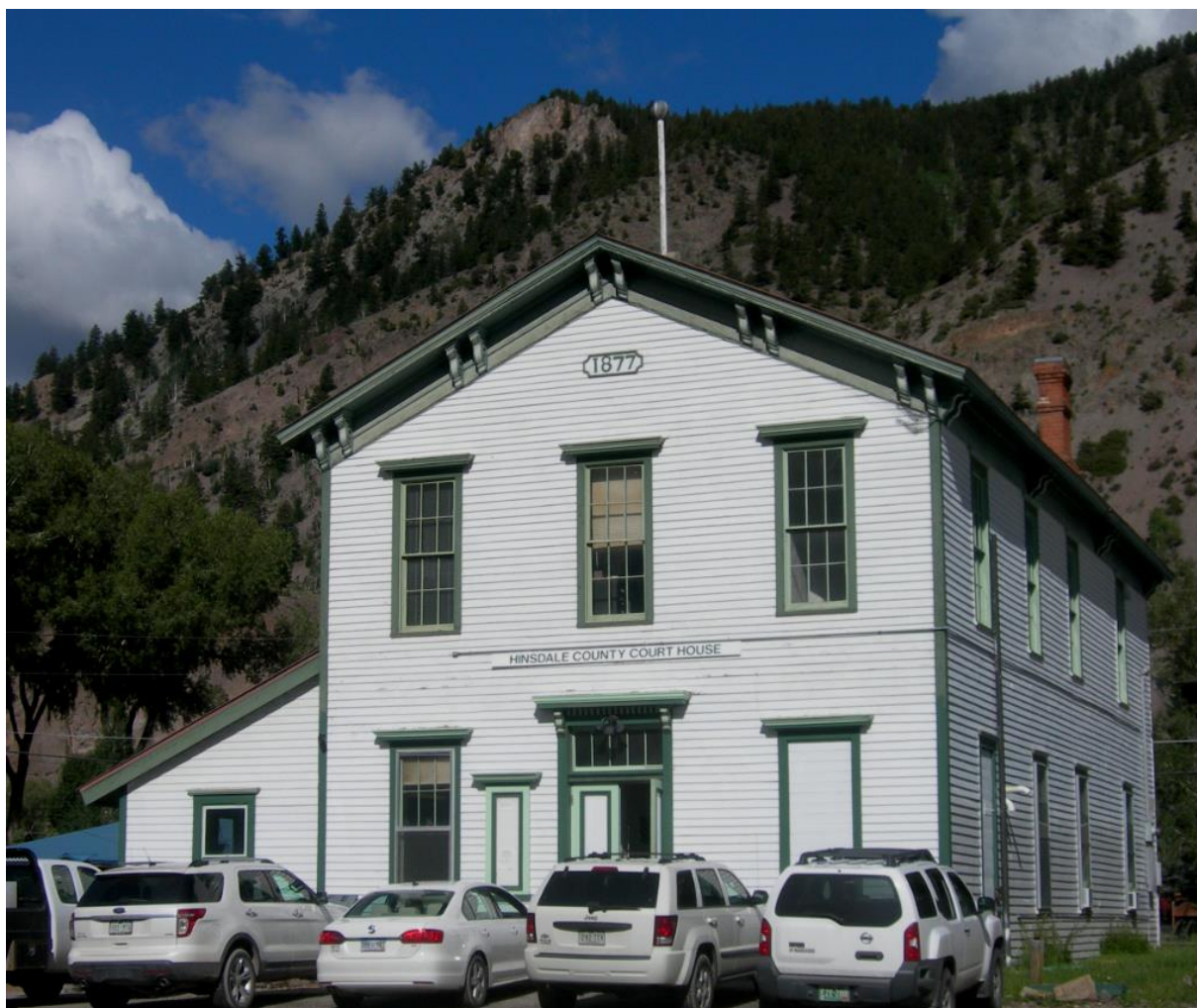
HINSDALE COUNTY COURT HOUSE – 1877