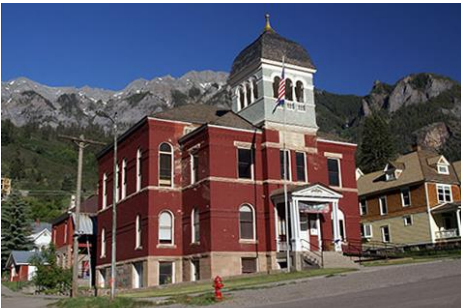
OURAY COUNTY COURT HOUSE – 1888