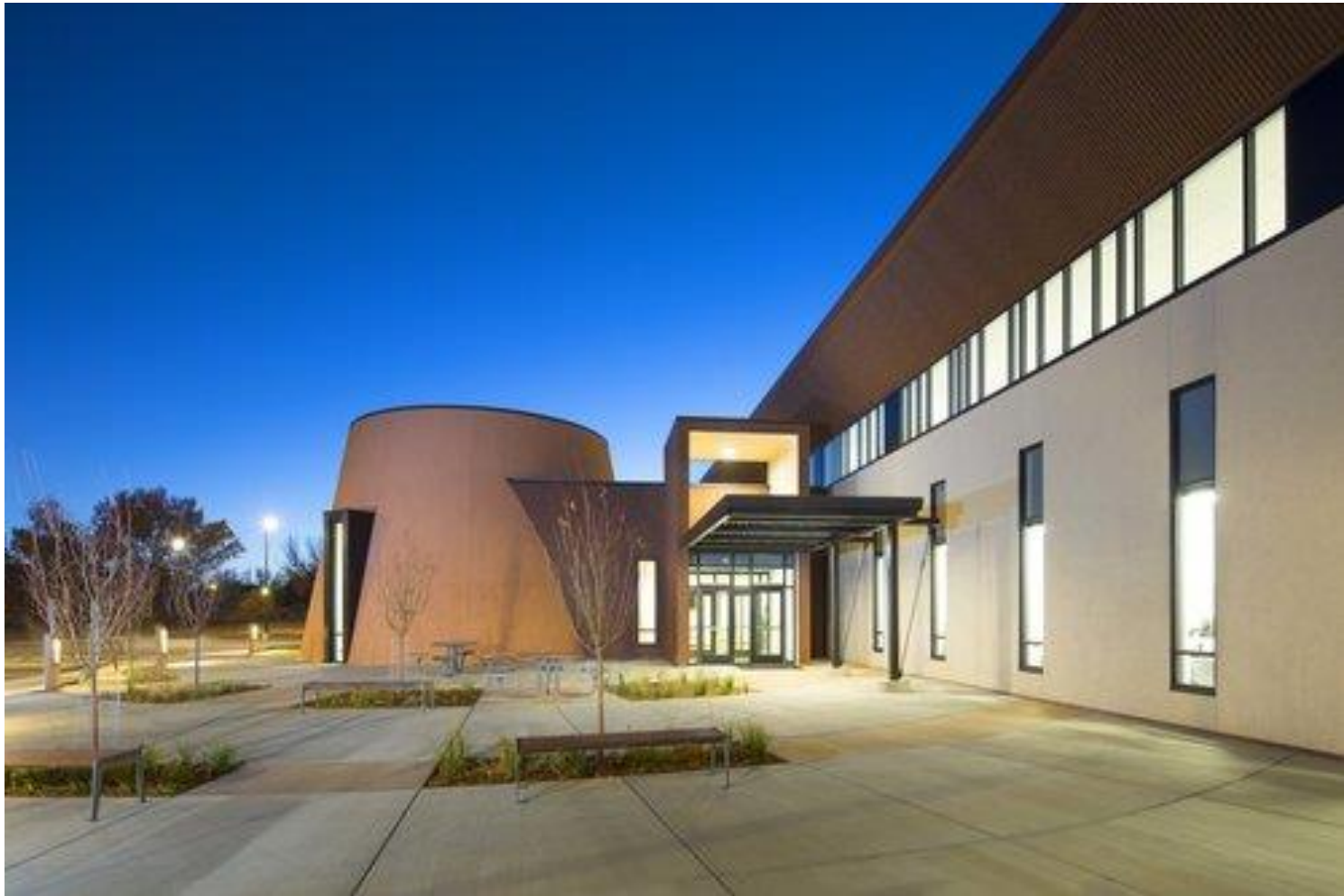
MONTEZUMA COUNTY COMBINED COURTS – 2017