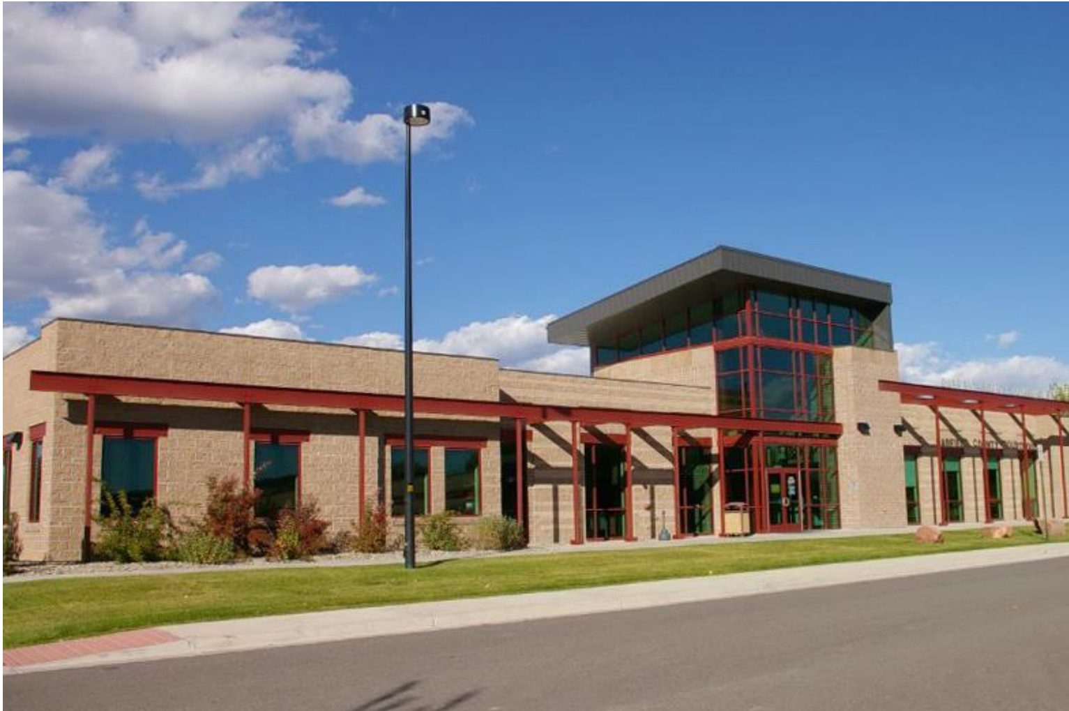
GARFIELD COUNTY BUILDING – 2008