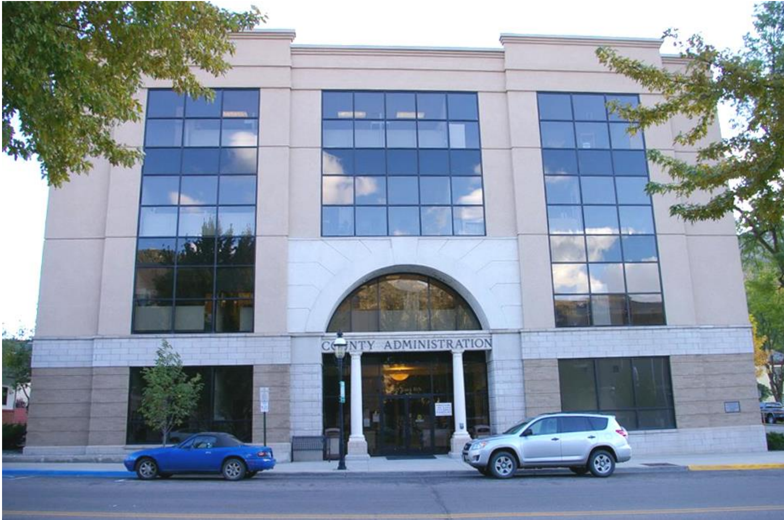
GARFIELD COUNTY ADMINISTRATION BUILDING – 2002