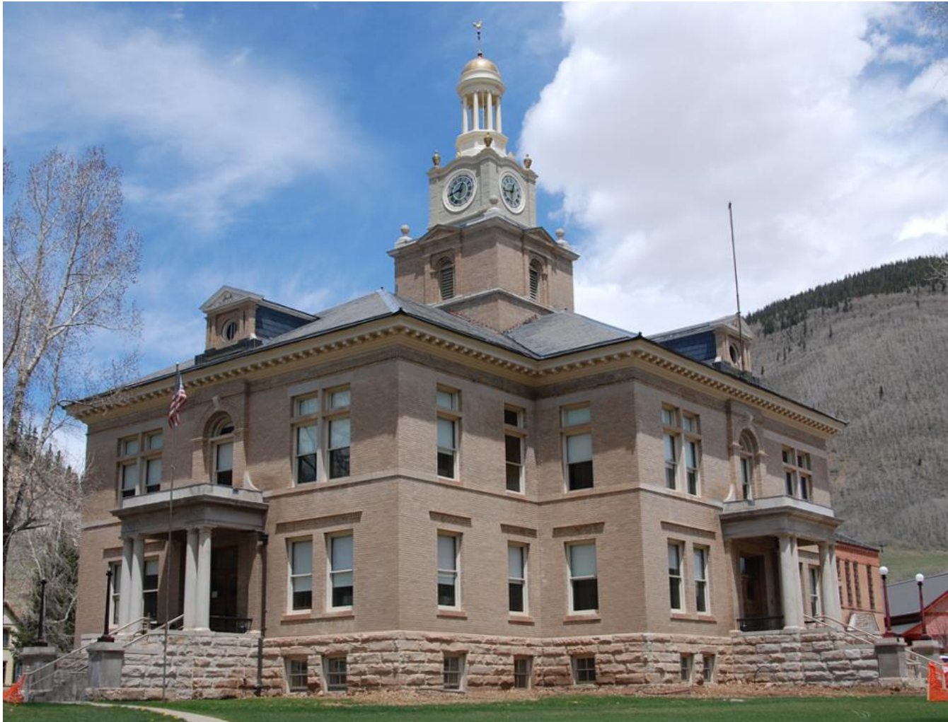
SAN JUAN COUNTY COURT HOUSE – 1908