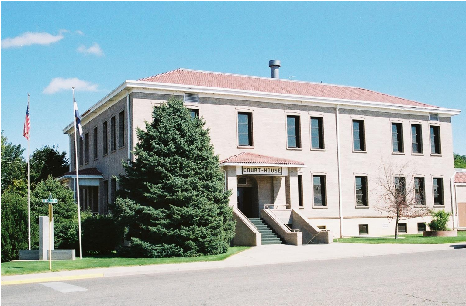
YUMA COUNTY COURT HOUSE – 1904