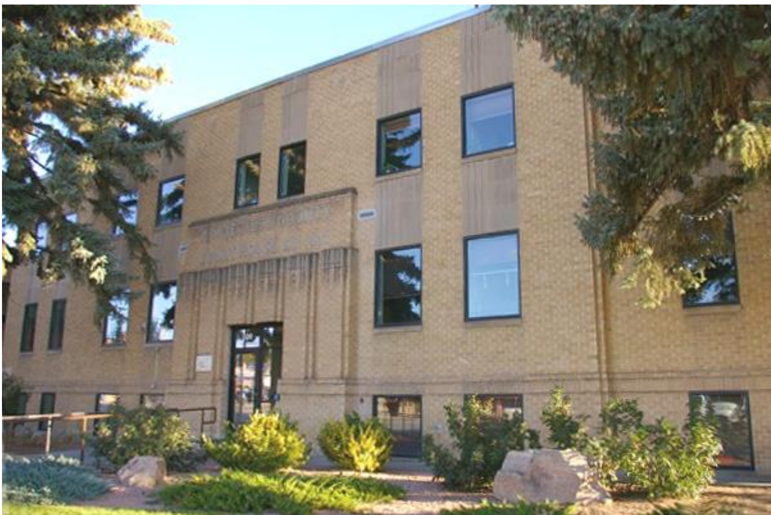
MONTEZUMA COUNTY COURT HOUSE – 1937