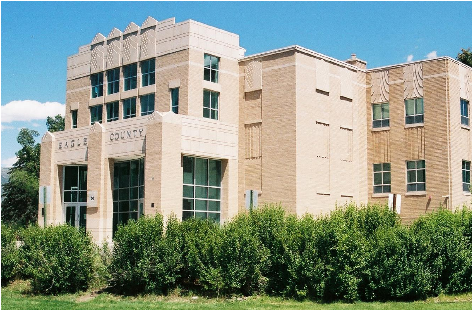
EAGLE COUNTY COURT HOUSE – 1932