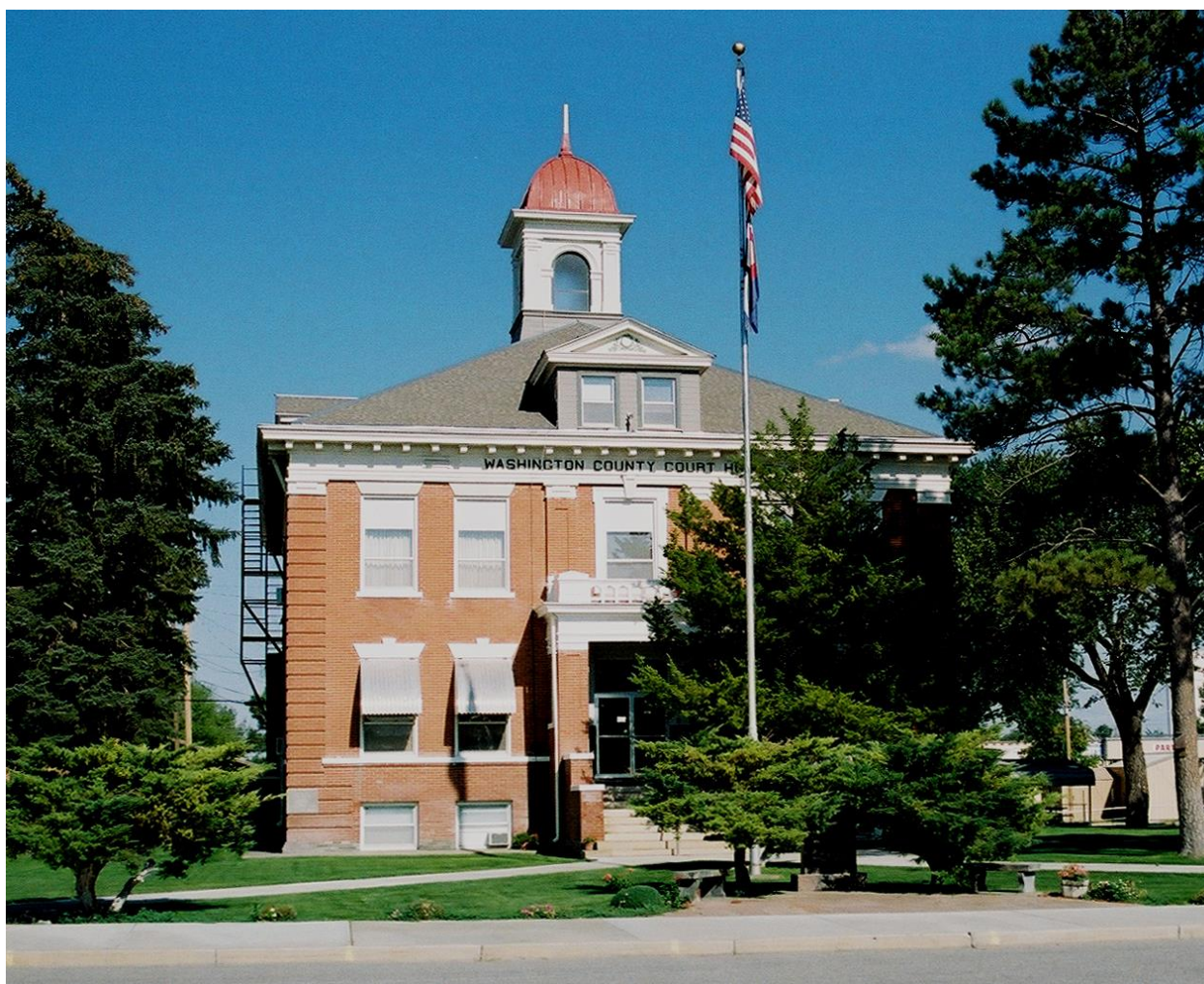
WASHINGTON COUNTY COURT HOUSE – 1909