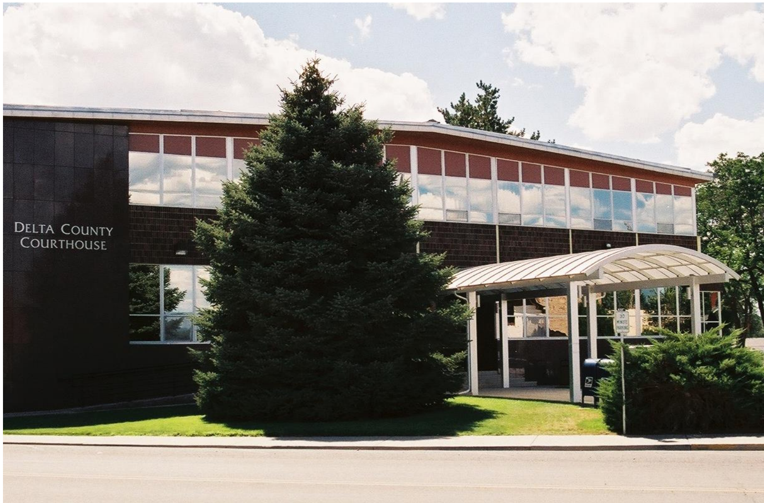
DELTA COUNTY COURT HOUSE – 1958