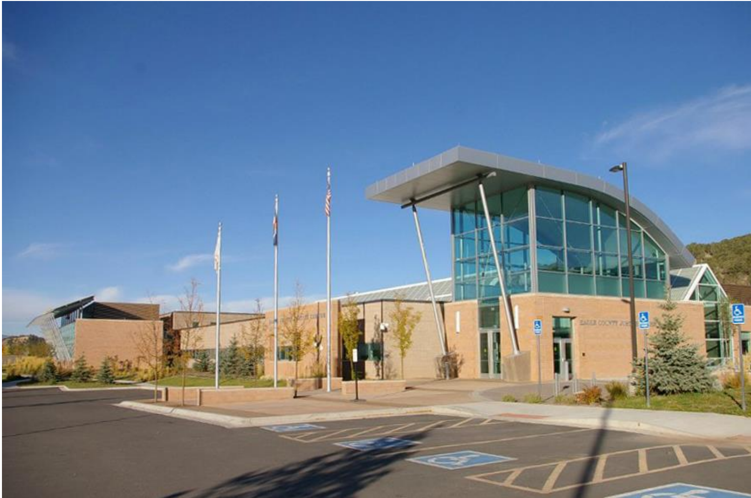
EAGLE COUNTY JUSTICE CENTER – 1991