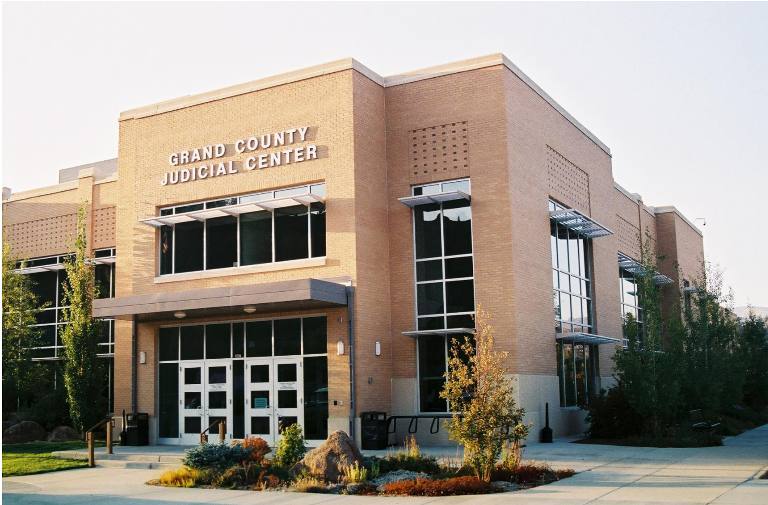
GRAND COUNTY JUDICIAL CENTER – 2008