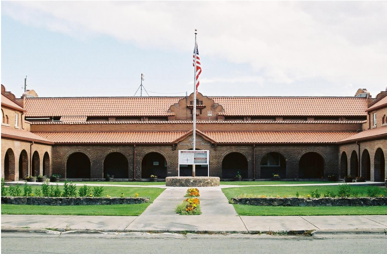
ALAMOSA COUNTY COURT HOUSE – 1938