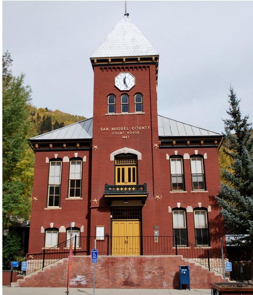
SAN MIGUEL COUNTY COURT HOUSE – 1887