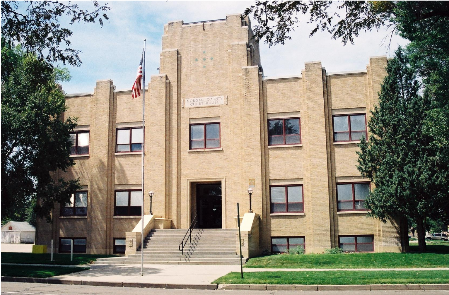
MORGAN COUNTY COURT HOUSE – 1936