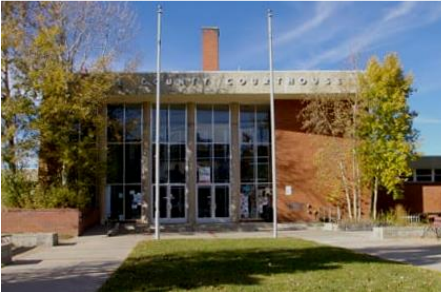
LAKE COUNTY COURT HOUSE – 1955 LEADVILLE