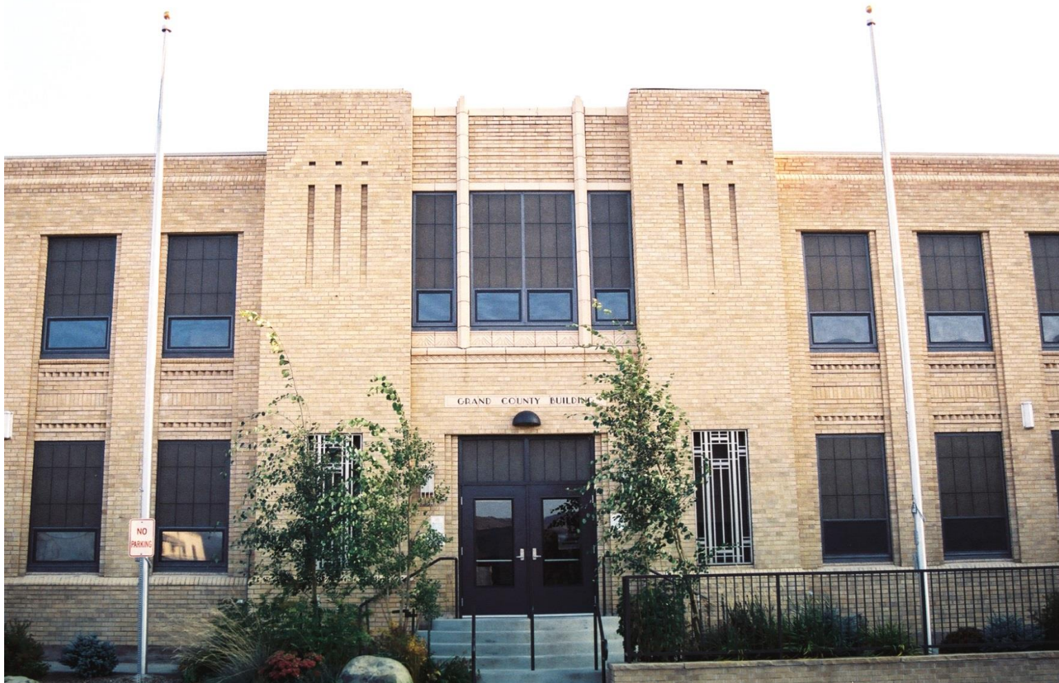
GRAND COUNTY BUILDING – 1937