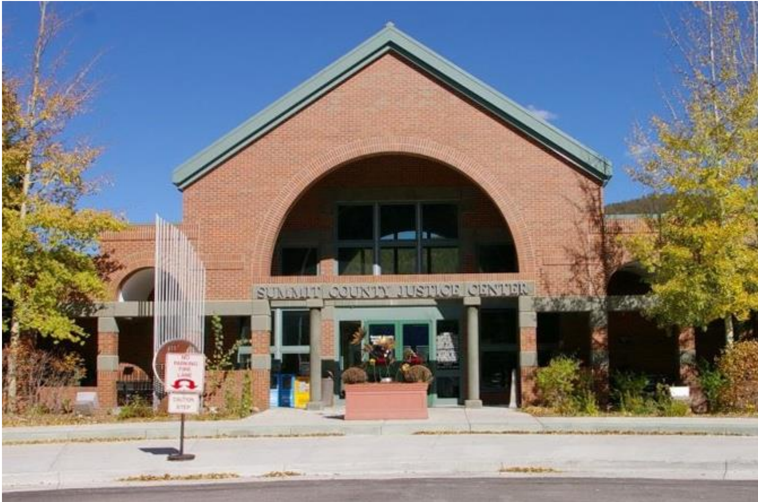
SUMMIT COUNTY JUSTICE CENTER – 1986