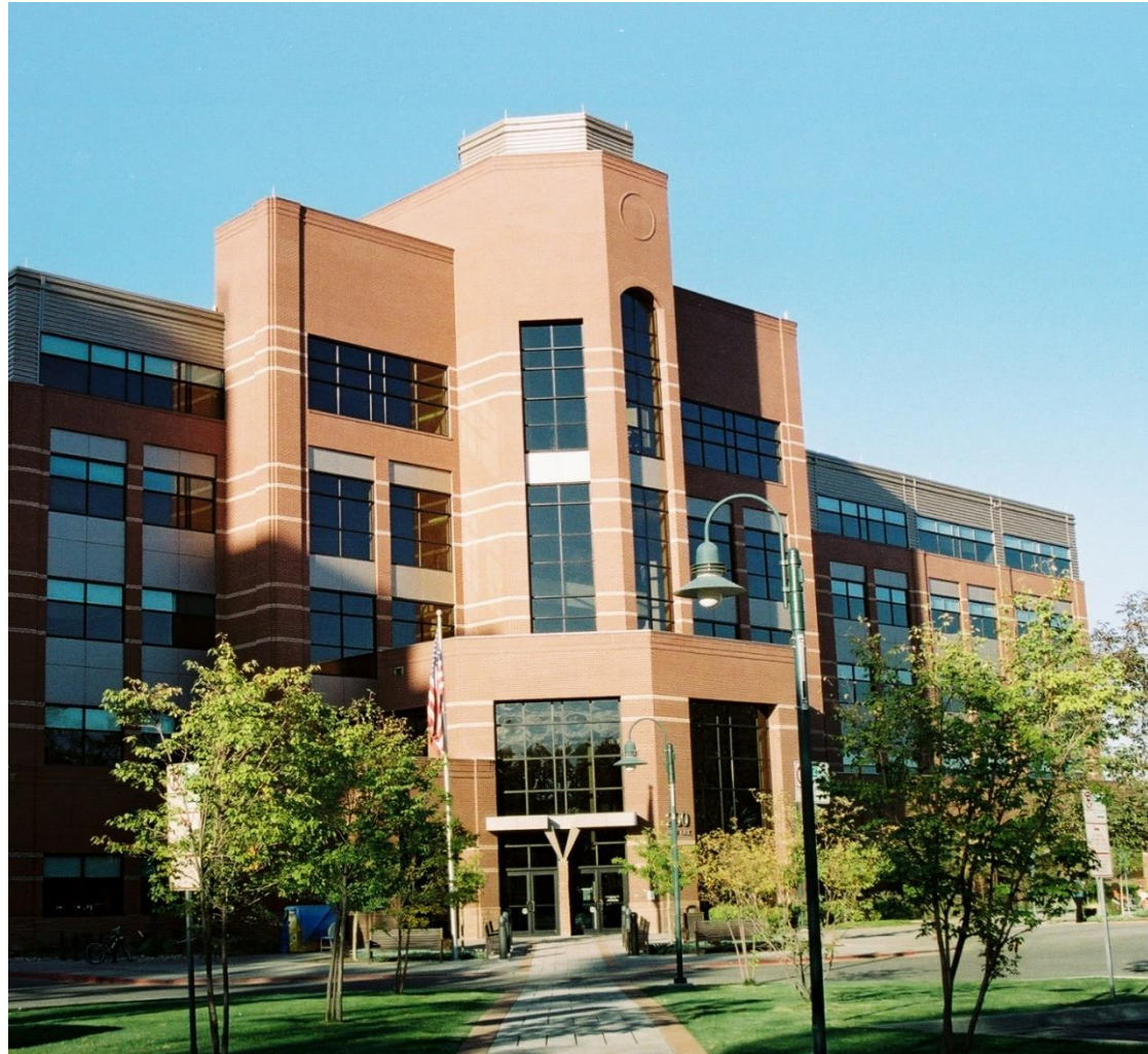
LARIMER COUNTY COURT HOUSE – 2003