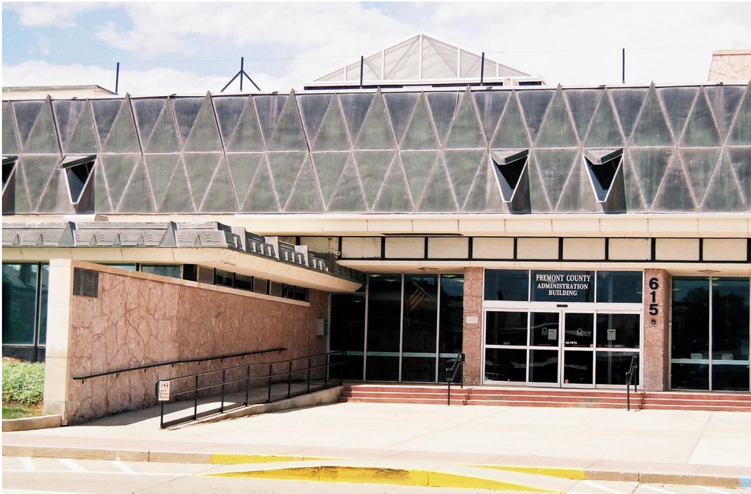
FREMONT COUNTY ADMINISTRATION BUILDING