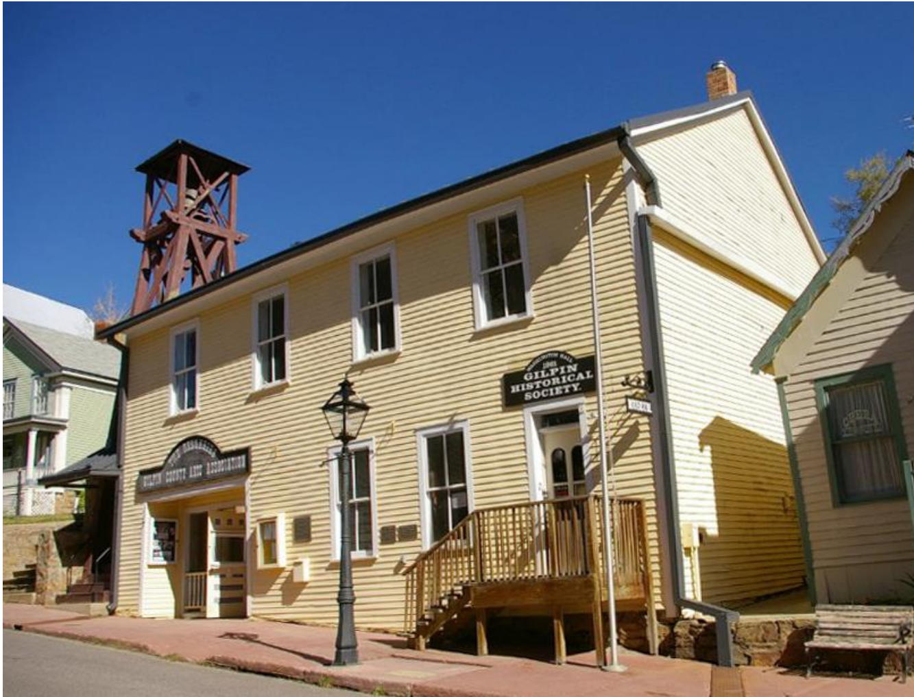
FORMER GILPIN COUNTY COURT HOUSE – 1862