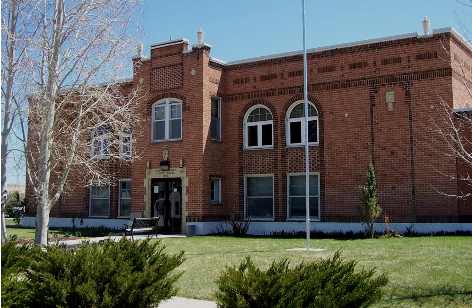
CUSTER COUNTY COURT HOUSE – 1929