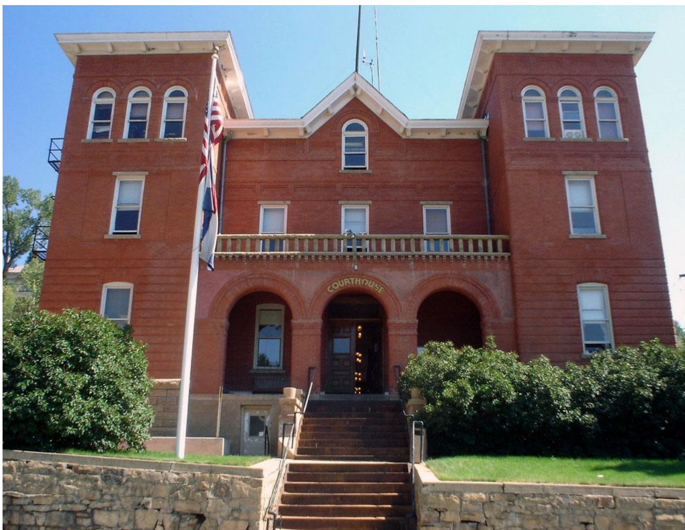
GILPIN COUNTY COURT HOUSE – 1900