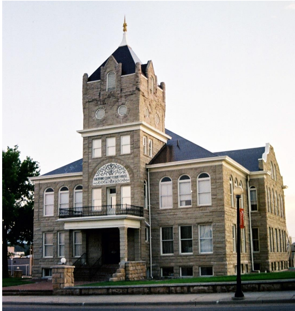
HUERFANO COUNTY COURT HOUSE – 1904