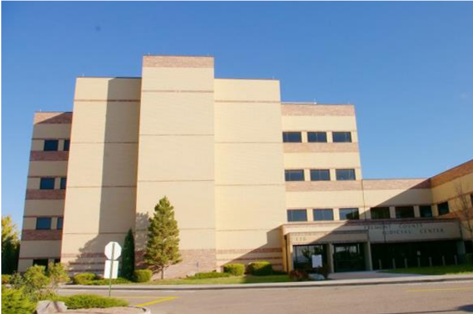
FREMONT COUNTY JUSTICE CENTER – 2002