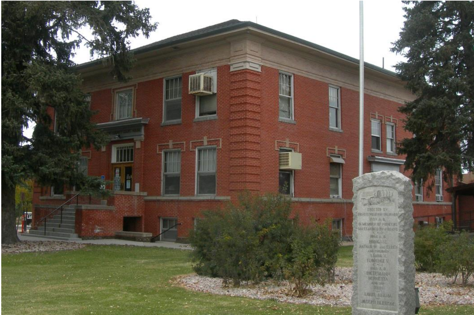
FORMER ELBERT COUNTY COURT HOUSE – 1913