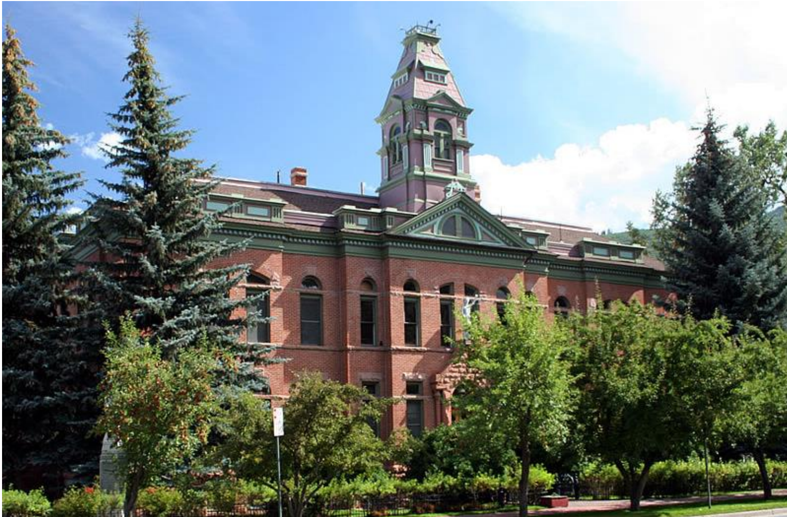
PITKIN COUNTY COURT HOUSE – 1890