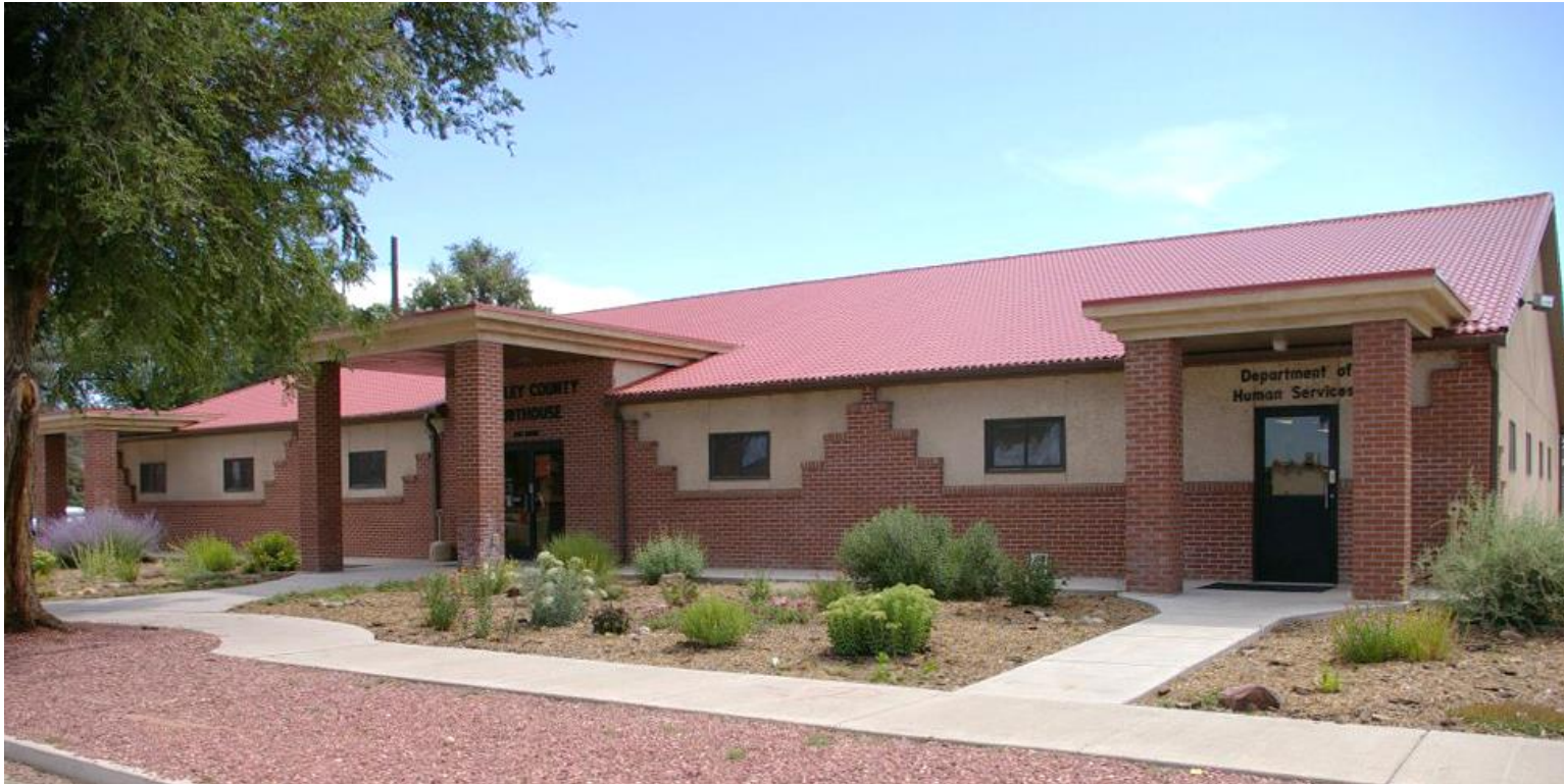
CROWLEY COUNTY COURT HOUSE – 2003