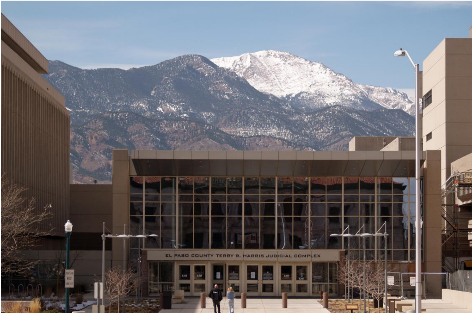
EL PASO COUNTY JUDICIAL COMPLEX – 2006

JUDICIAL BUILDING AT LEFT – COUNTY JAIL AT RIGHT