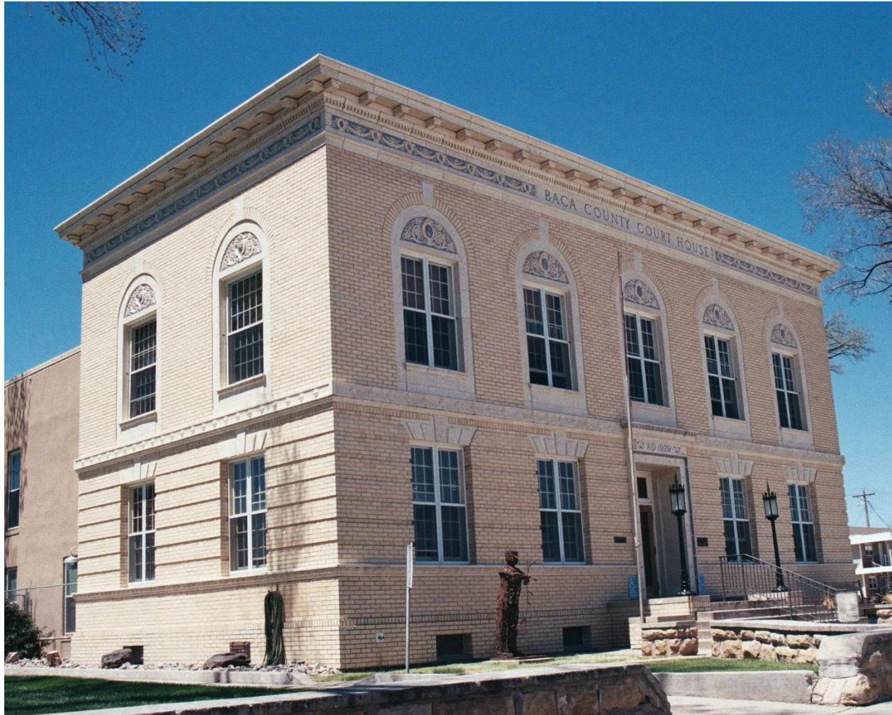
BACA COUNTY COURT HOUSE – 1917 SPRINGFIELD