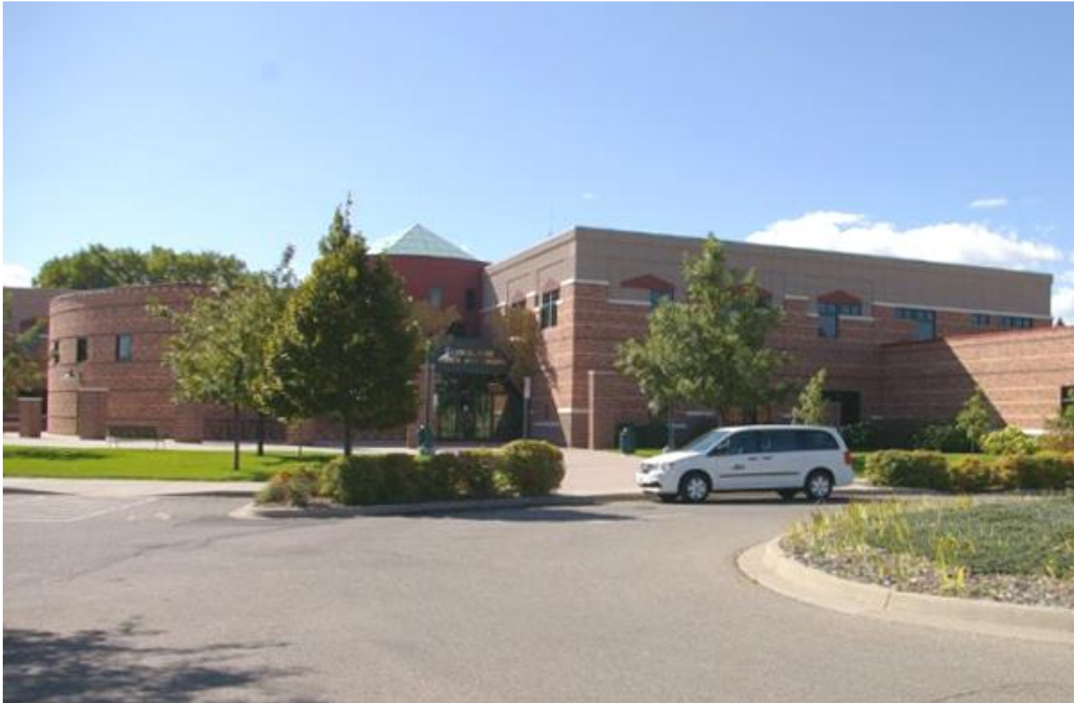
LARIMER COUNTY COURT HOUSE – 2003