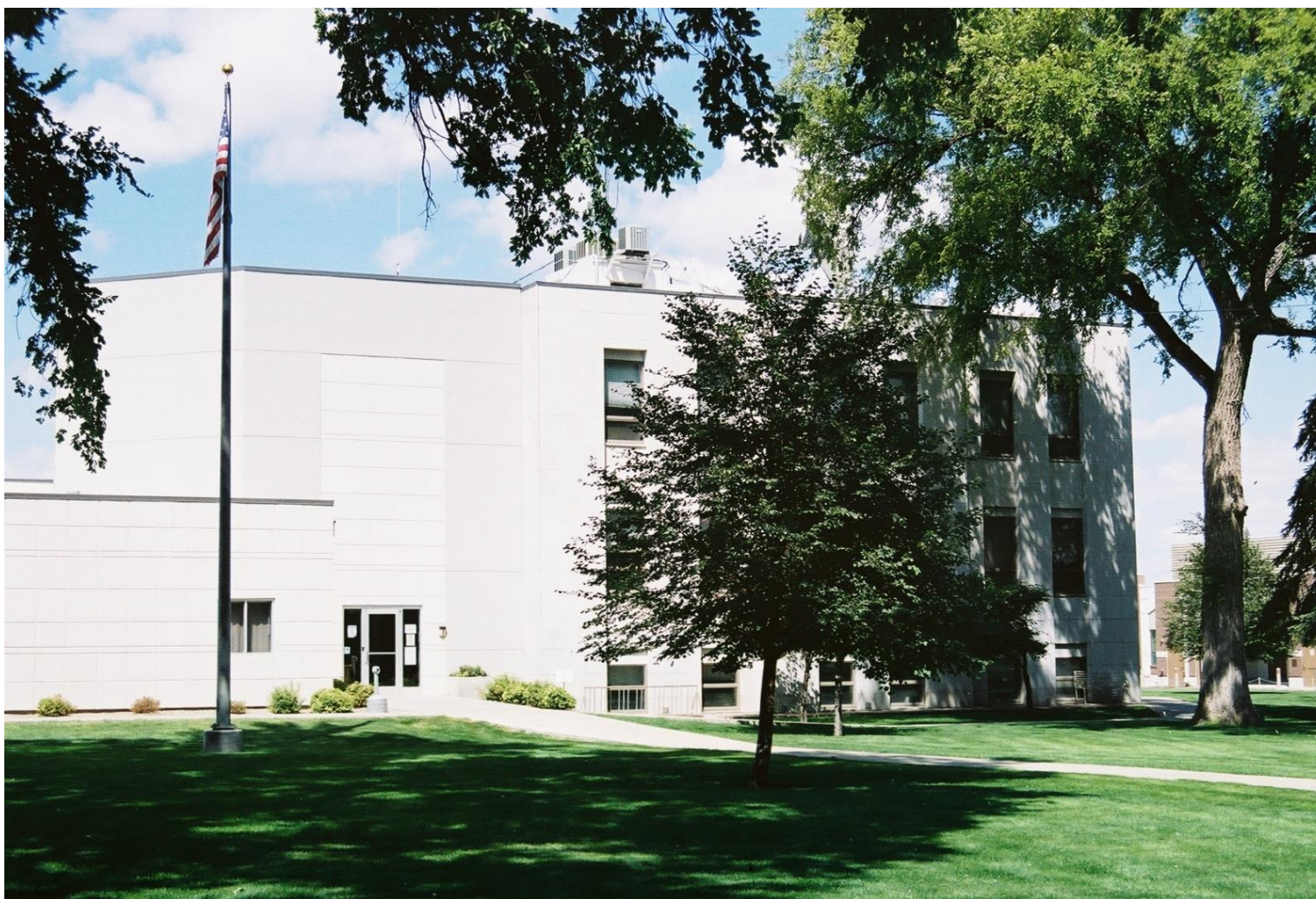
KIT CARSON COUNTY COURT HOUSE – 1909