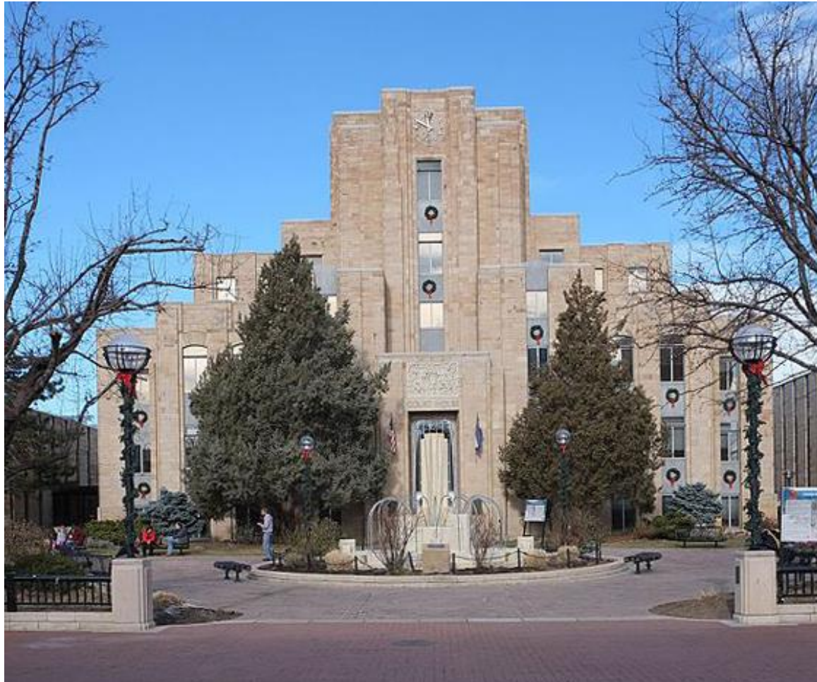
BOULDER COUNTY COURT HOUSE – 1934