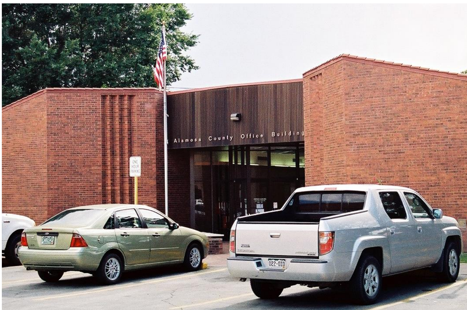
ALAMOSA COUNTY OFFICE BUILDING – 1975