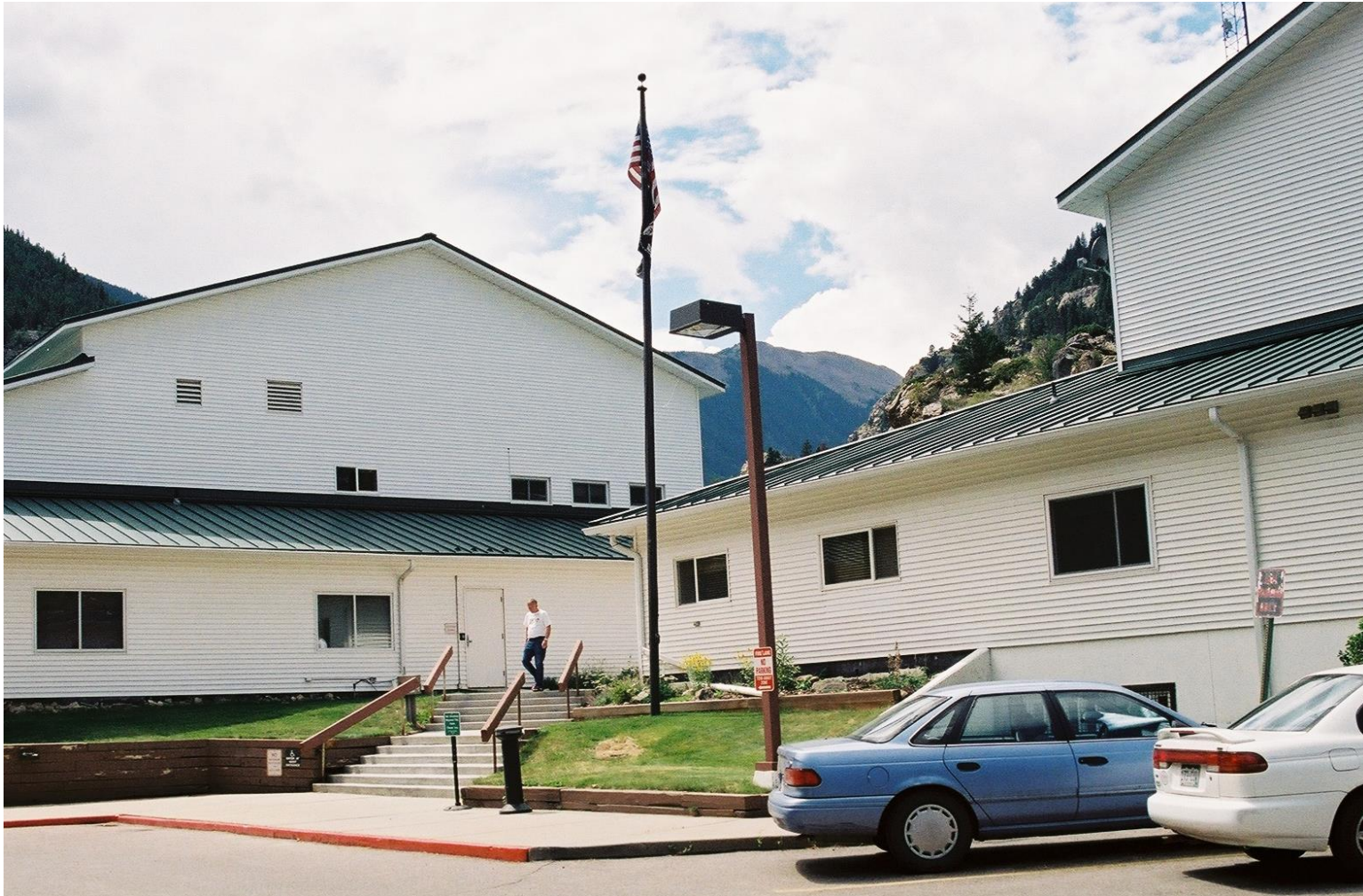
CLEAR CREEK COUNTY COURT HOUSE – 1977