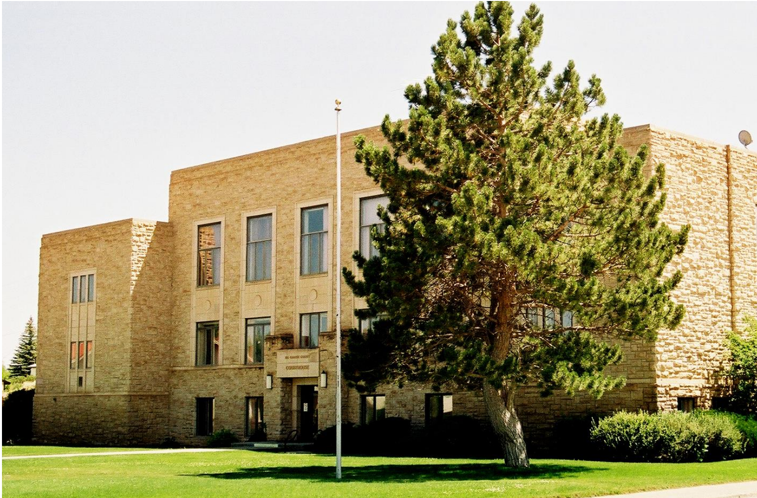
RIO GRANDE COUNTY COURT HOUSE – 1949