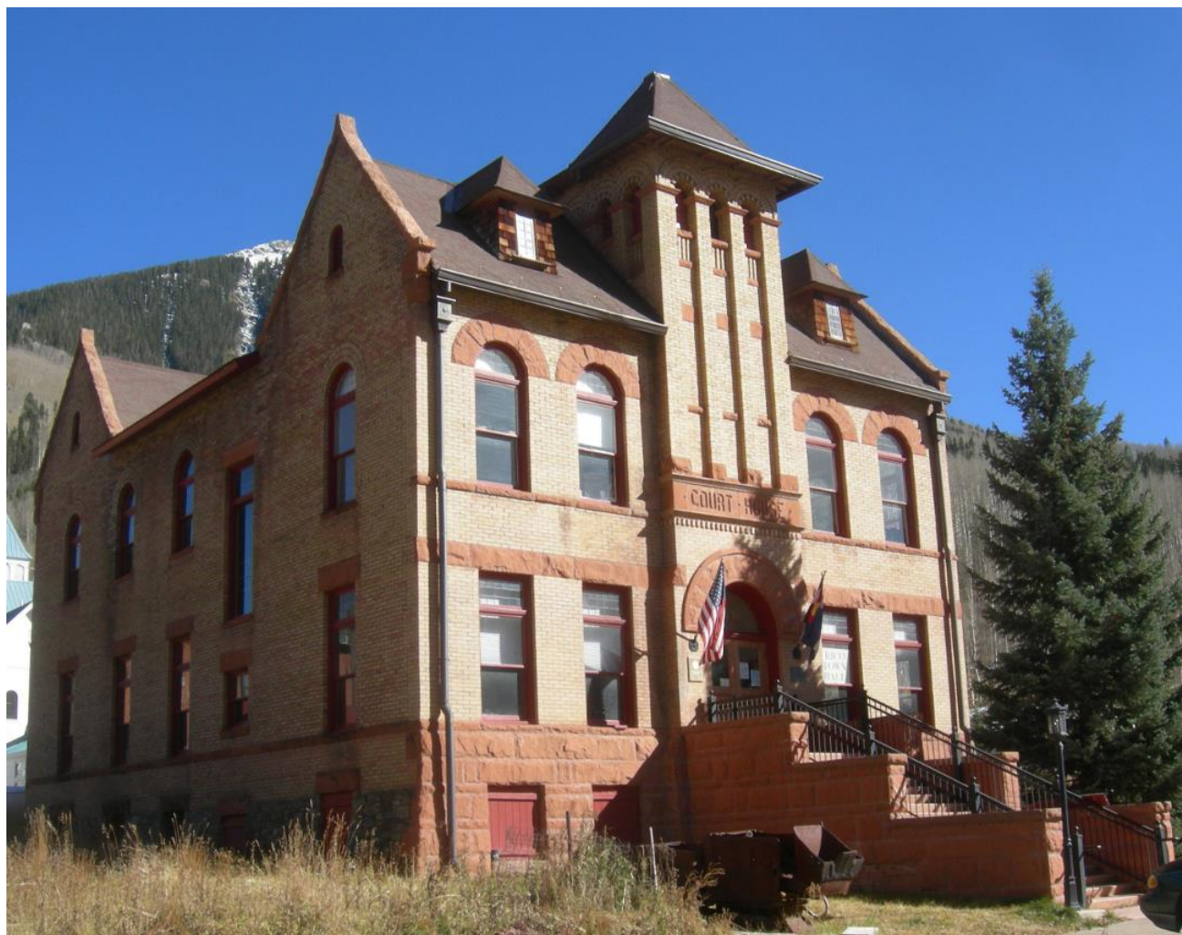
FORMER DOLORES COUNTY COURT HOUSE – 1892-1945