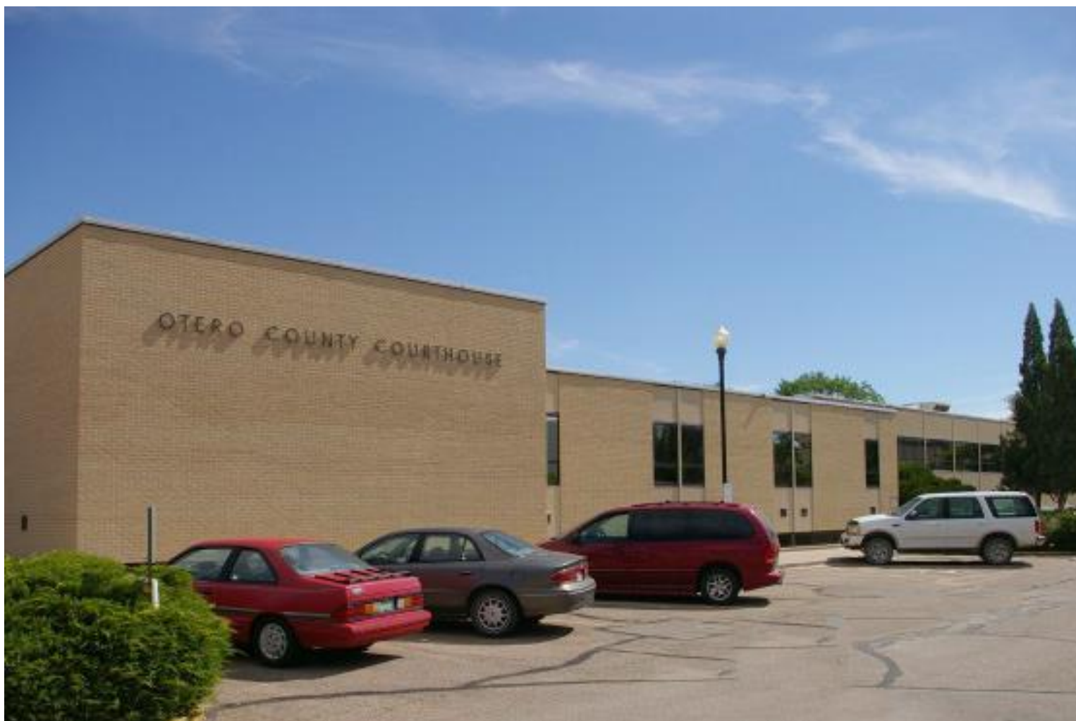
OTERO COUNTY COURT HOUSE – 1958