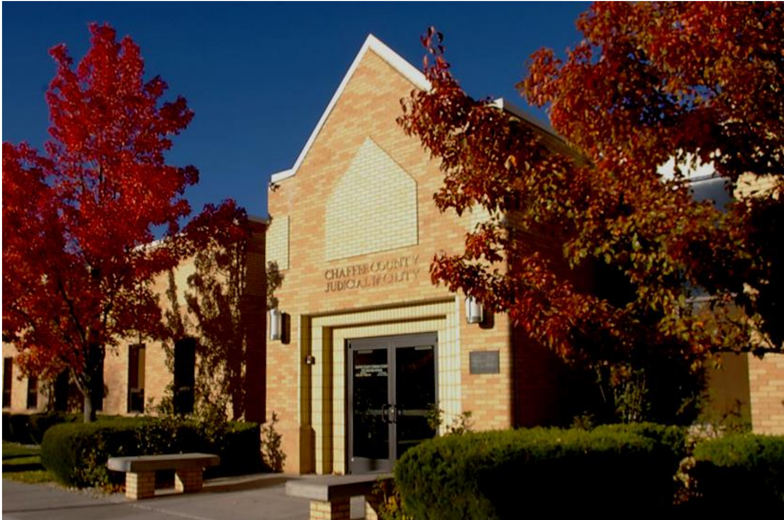
CHAFFEE COUNTY JUDICIAL FACILITY – 1991