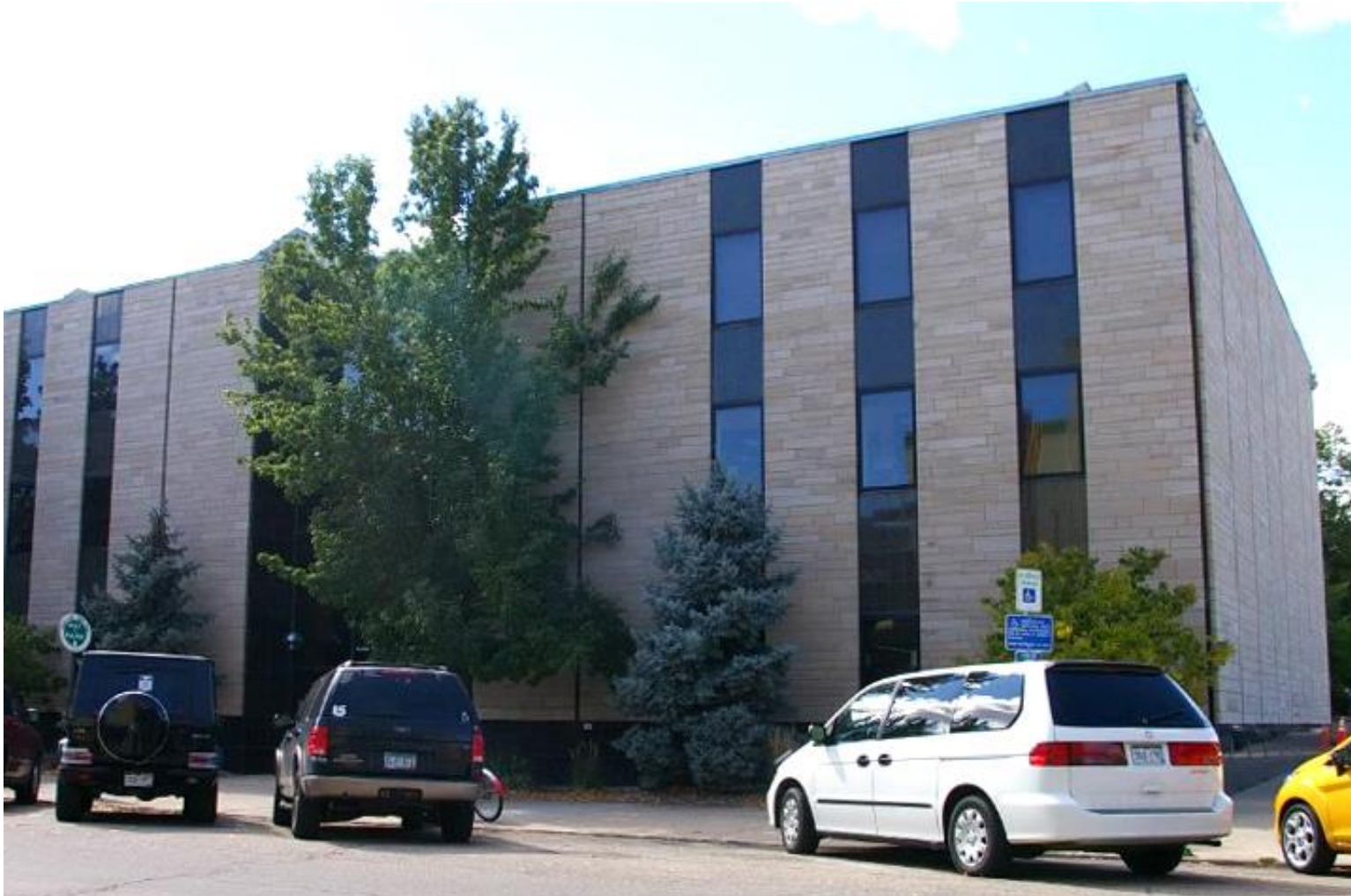
BOULDER COUNTY HALL OF JUSTICE – 1961