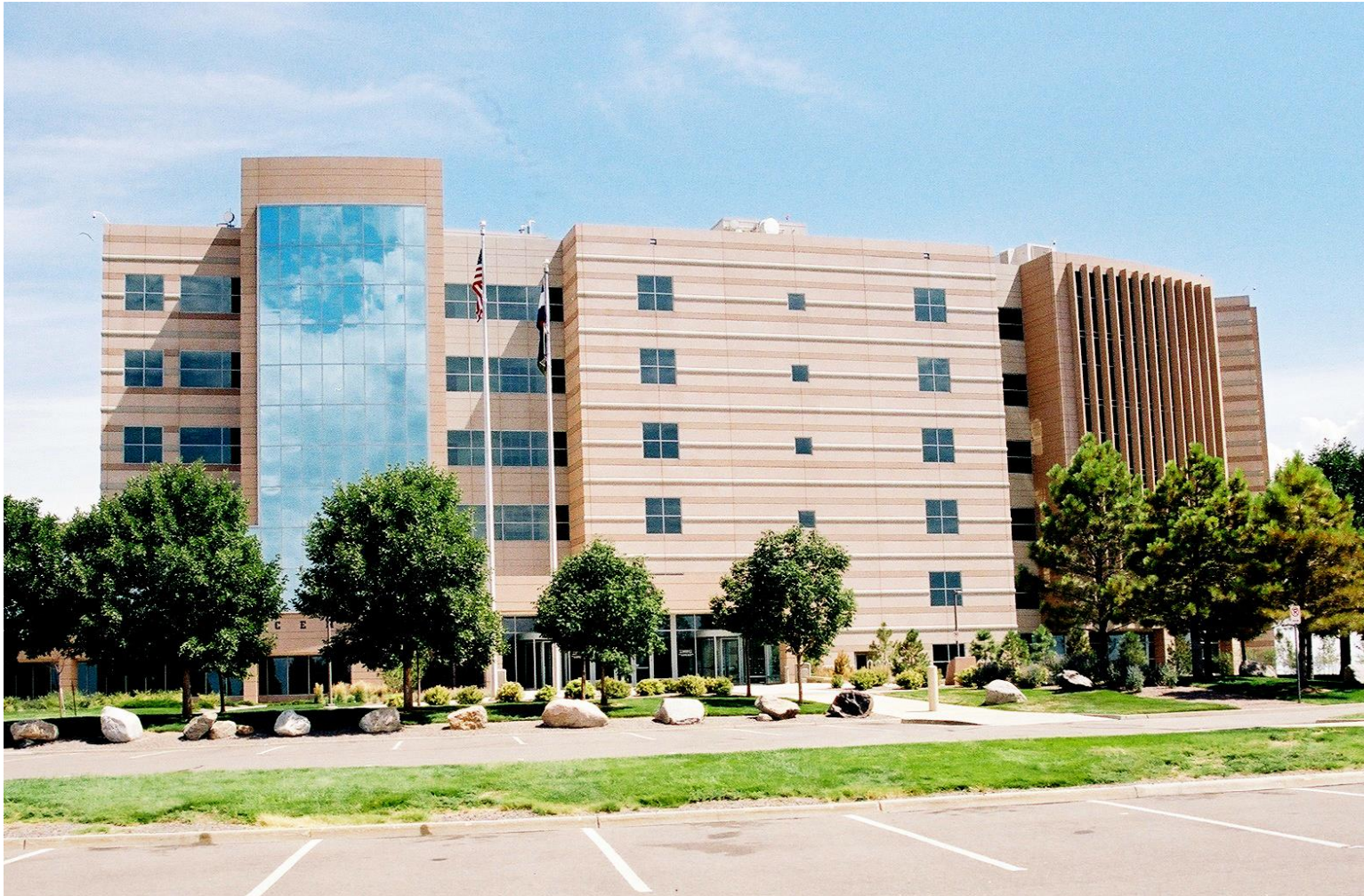
ADAMS COUNTY OFFICE BUILDING – 1998