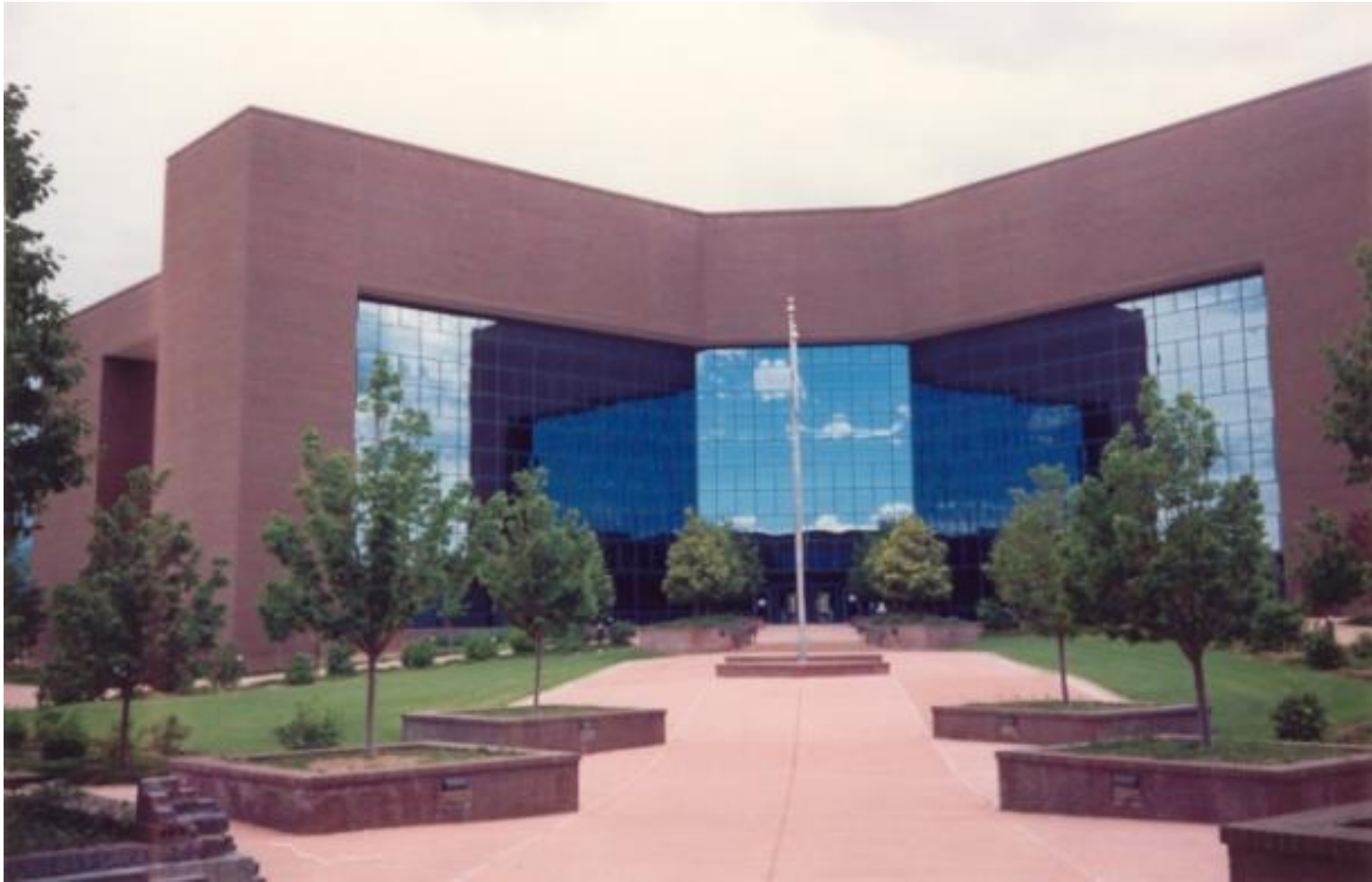
ARAPAHOE COUNTY JUSTICE CENTER – 1998