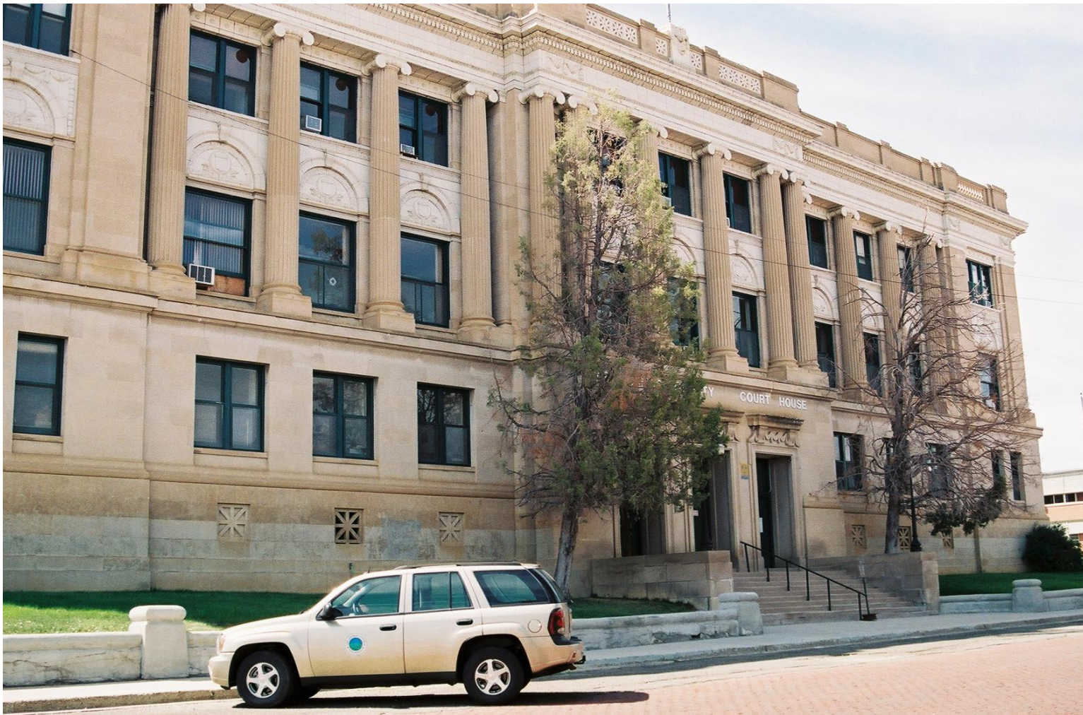
LAS ANIMAS COUNTY COURT HOUSE – 1913