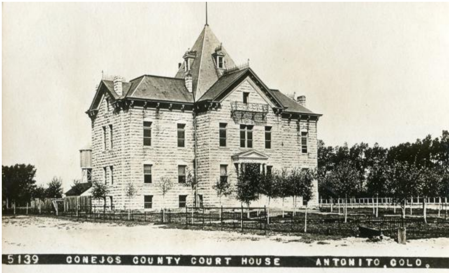
OLD CONEJOS COUNTY COURT HOUSE – 1890-1980