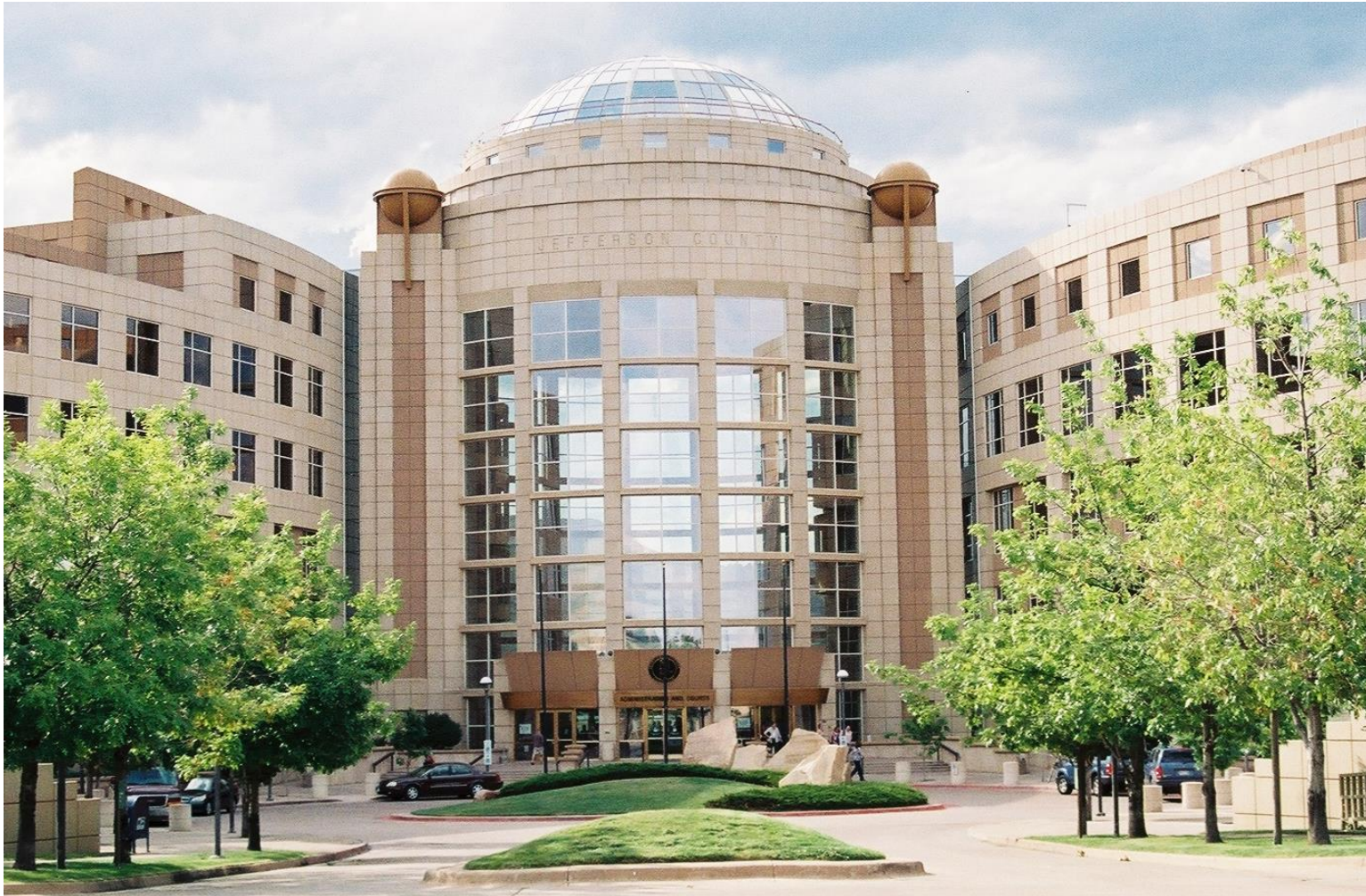
JEFFERSON COUNTY COURT HOUSE