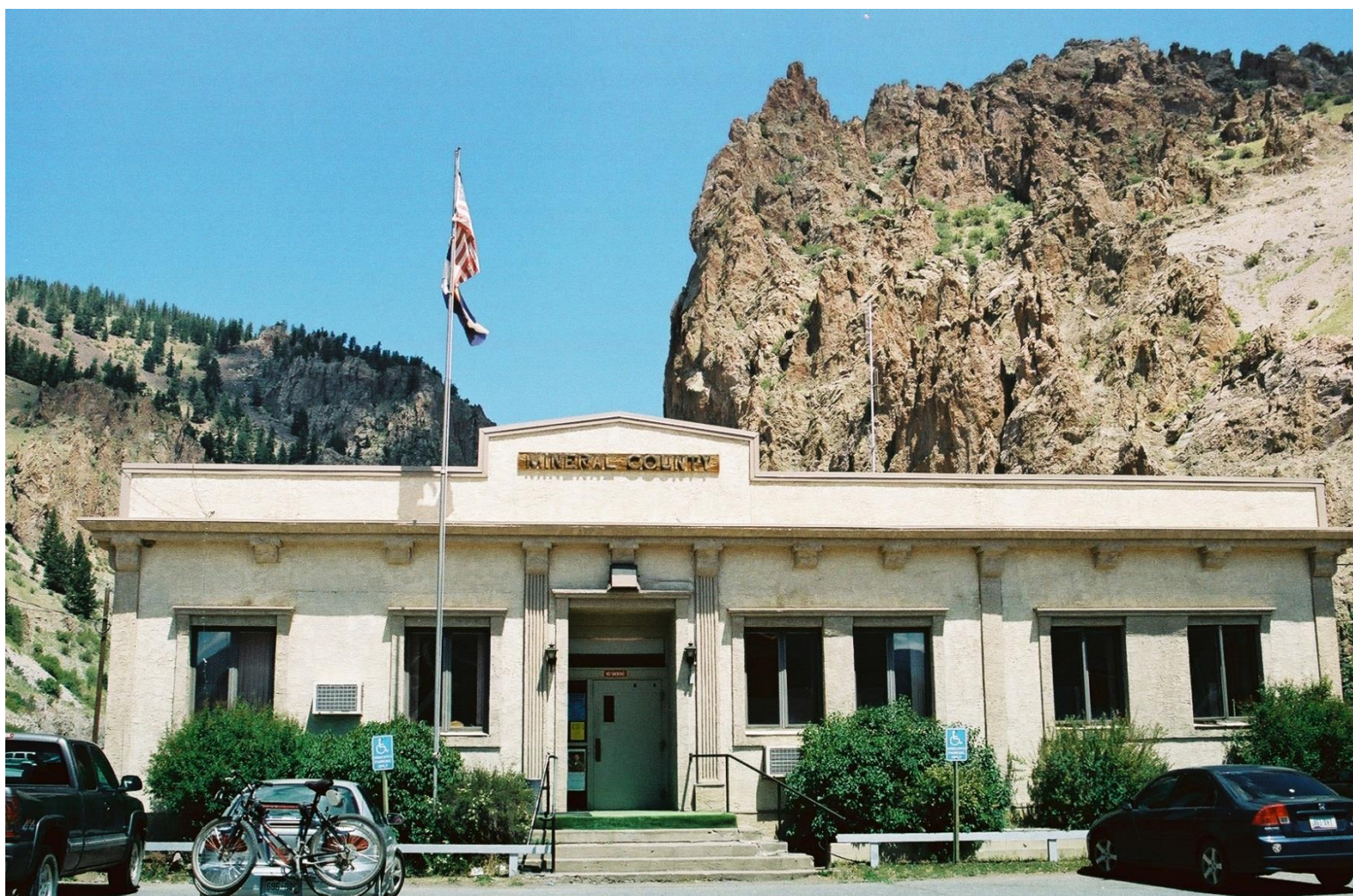
MINERAL COUNTY COURT HOUSE – 1950