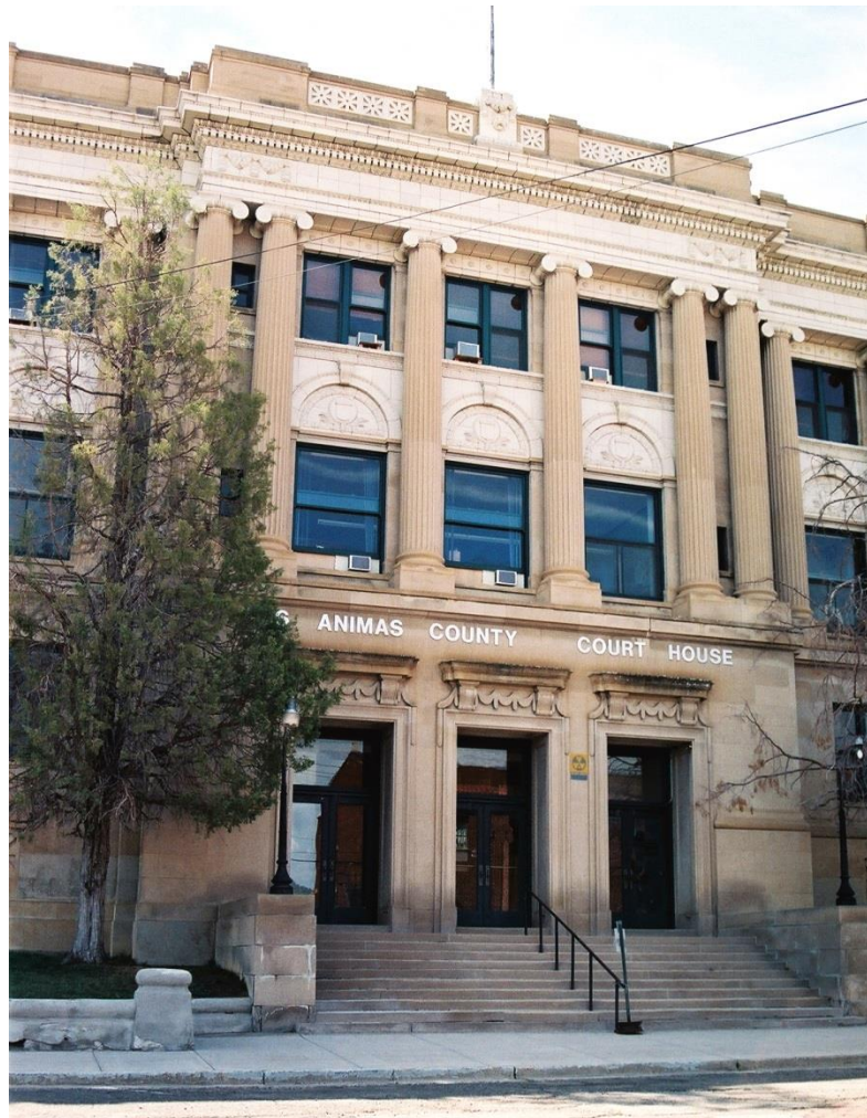
LAS ANIMAS COUNTY COURT HOUSE ENTRANCE DETAILS