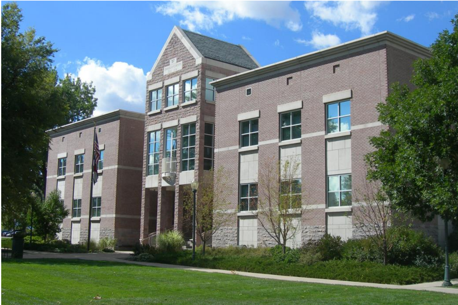
DOUGLAS COUNTY COURT HOUSE – 1981