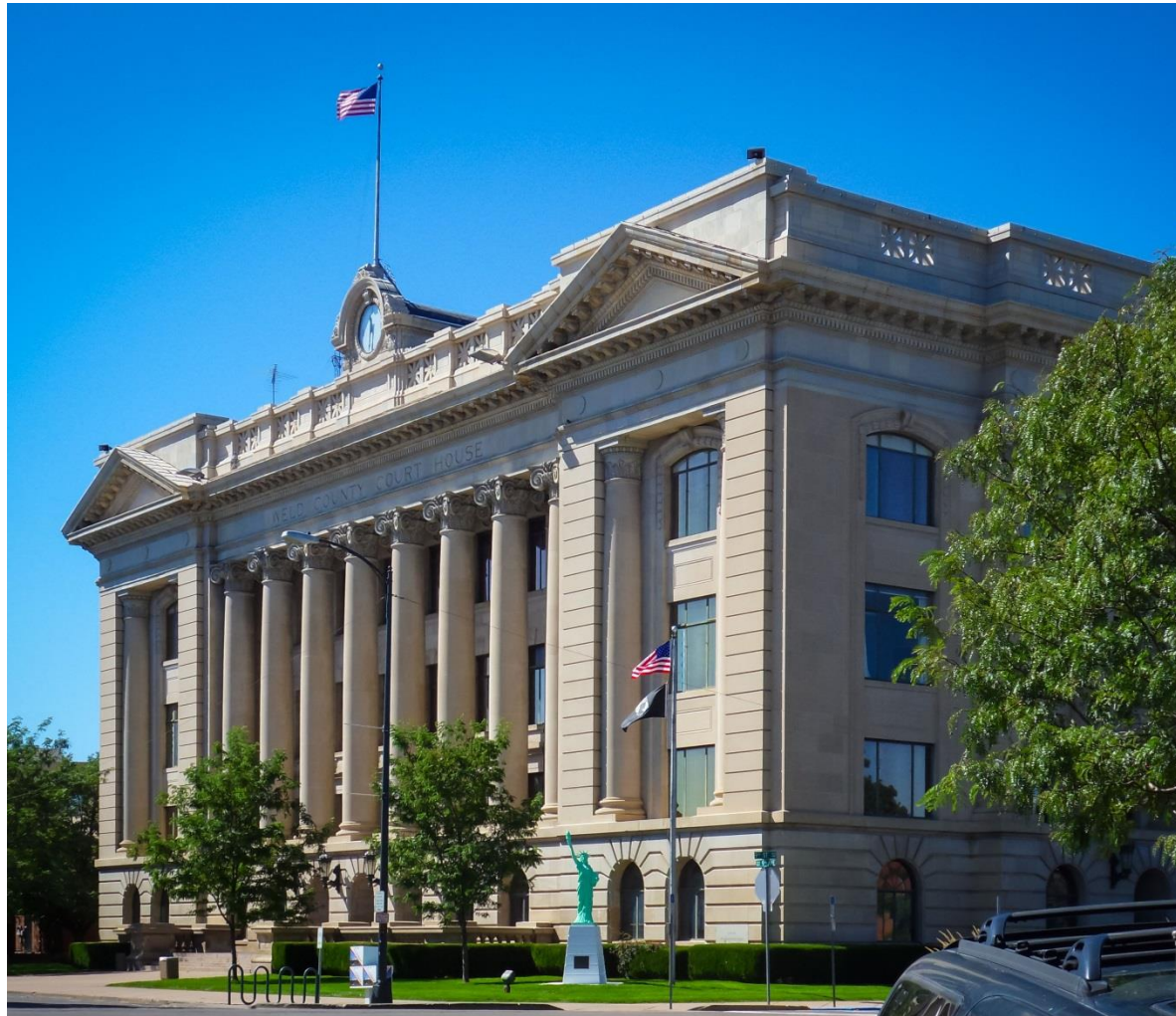
WELD COUNTY COURT HOUSE – 1917