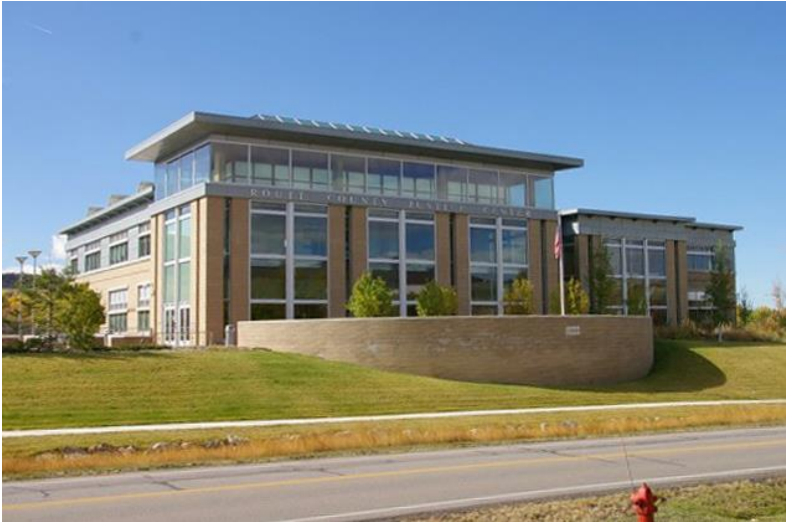
ROUTT COUNTY JUSTICE CENTER