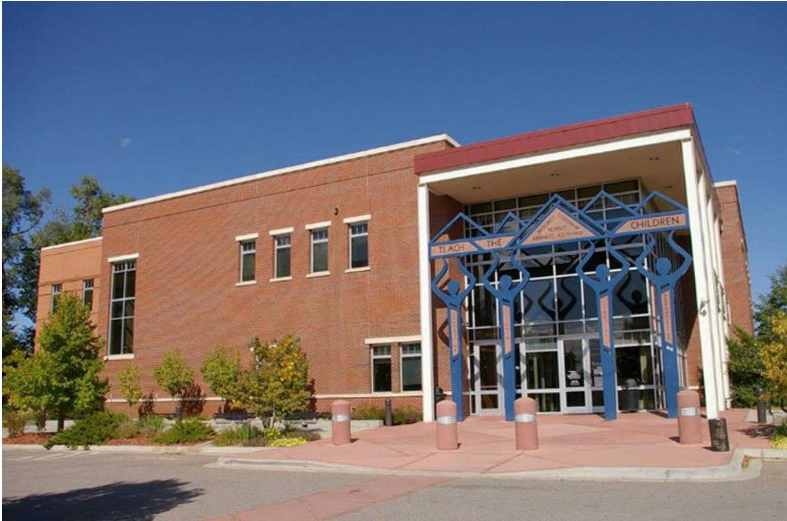
BOULDER COUNTY COURTS BUILDING – 2001