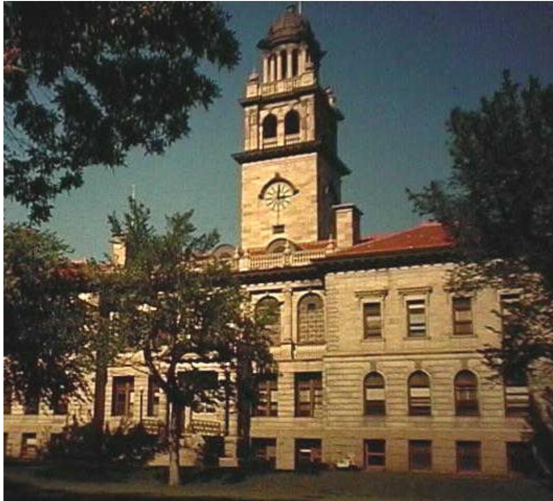
FORMER EL PASO COUNTY COURT HOUSE – 1903