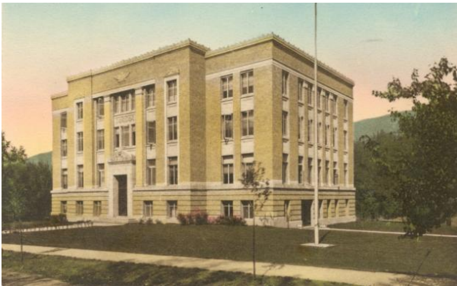
GARFIELD COUNTY BUILDING – 1930