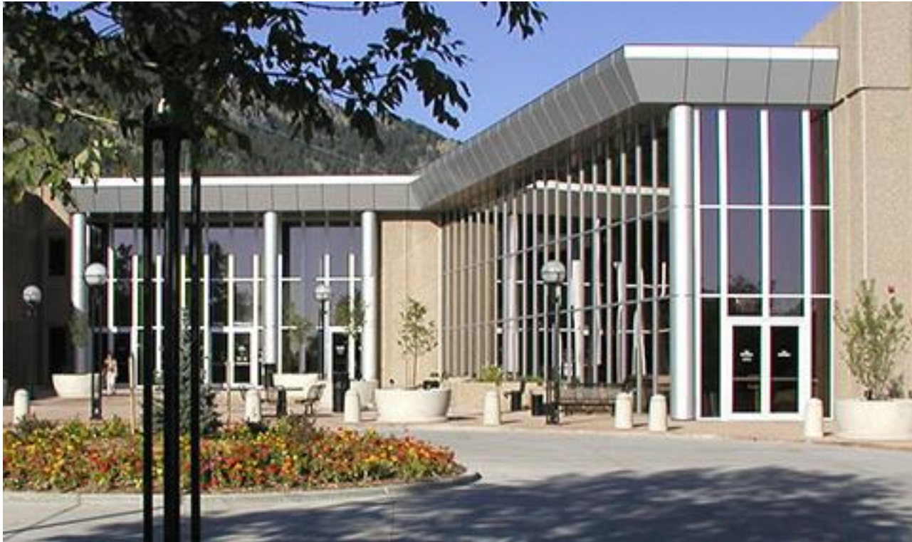
BOULDER COUNTY JUDICIAL CENTER – 1976