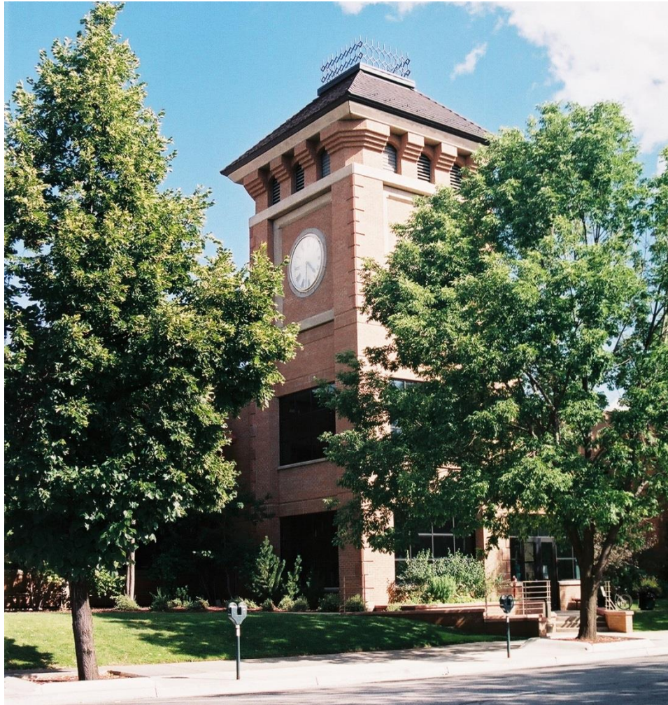
LA PLATA COUNTY COURT HOUSE – 1959