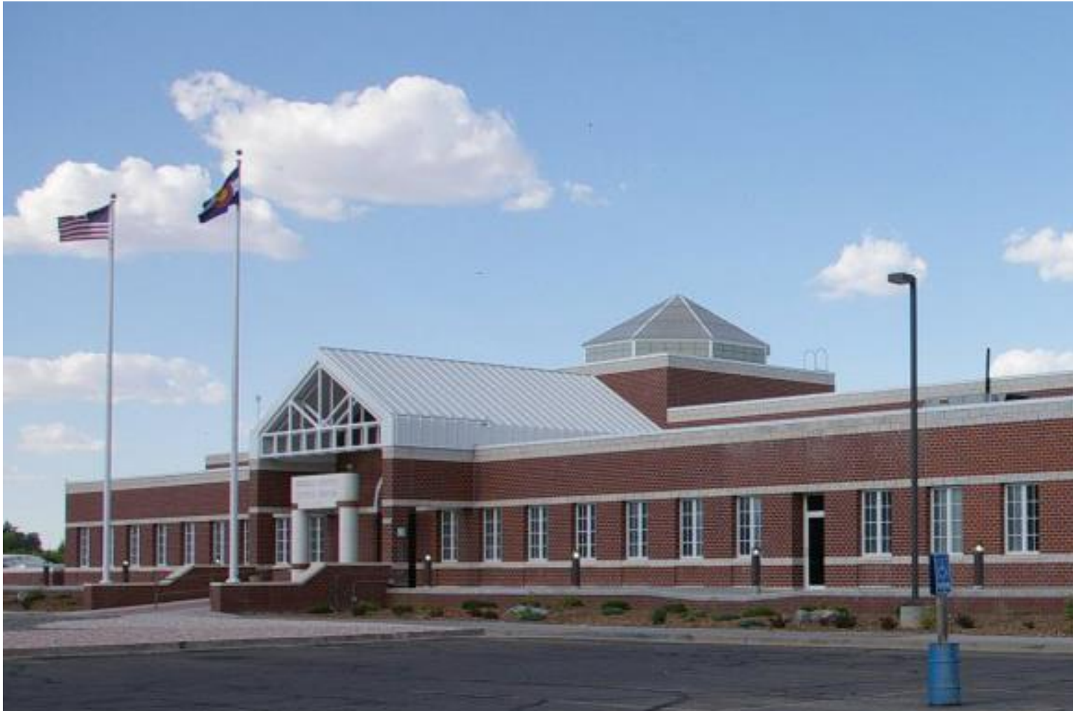
MORGAN COUNTY JUSTICE CENTER – 1988