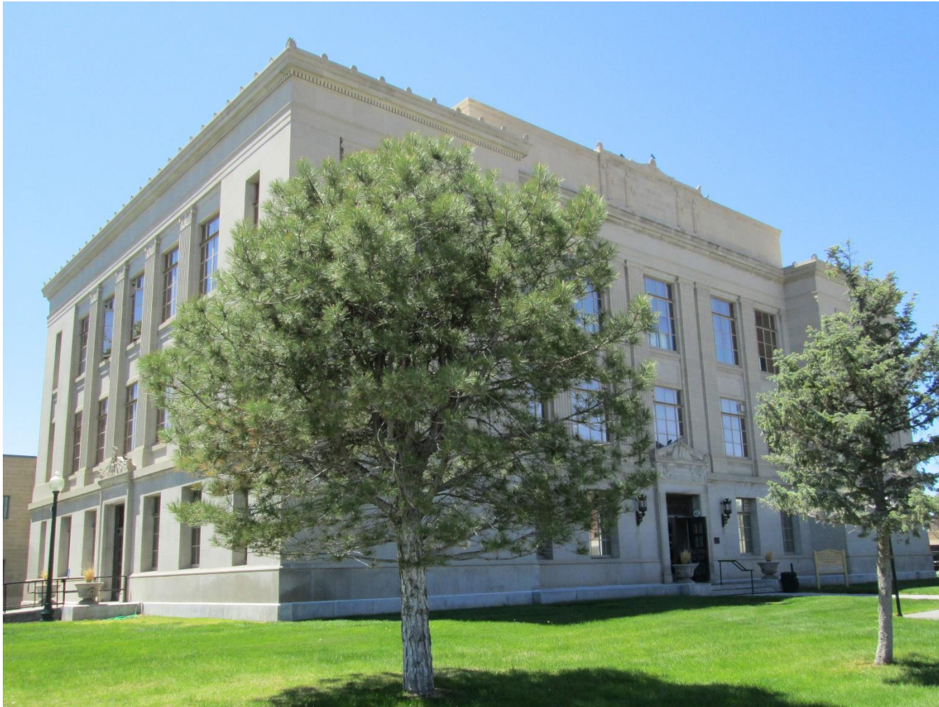
PROWERS COUNTY BUILDING – 1929