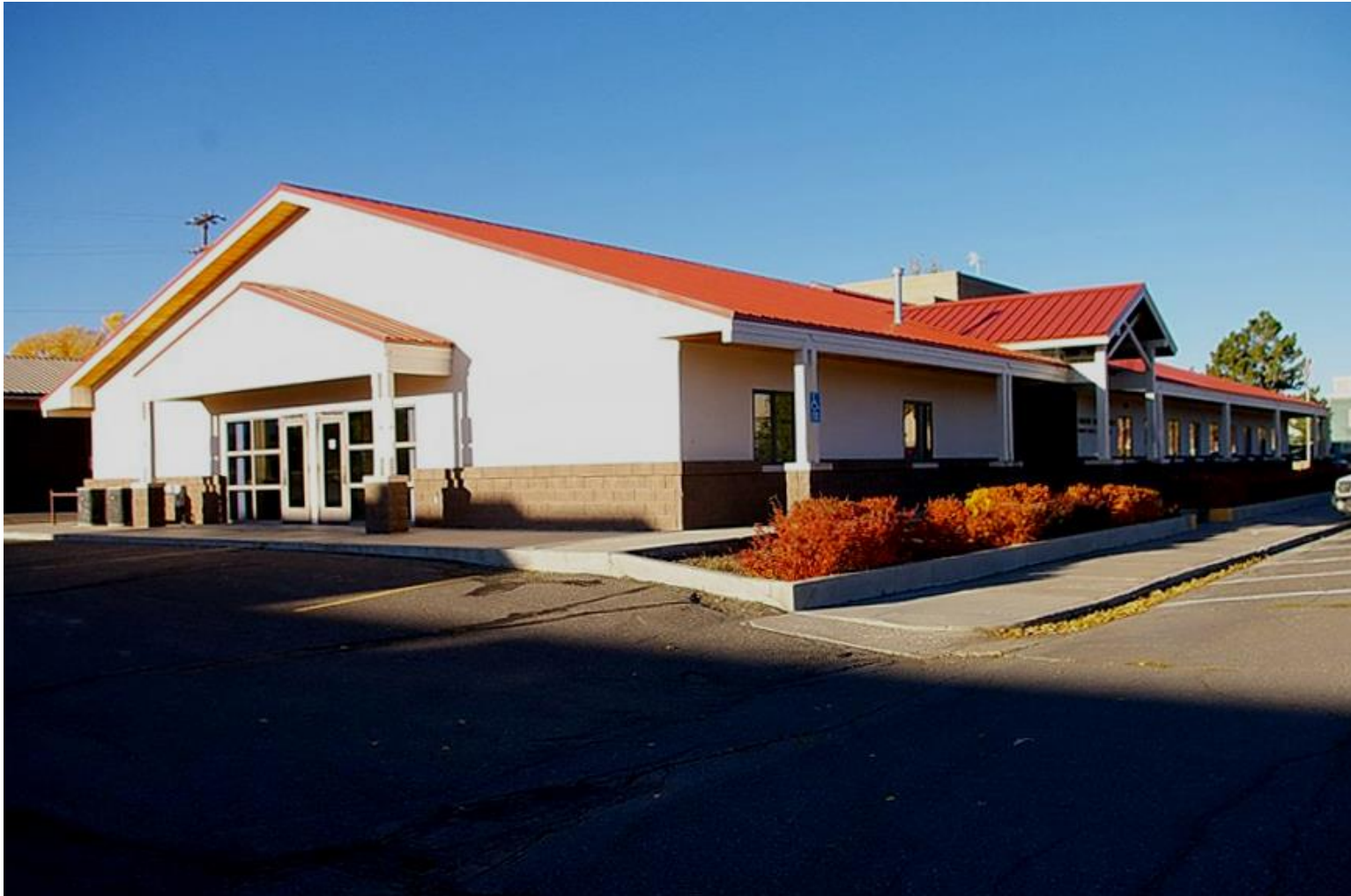
RIO GRANDE COUNTY ANNEX – 1997