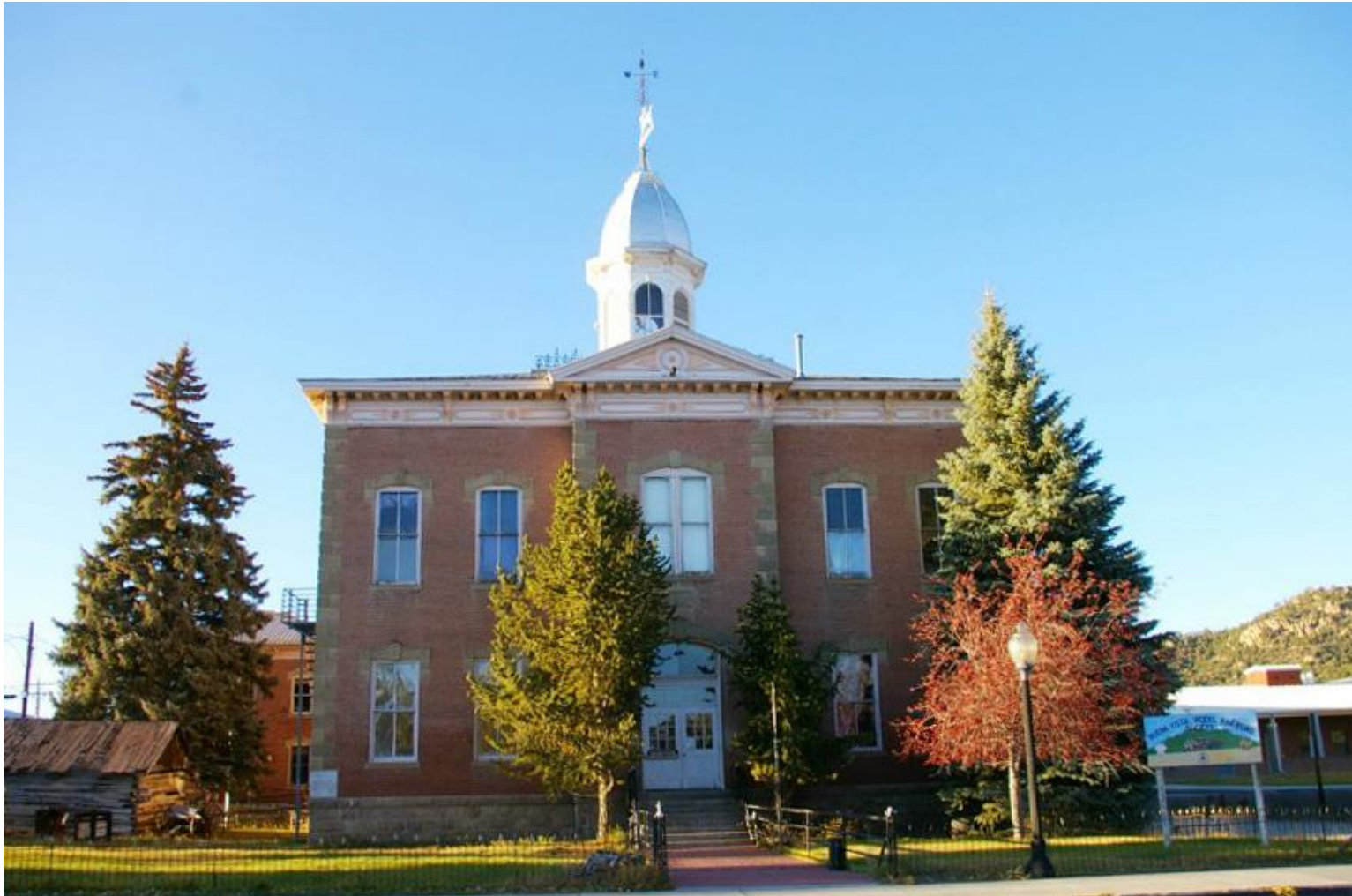
FORMER CHAFFEE COUNTY COURT HOUSE – 1883