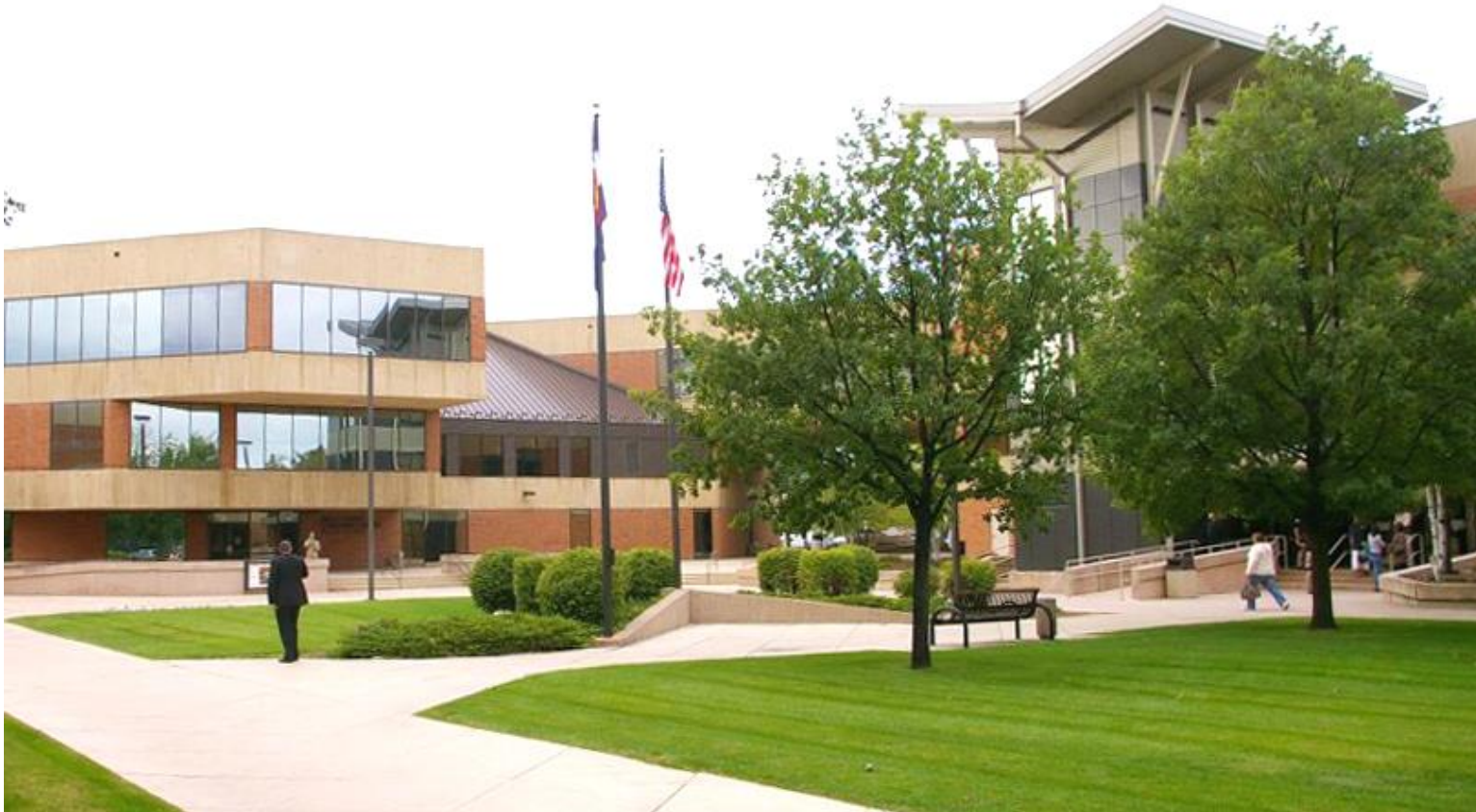
WELD COUNTY CENTENNIAL CENTER – 1976