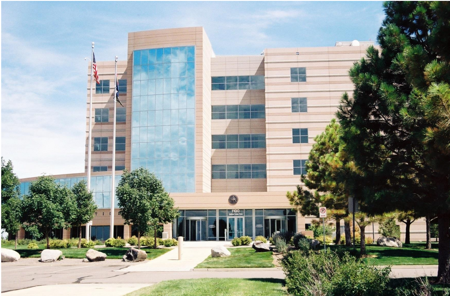
ADAMS COUNTY JUDICIAL CENTER – 1998