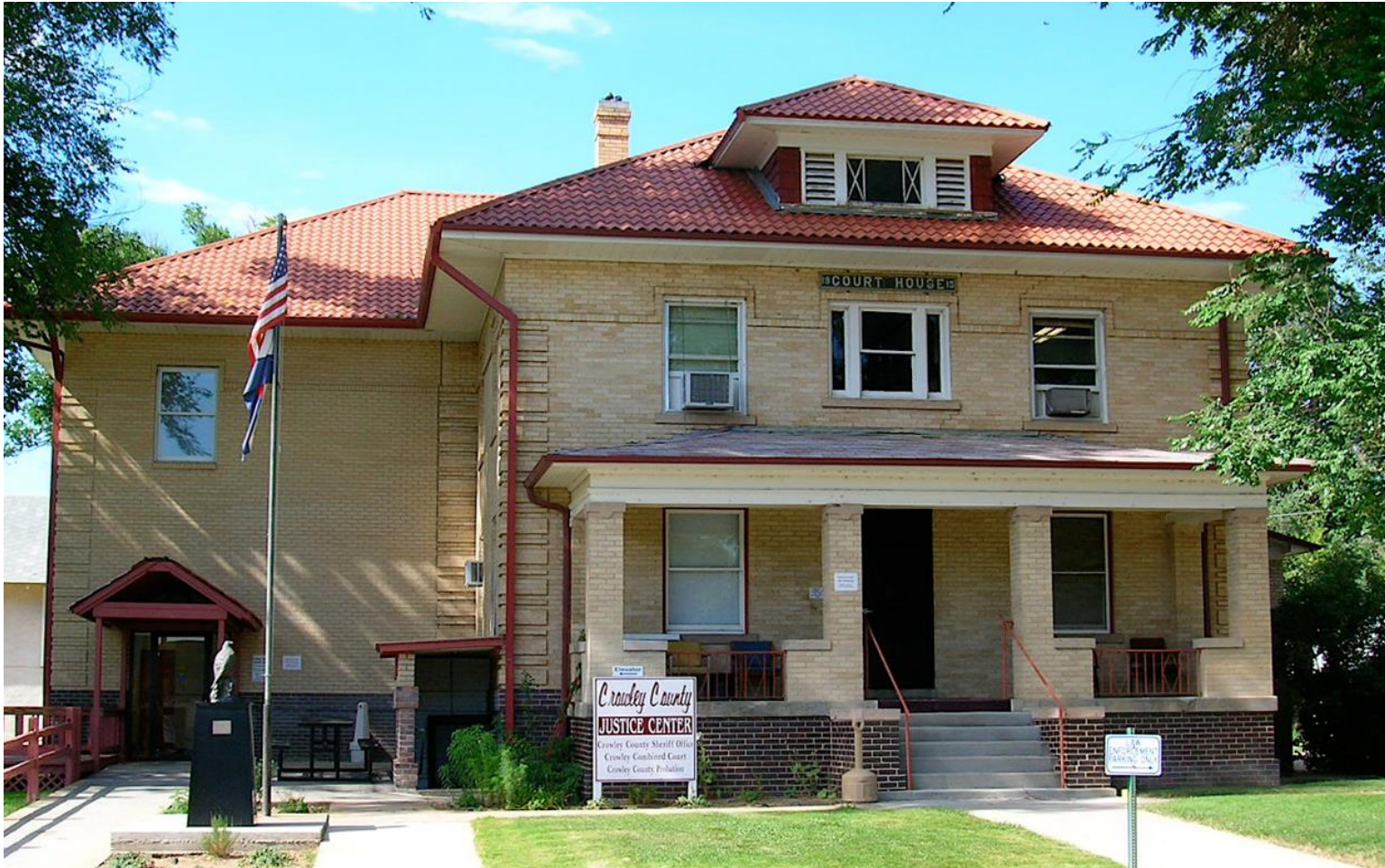
FORMER CROWLEY COUNTY COURT HOUSE – 1916