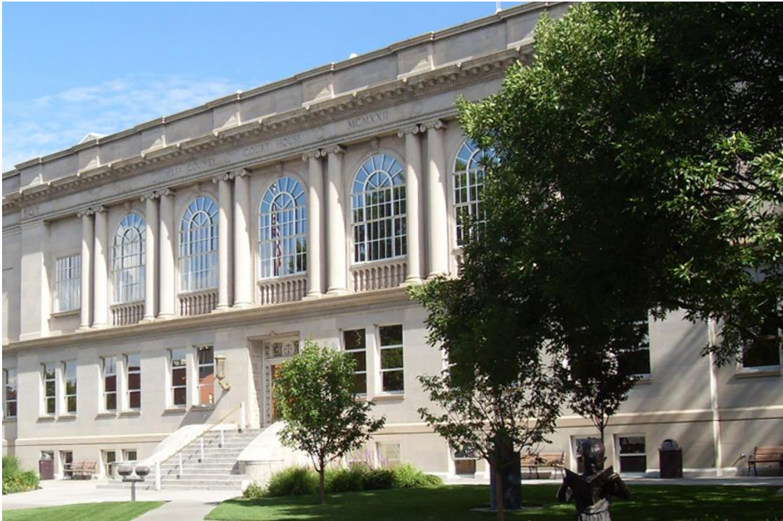
MESA COUNTY COURT HOUSE – 1924