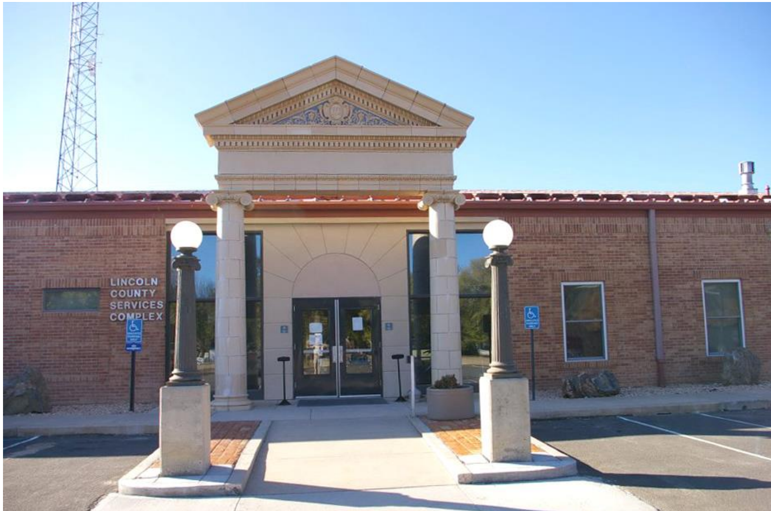
LINCOLN COUNTY COURT HOUSE ENTRANCE FROM FORMER COURT HOUSE