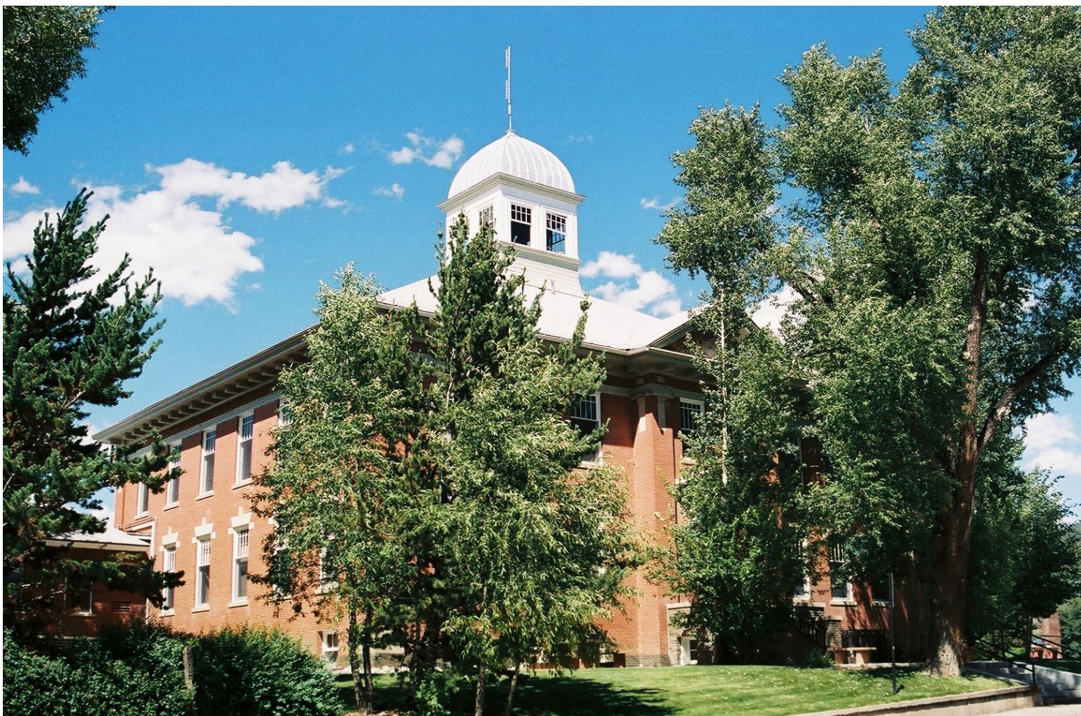
SUMMIT COUNTY COURT HOUSE – 1909