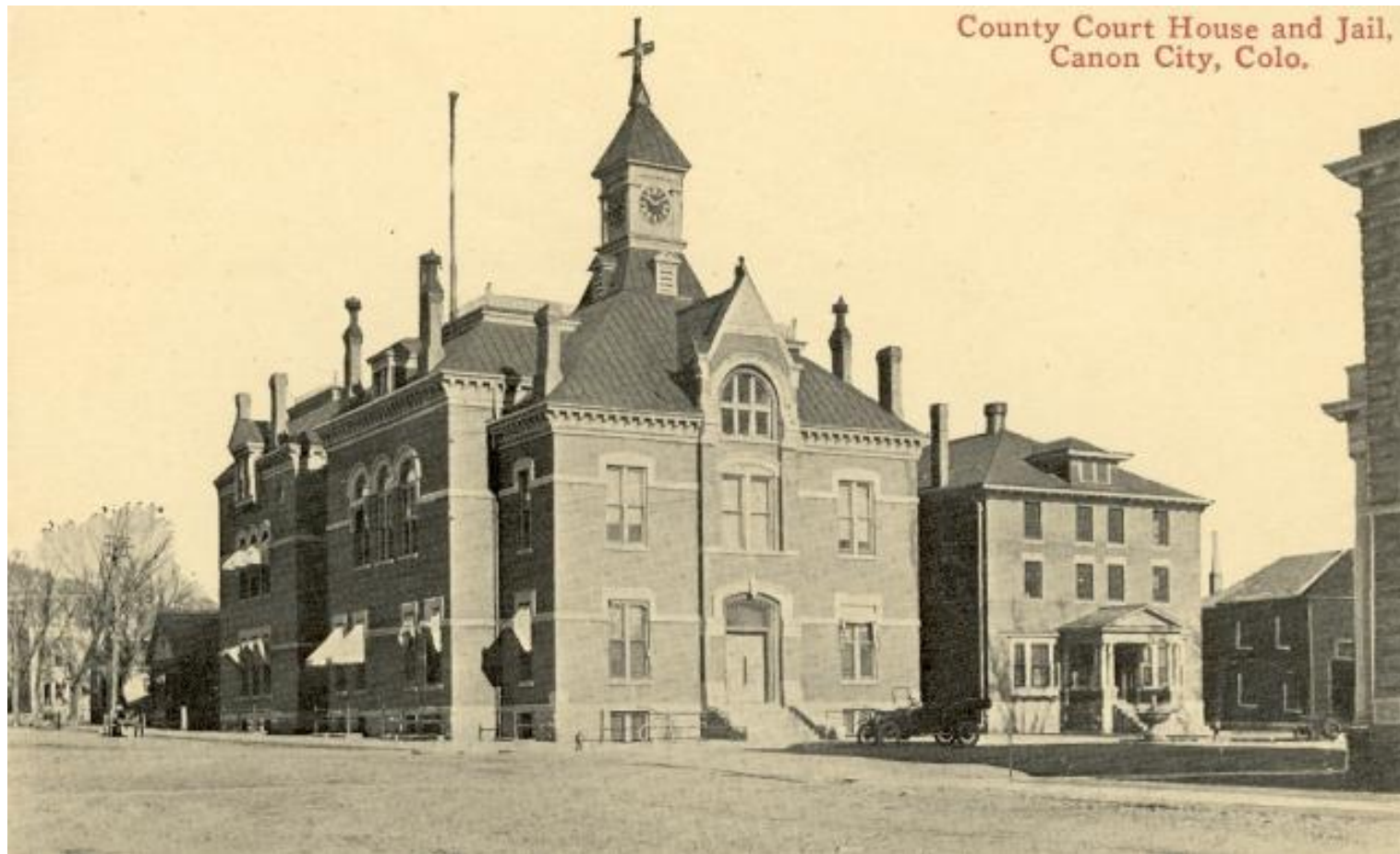
OLD FREMONT COUNTY COURT HOUSE