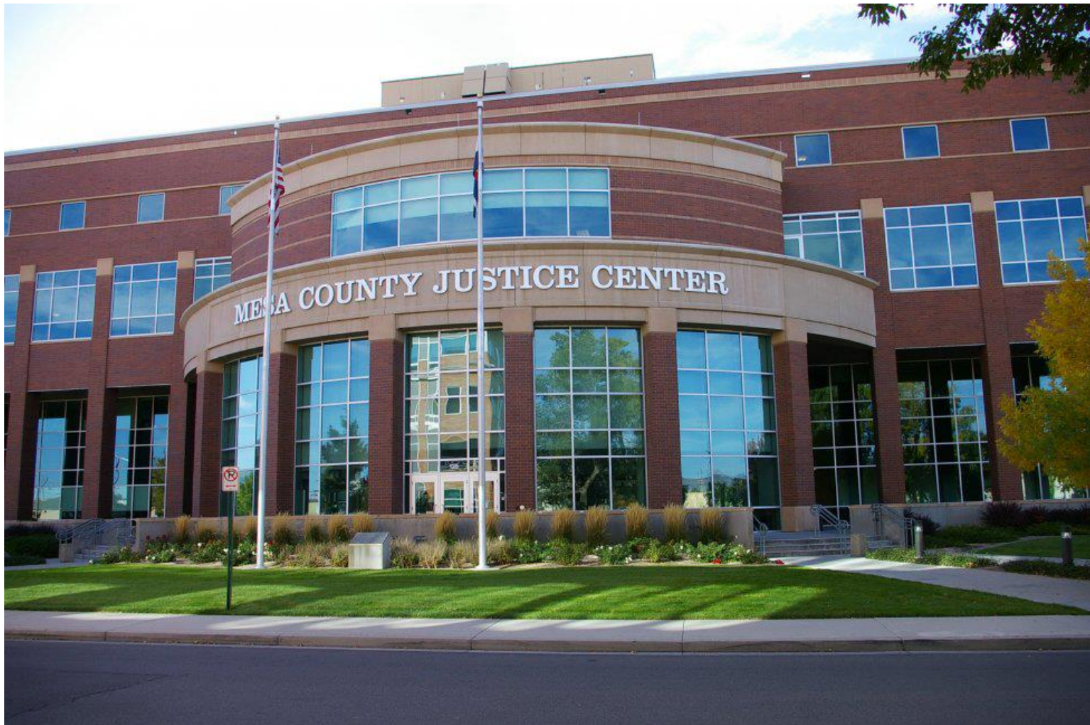
MESA COUNTY JUSTICE CENTER – 2000