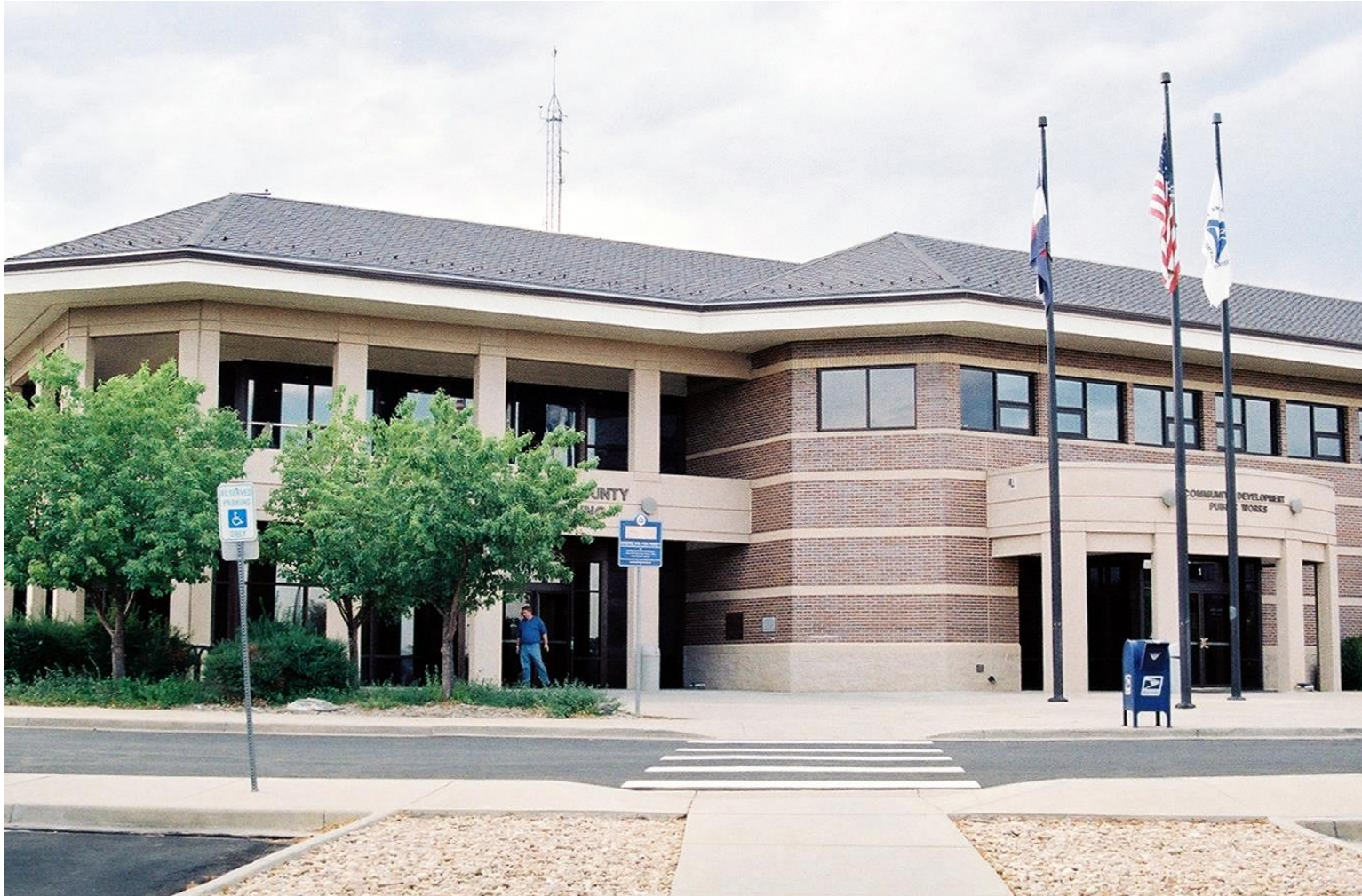
BROOMFIELD CITY-COUNTY BUILDING – 2003