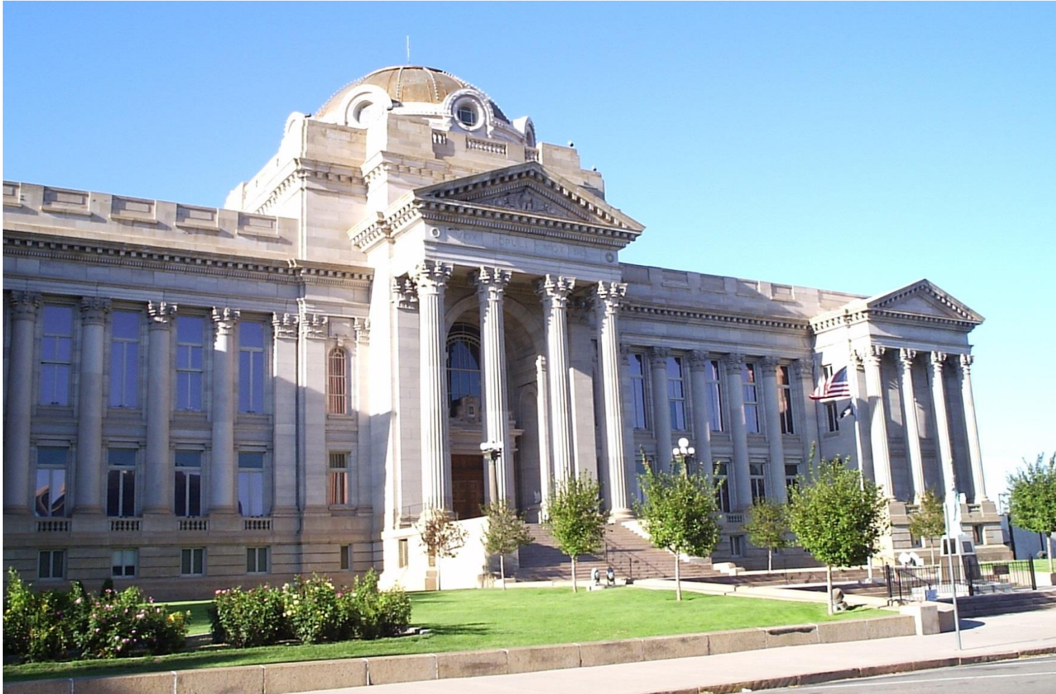
PUEBLO COUNTY COURT HOUSE – 1912