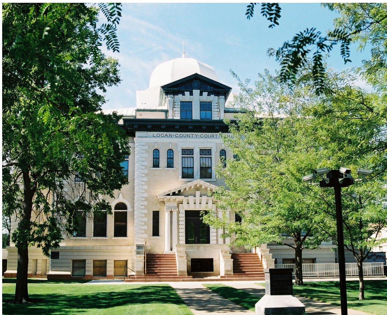
LOGAN COUNTY COURT HOUSE – 1910