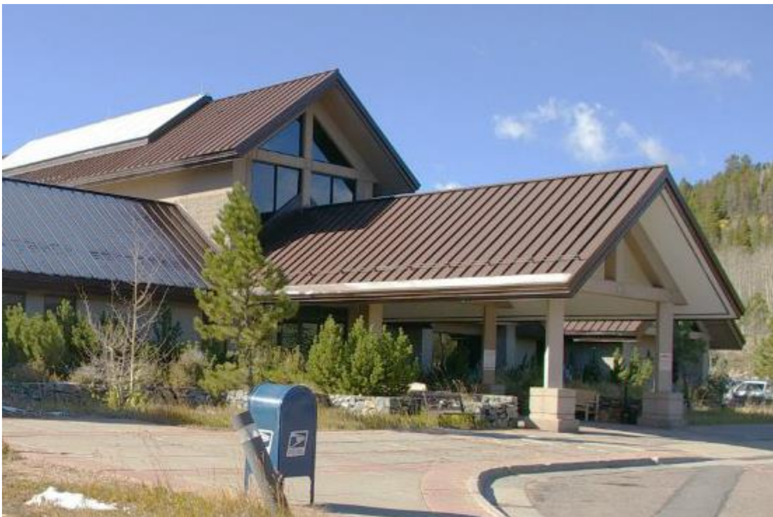
GILPIN COUNTY JUDICIAL CENTER – 1995