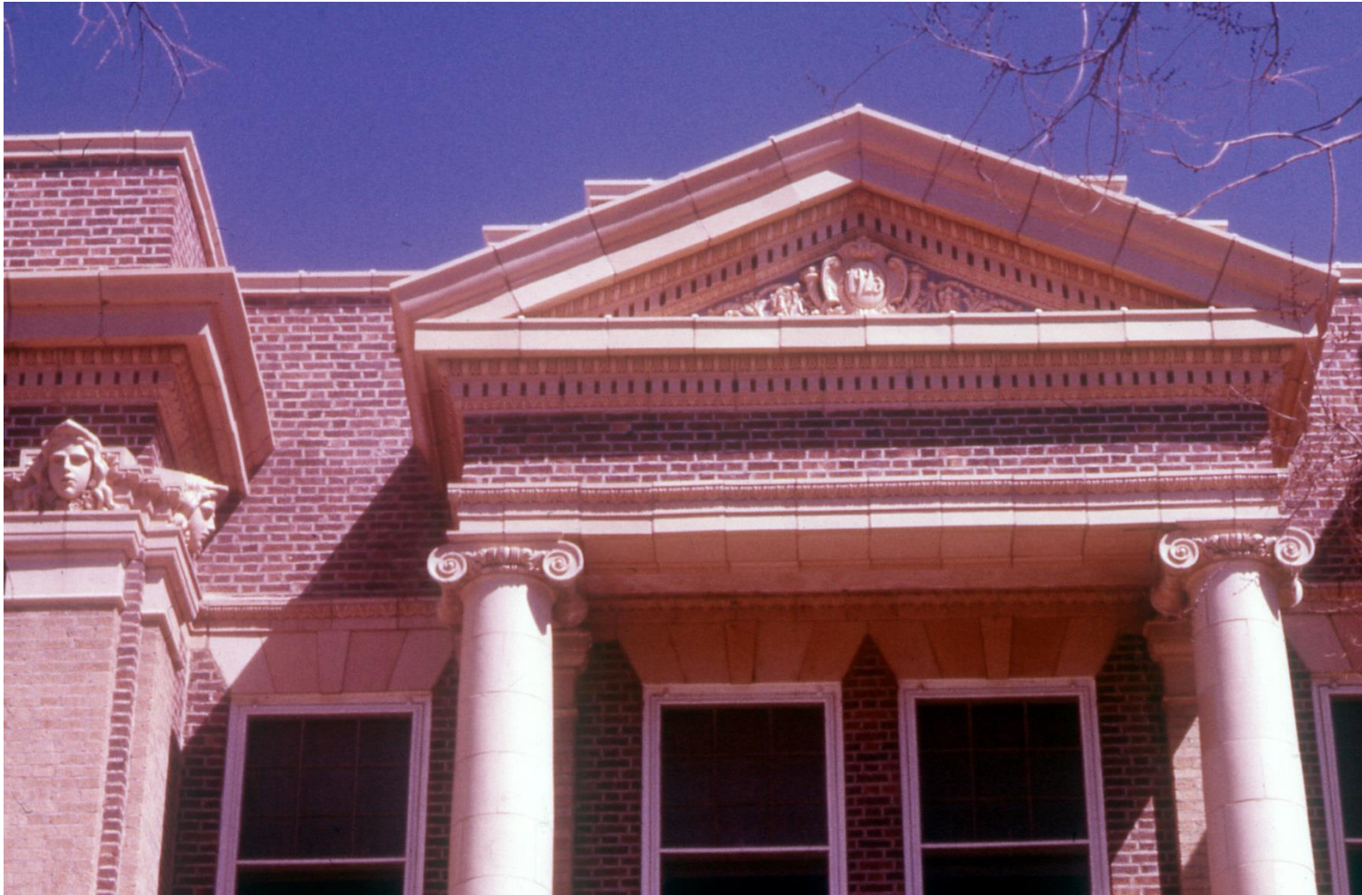
FORMER LINCOLN COUNTY COURT HOUSE