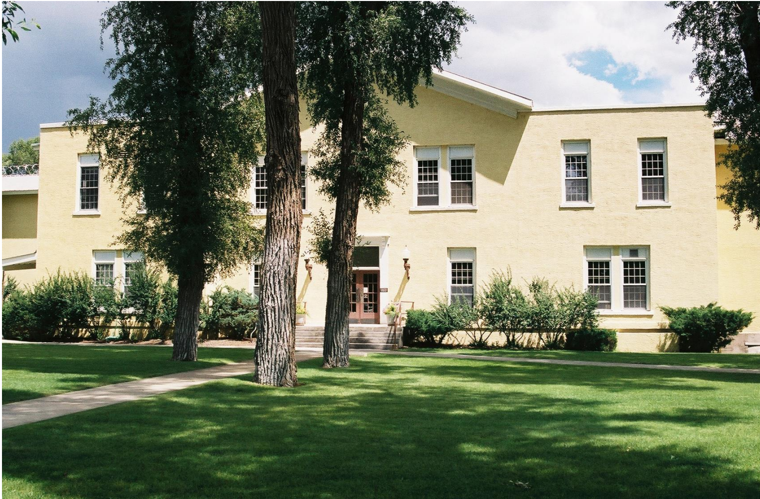
GUNNISON COUNTY COURT HOUSE – 1881