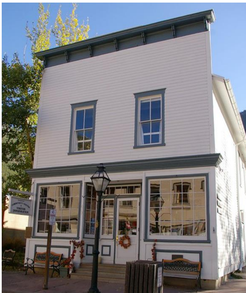
FORMER CLEAR CREEK COUNTY COURT HOUSE – 1868