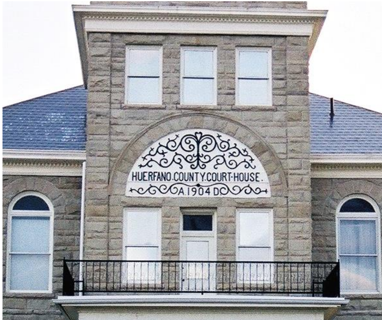
HUERFANO COUNTY COURT HOUSE