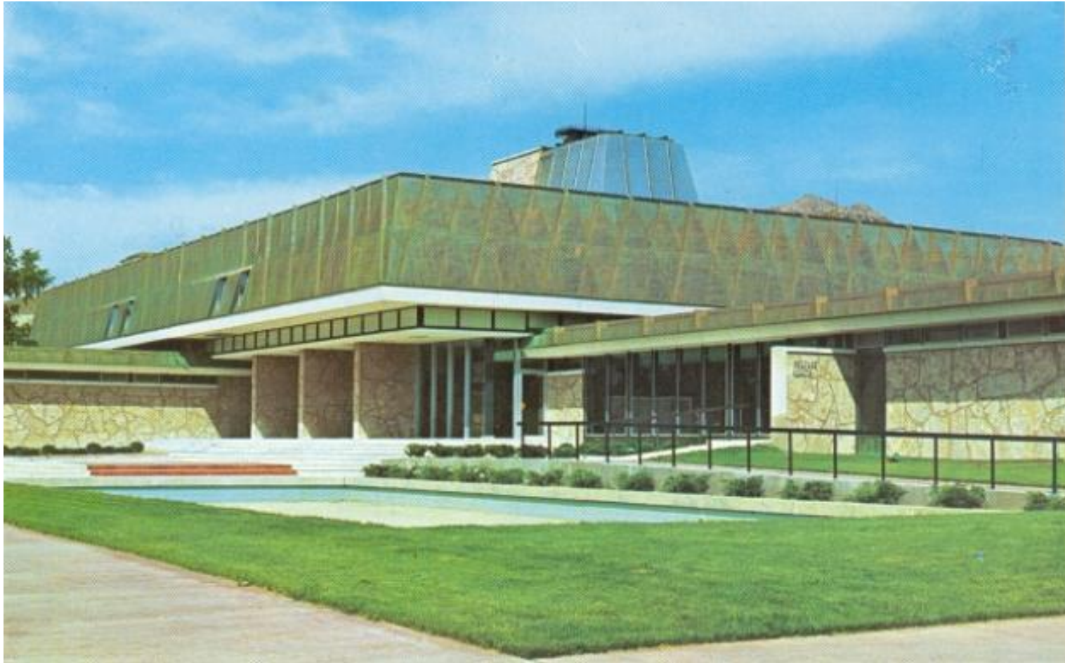
FREMONT COUNTY ADMINISTRATION BUILDING – 1962