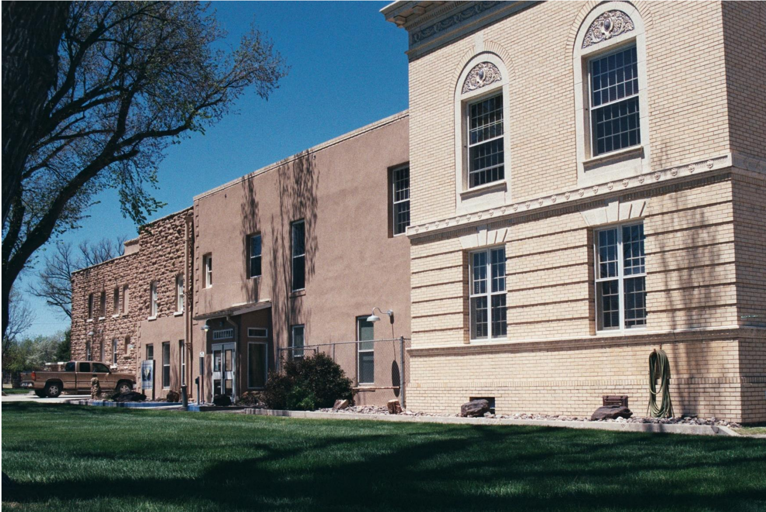
BACA COUNTY COURT HOUSE REAR EXTENSION