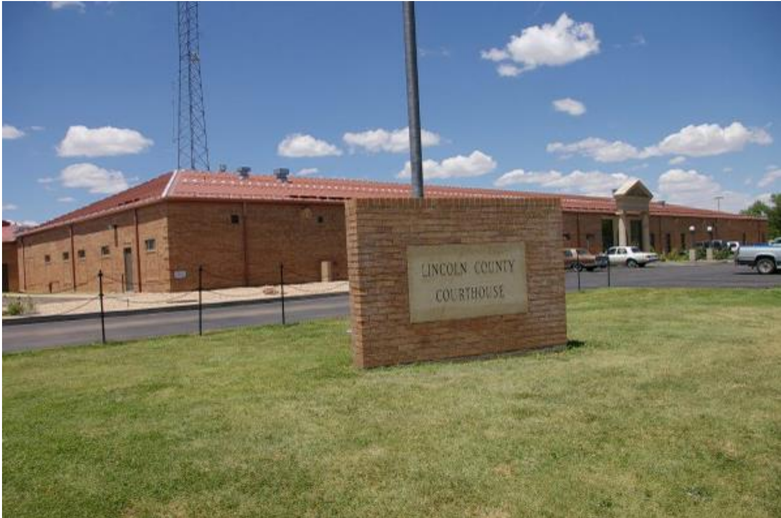
LINCOLN COUNTY COURT HOUSE – 1992