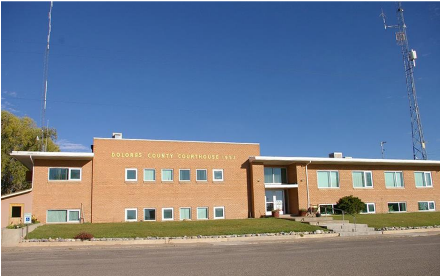
DOLORES COUNTY COURT HOUSE – 1953