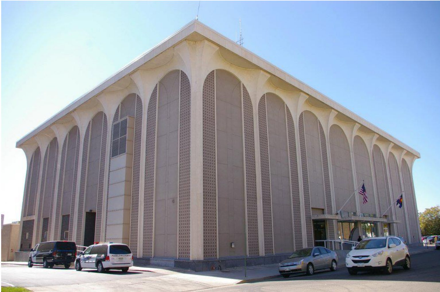
PUEBLO COUNTY JUSTICE CENTER – 1966