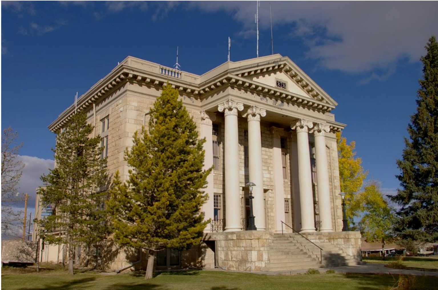
JACKSON COUNTY COURT HOUSE – 1913