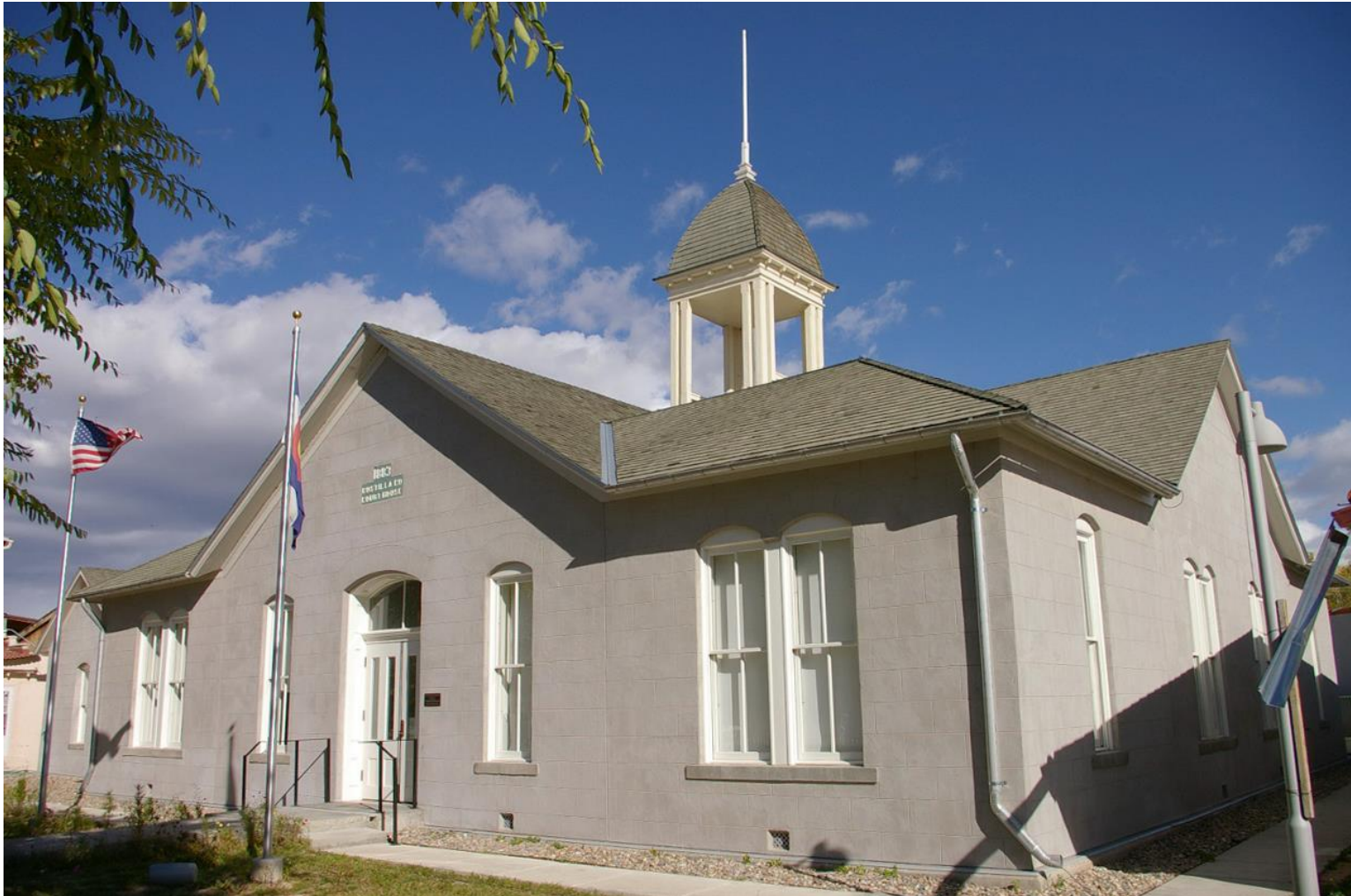
COSTILLA COUNTY COURT HOUSE – 1883