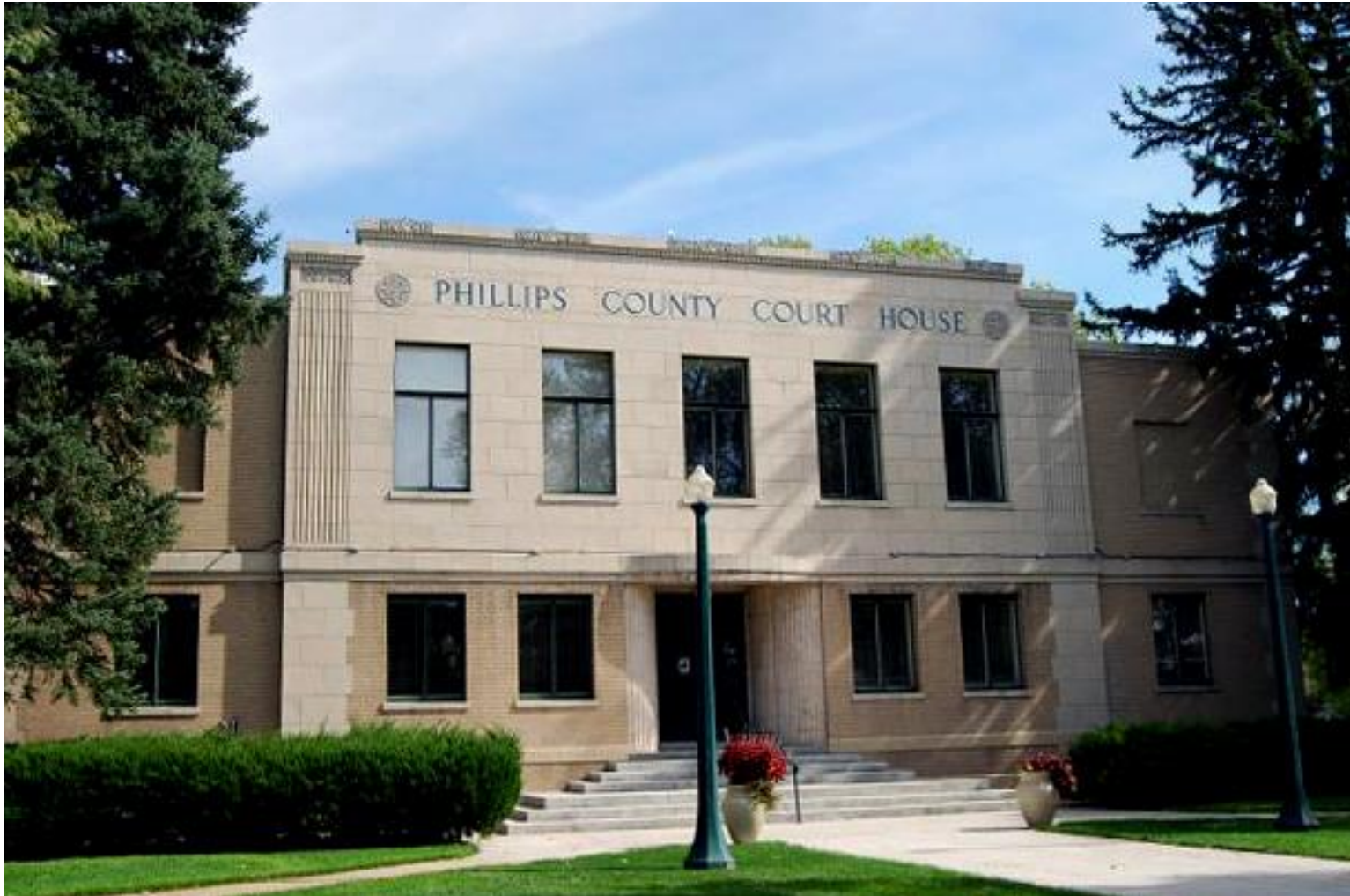
PHILLIPS COUNTY COURT HOUSE – 1936