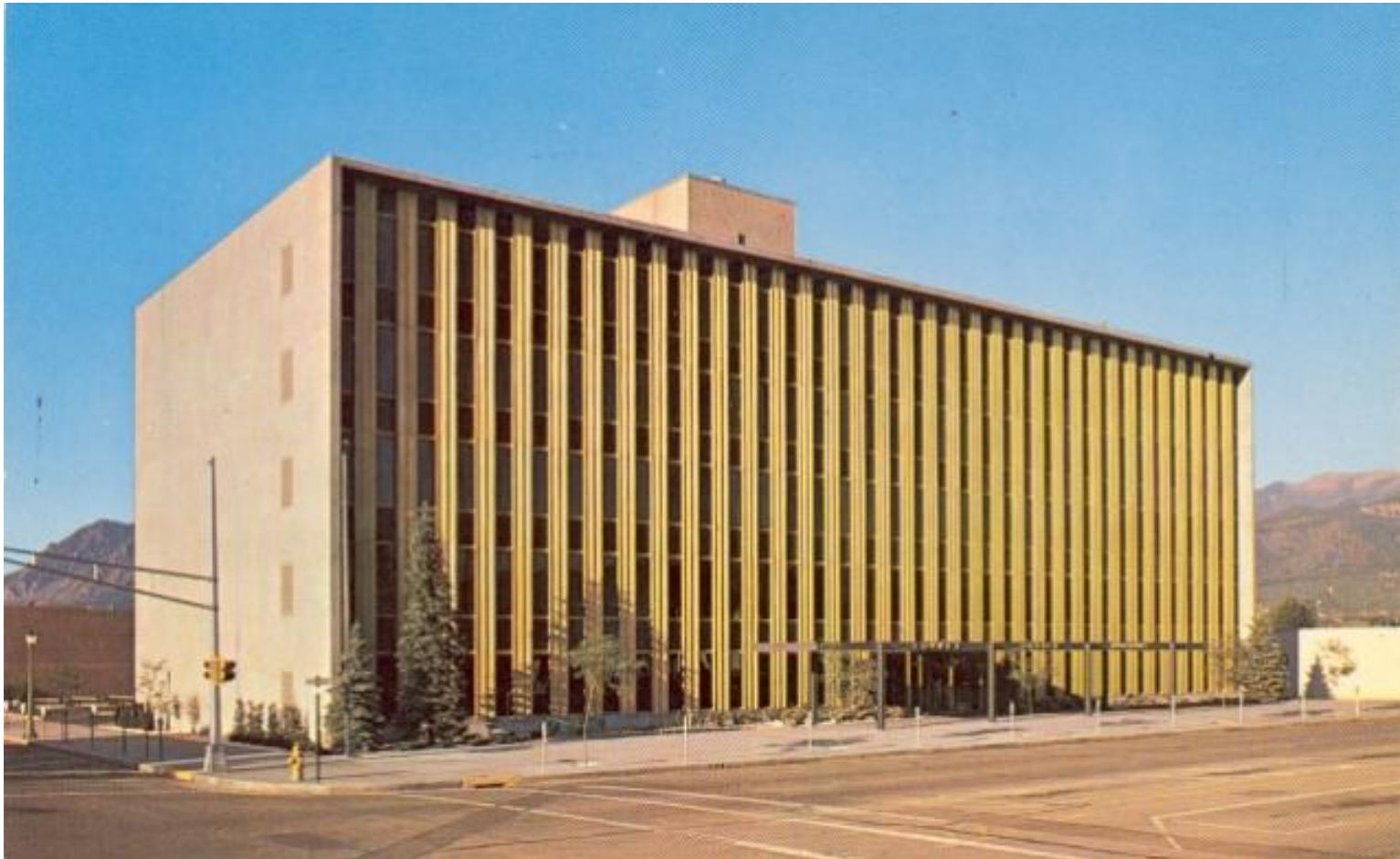
EL PASO COUNTY OFFICE BUILDING – THEN SHERIFF’S OFFICE – 1960