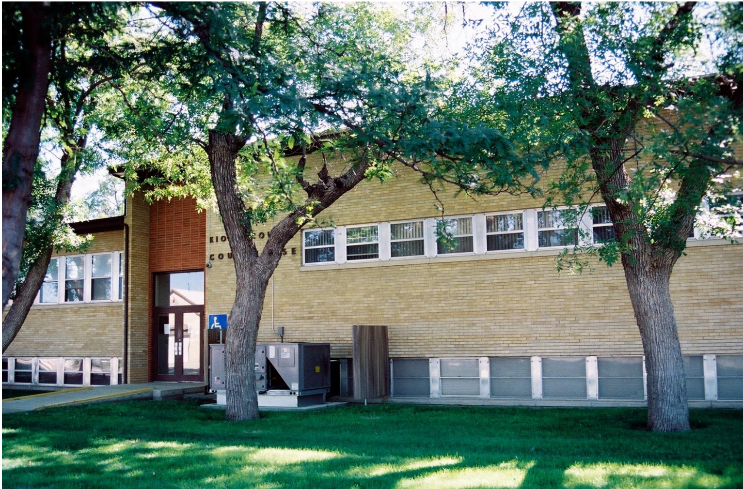
KIOWA COUNTY COURT HOUSE – 1956