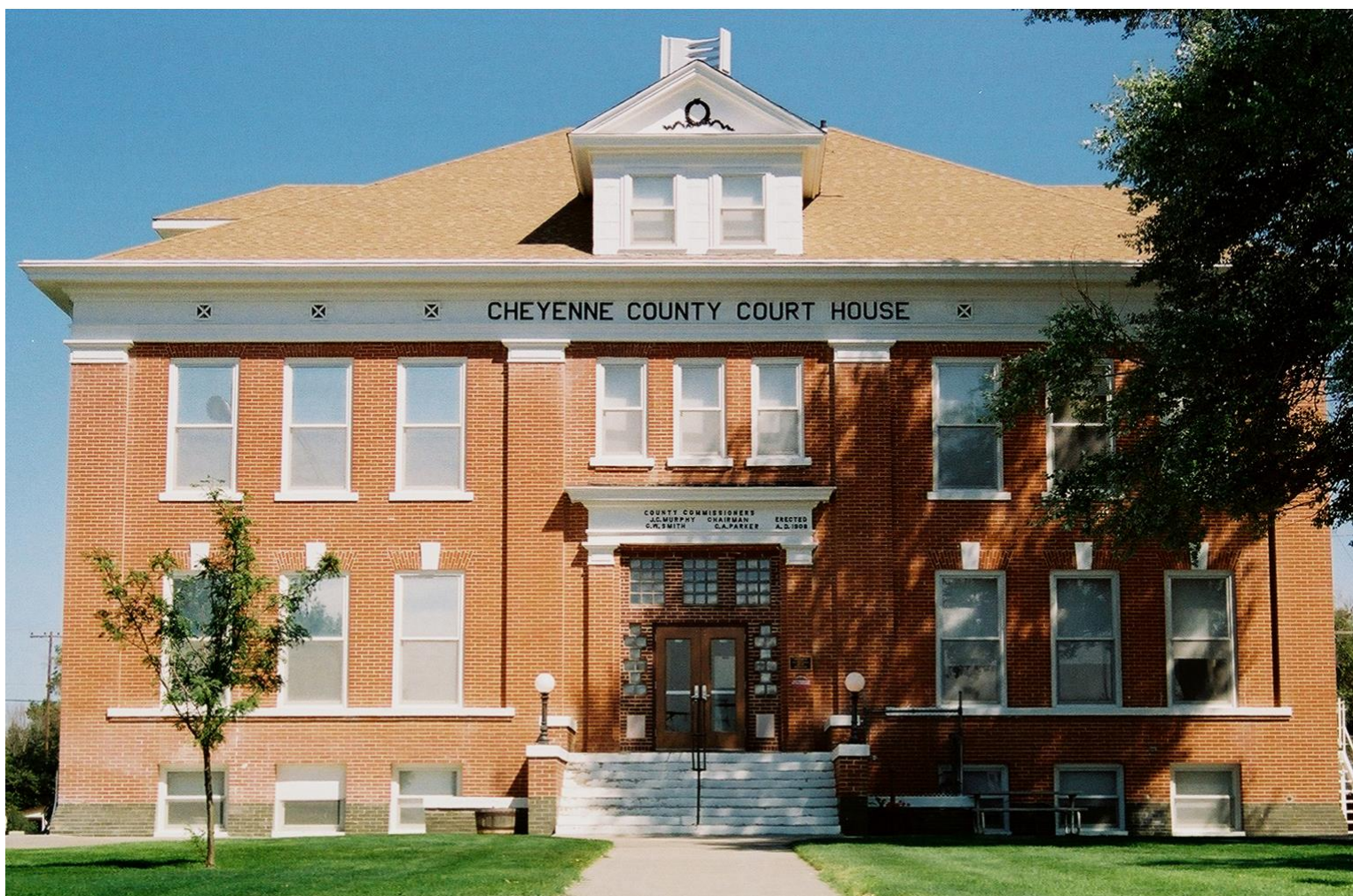
CHEYENNE COUNTY COURT HOUSE – 1908