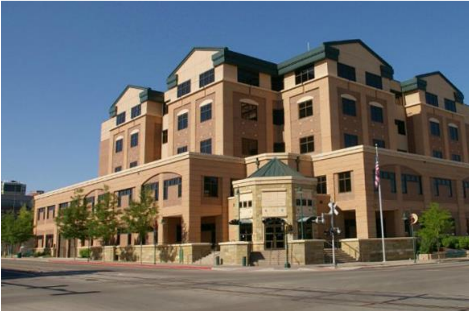
LARIMER COUNTY JUSTICE CENTER – 2000