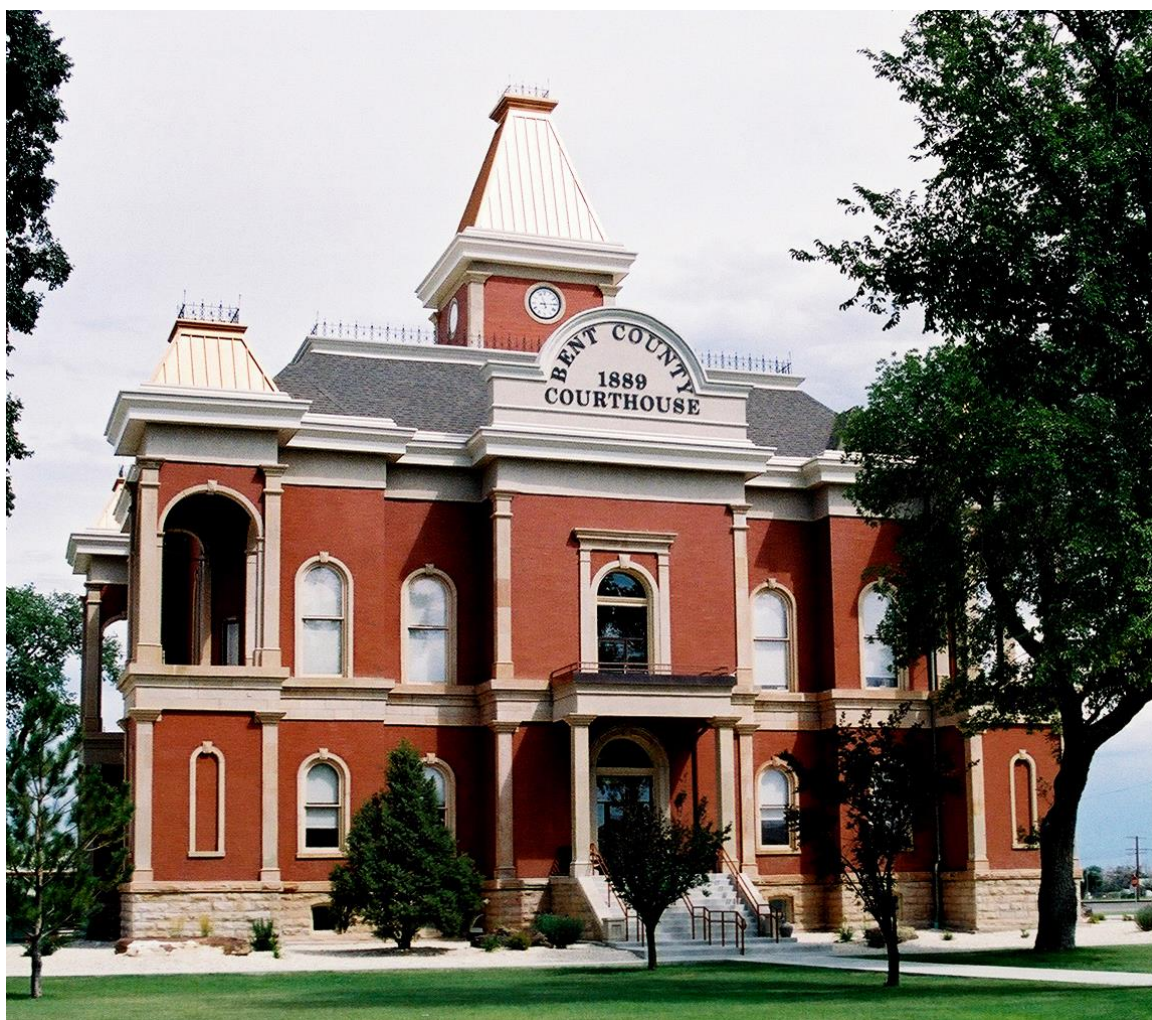
BENT COUNTY COURT HOUSE – 1889