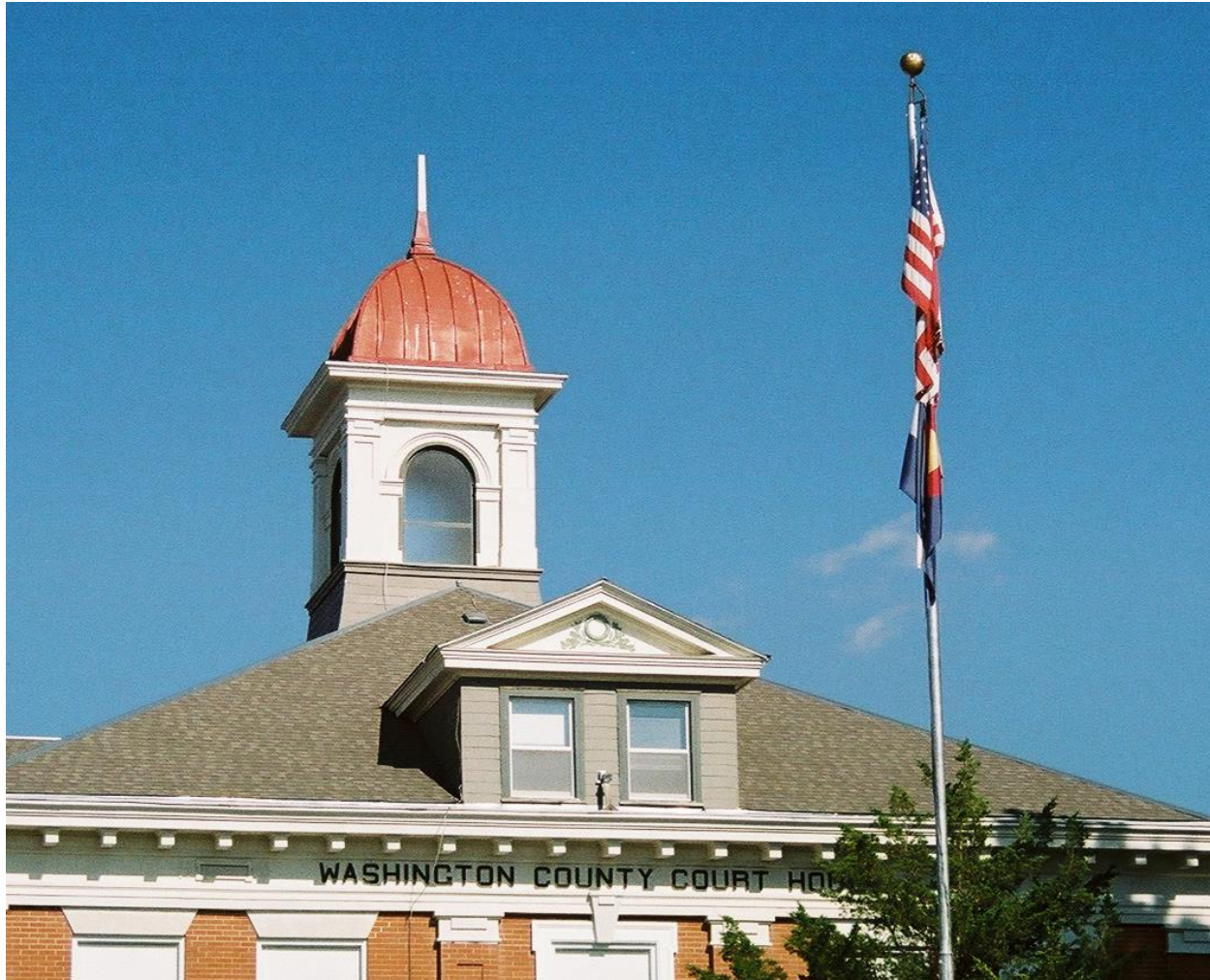
WASHINGTON COUNTY COURT HOUSE CUPOLA AND DORMER WINDOWS DETAILS