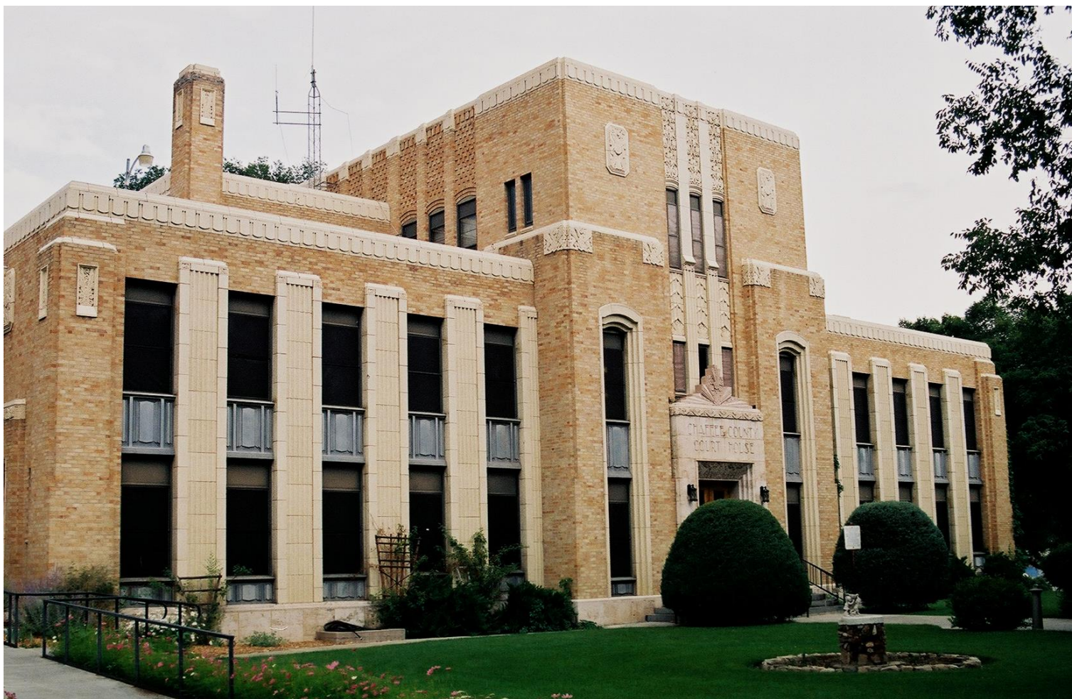
CHAFFEE COUNTY COURT HOUSE – 1932