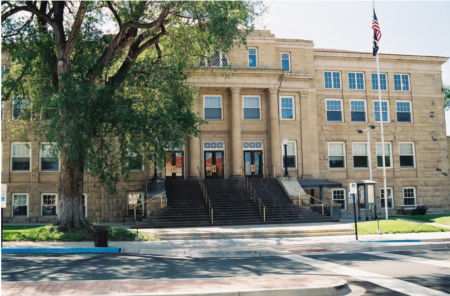
MONTROSE COUNTY COURT HOUSE – 1923