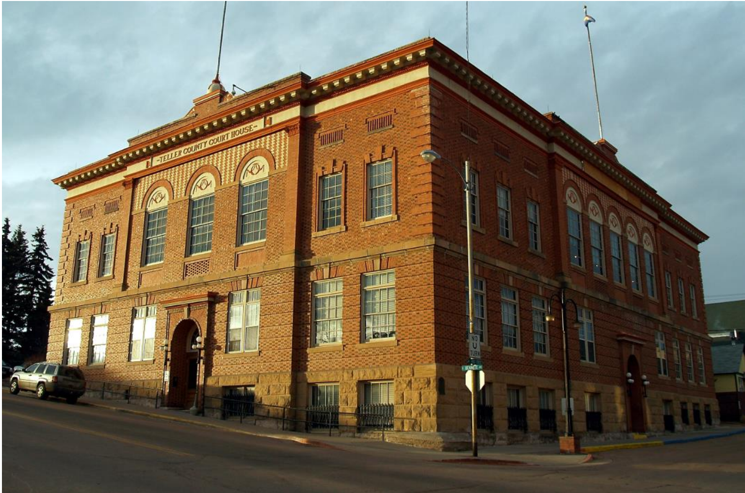
TELLER COUNTY COURT HOUSE – 1904