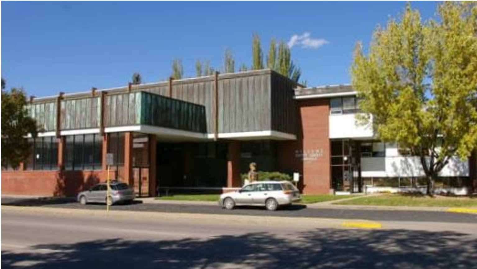
MOFFAT COUNTY COURT HOUSE – BUILT 1918 – NEW FAÇADE 1962