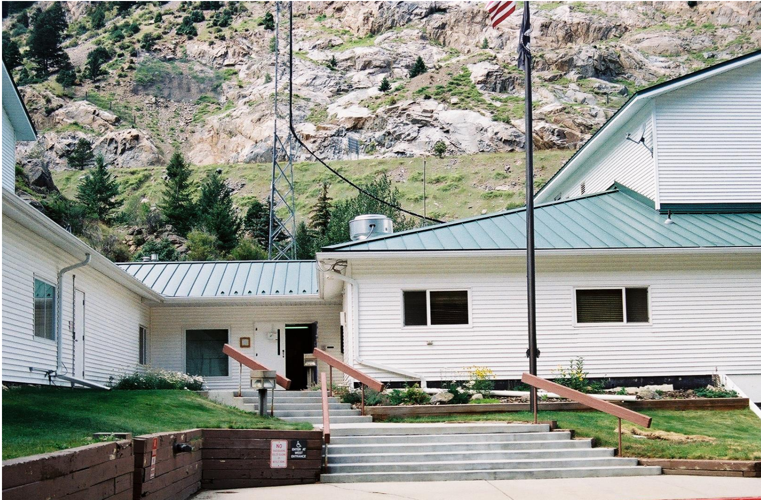
CLEAR CREEK COUNTY COURT HOUSE