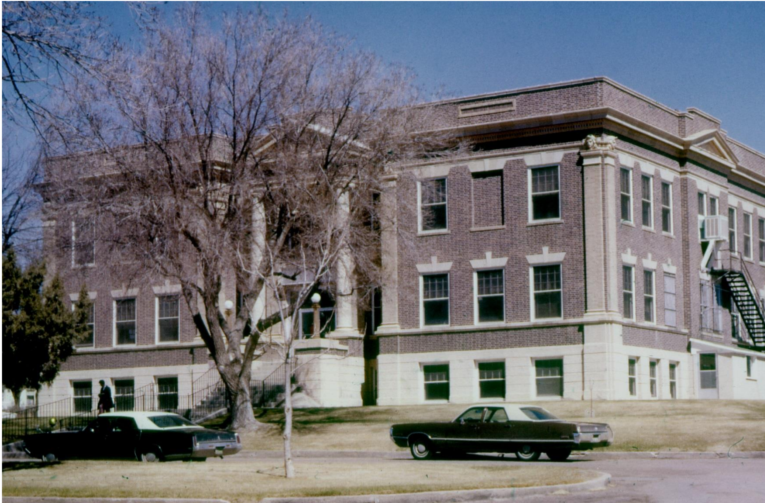
FORMER LINCOLN COUNTY COURT HOUSE – 1923-1992