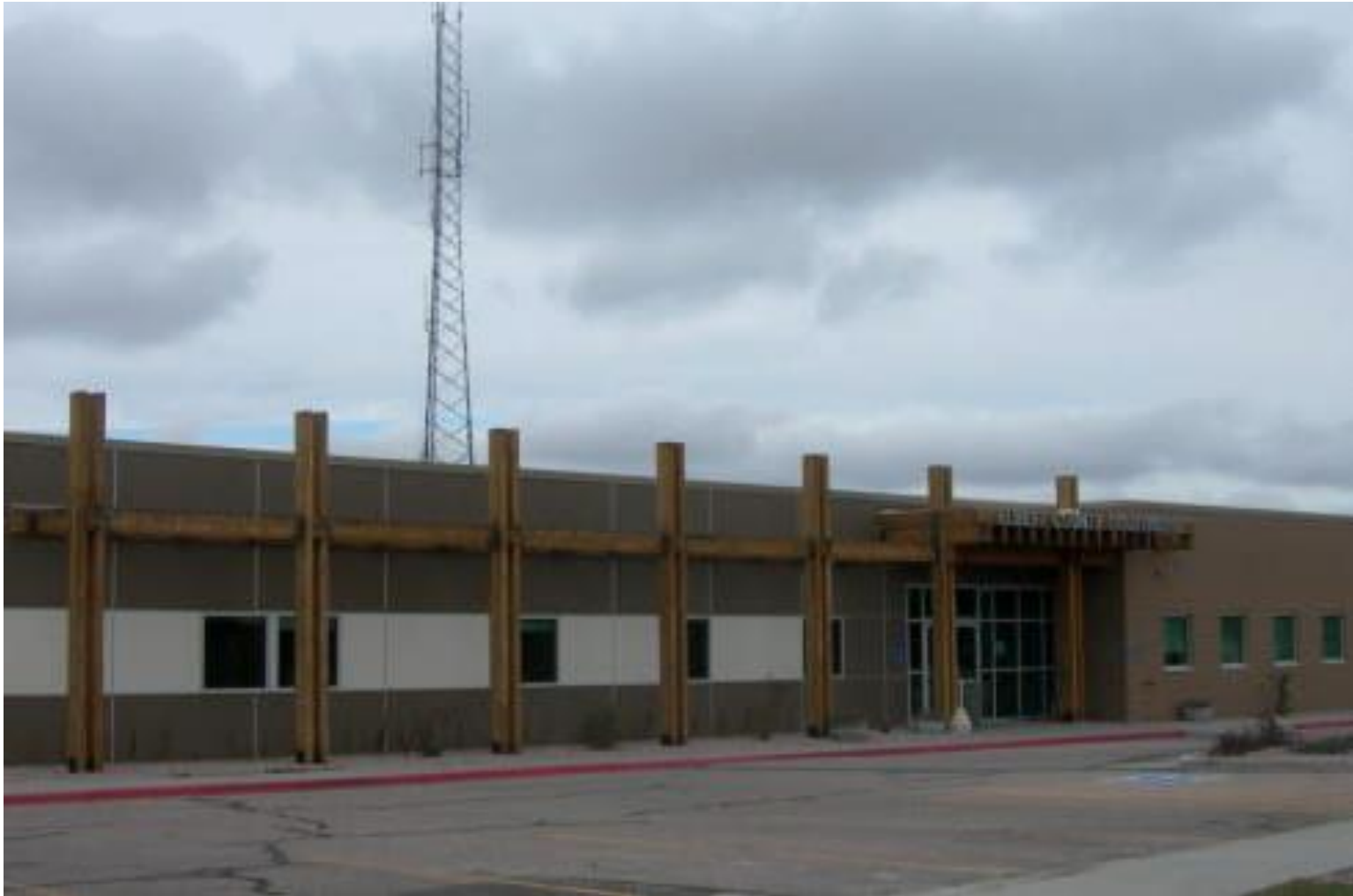
ELBERT COUNTY COURT HOUSE – 2008