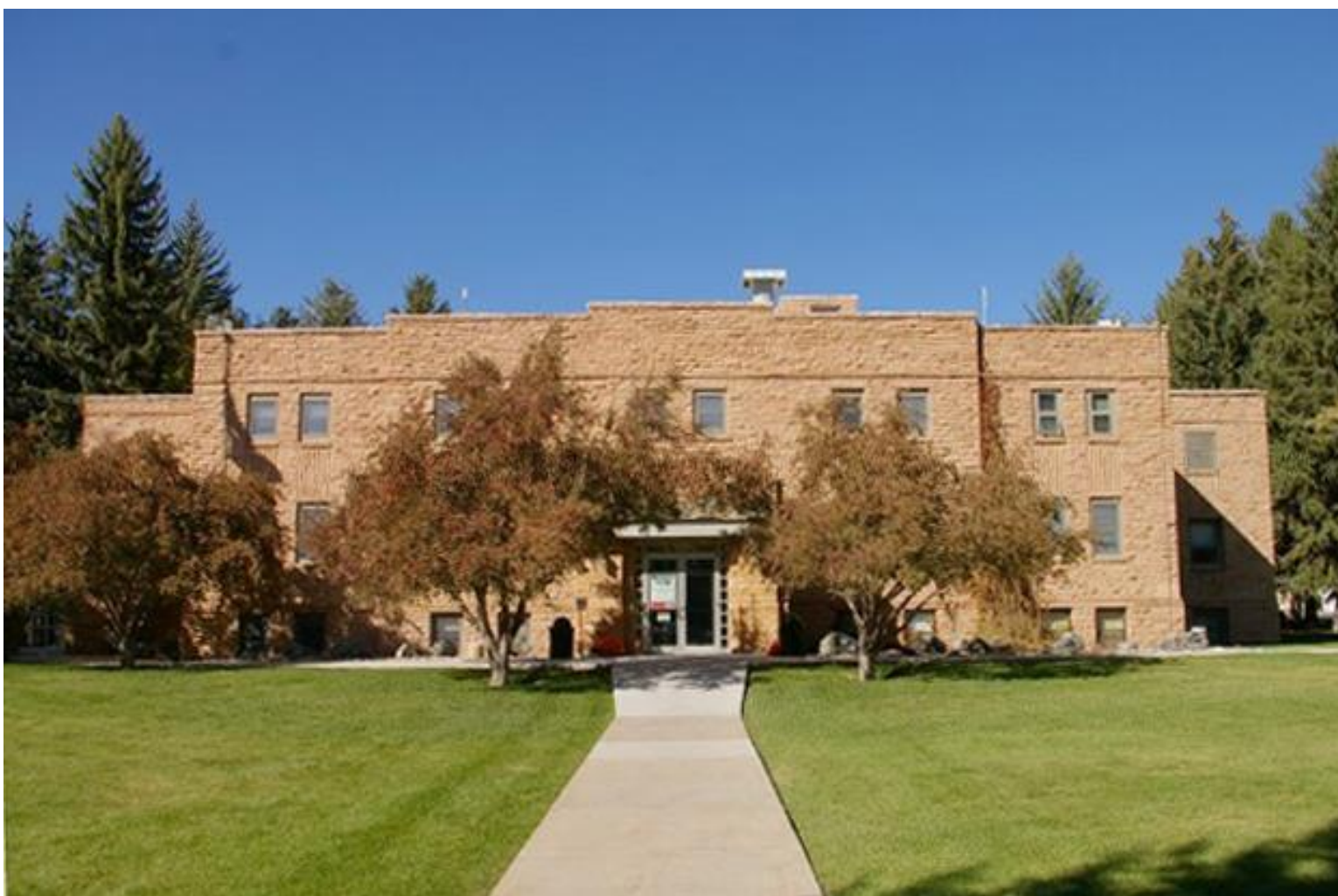
RIO BLANCO COUNTY COURT HOUSE – 1935