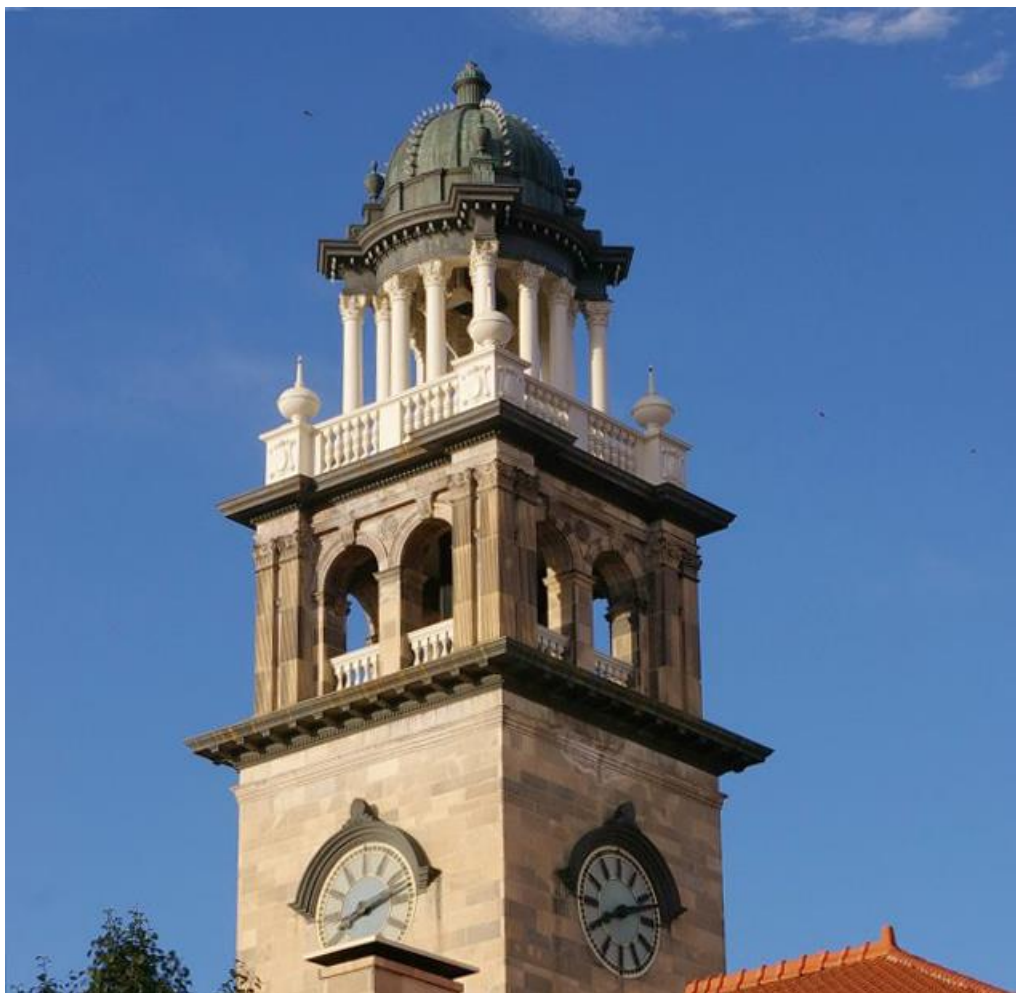
FORMER EL PASO COUNTY COURT HOUSE TOWER DETAIL