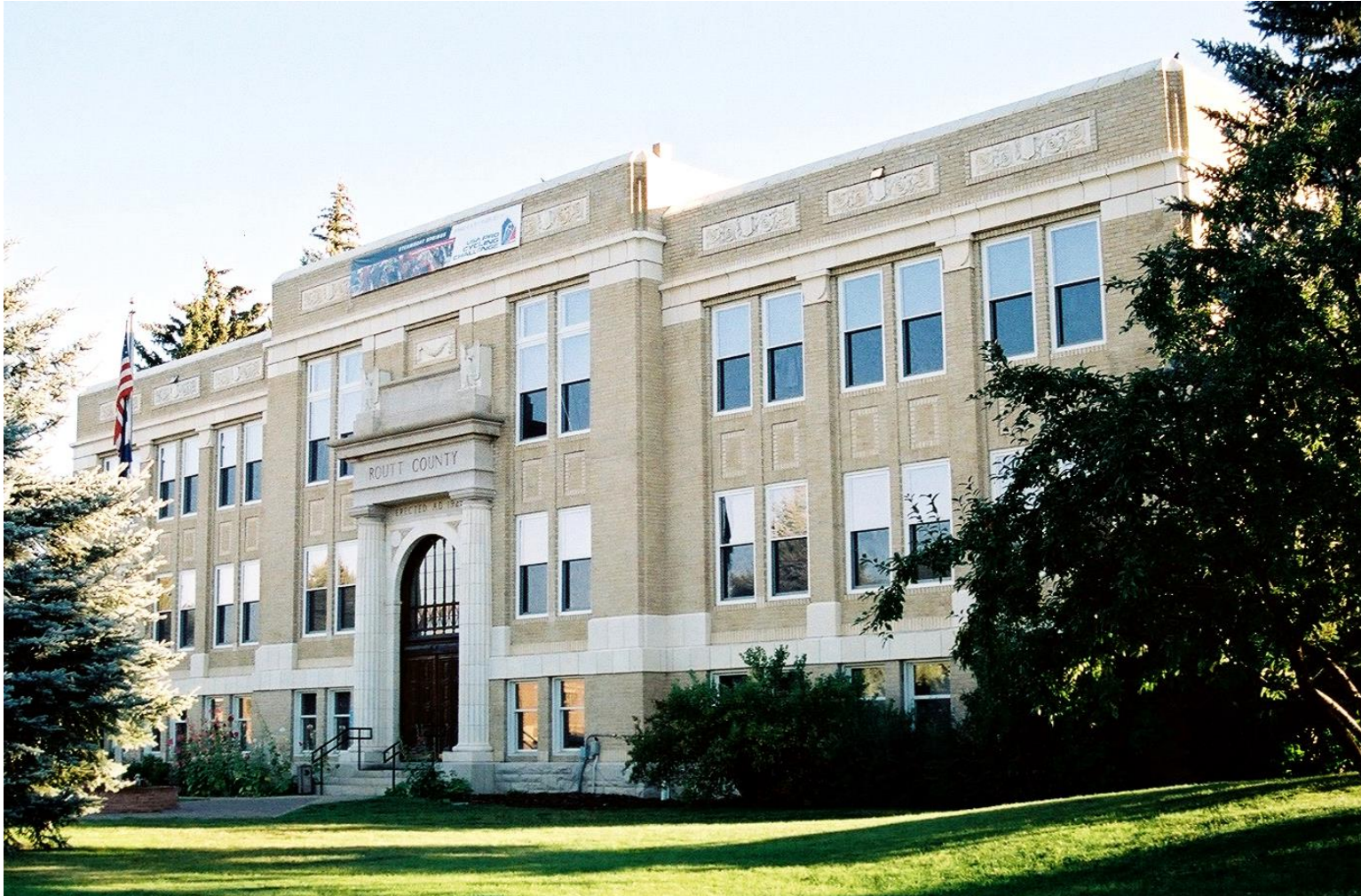
ROUTT COUNTY COURT HOUSE – 1923