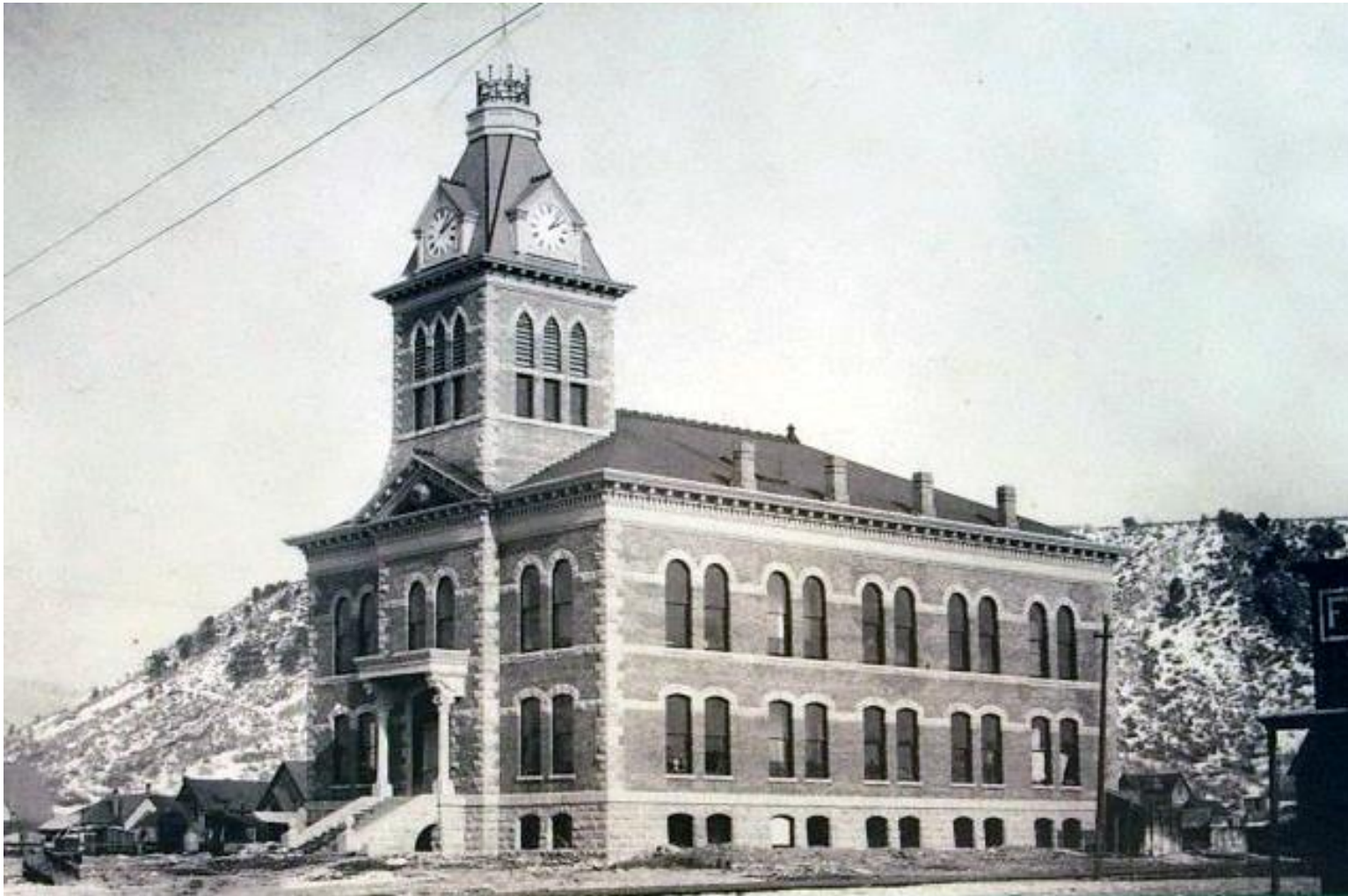
FORMER LA PLATA COUNTY COURT HOUSE – 1892-1964