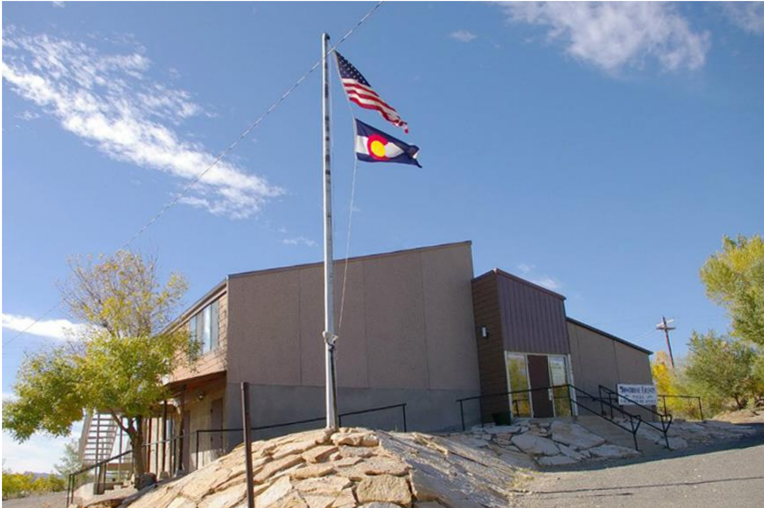
MONTROSE COUNTY COURT HOUSE