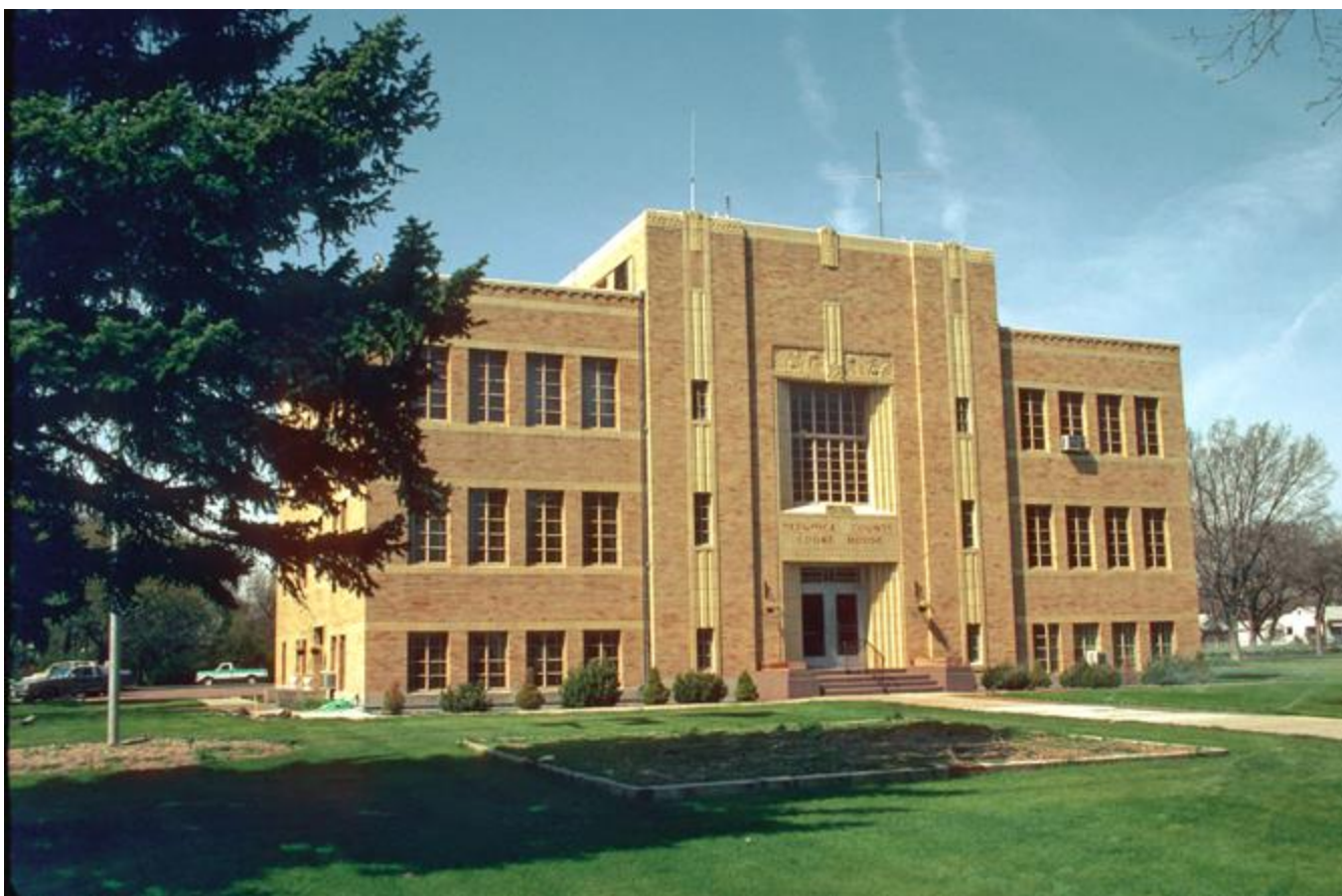
SEDGWICK COUNTY COURT HOUSE – 1939