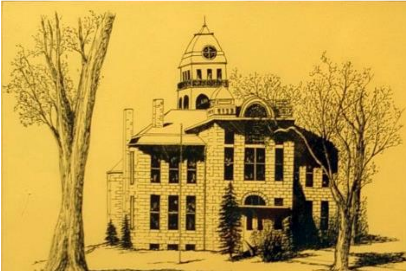
FORMER DOUGLAS COUNTY COURT HOUSE – 1889-1978