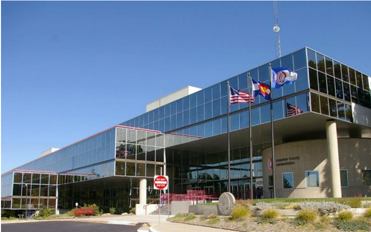
ARAPAHOE COUNTY ADMINISTRATION BUILDING – 1977