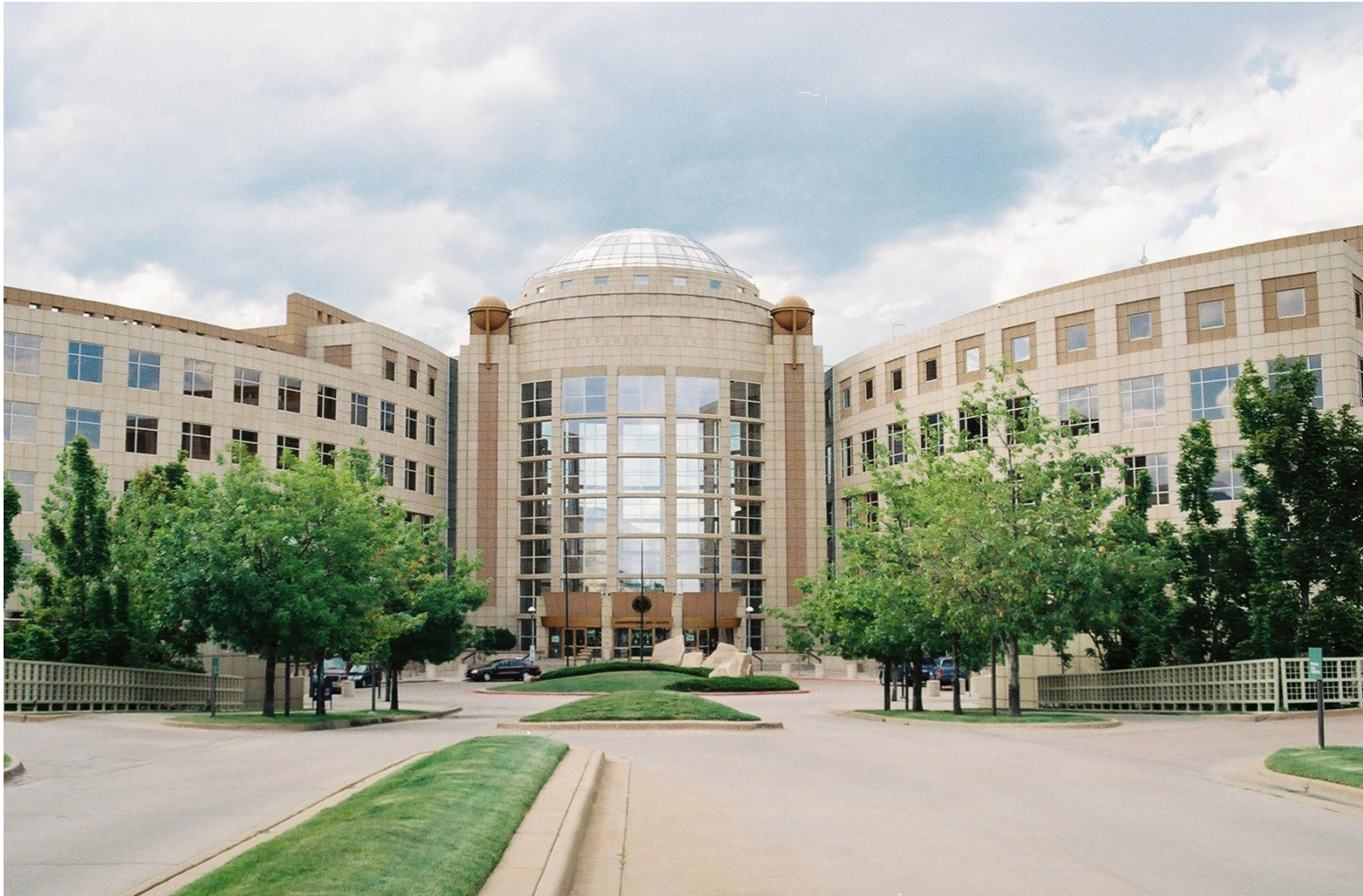
JEFFERSON COUNTY COURT HOUSE – 1993