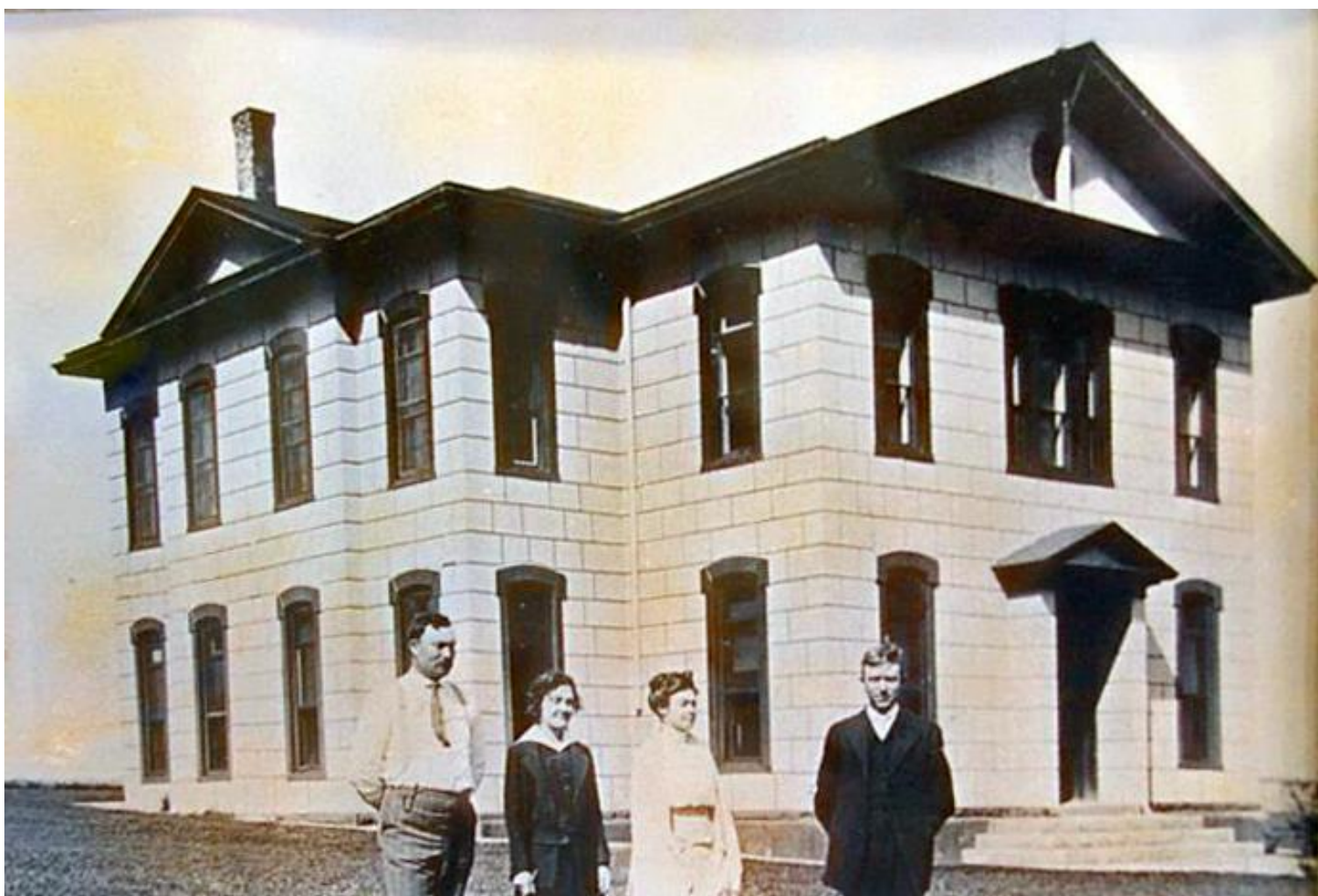
ORIGINAL LINCOLN COUNTY COURT HOUSE – 1906