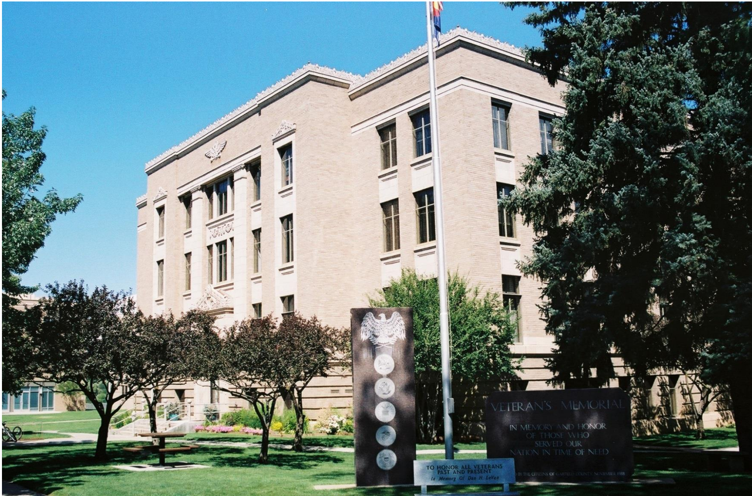
GARFIELD COUNTY BUILDING WITH VETERANS MEMORIAL