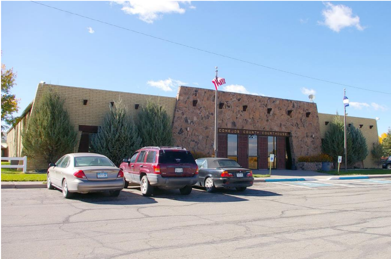
CONEJOS COUNTY COURT HOUSE – 1981