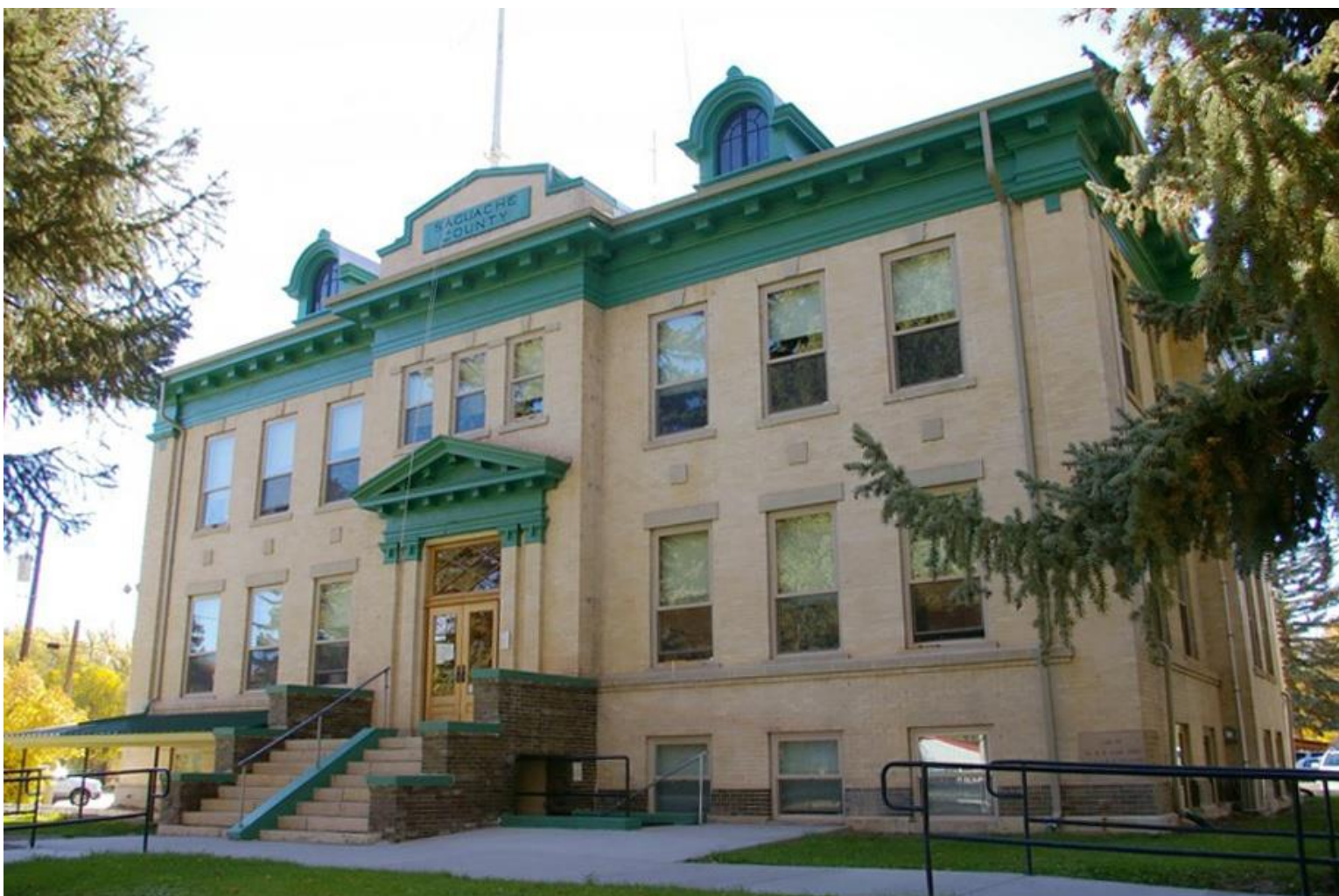
SAGUACHE COUNTY COURT HOUSE – 1910