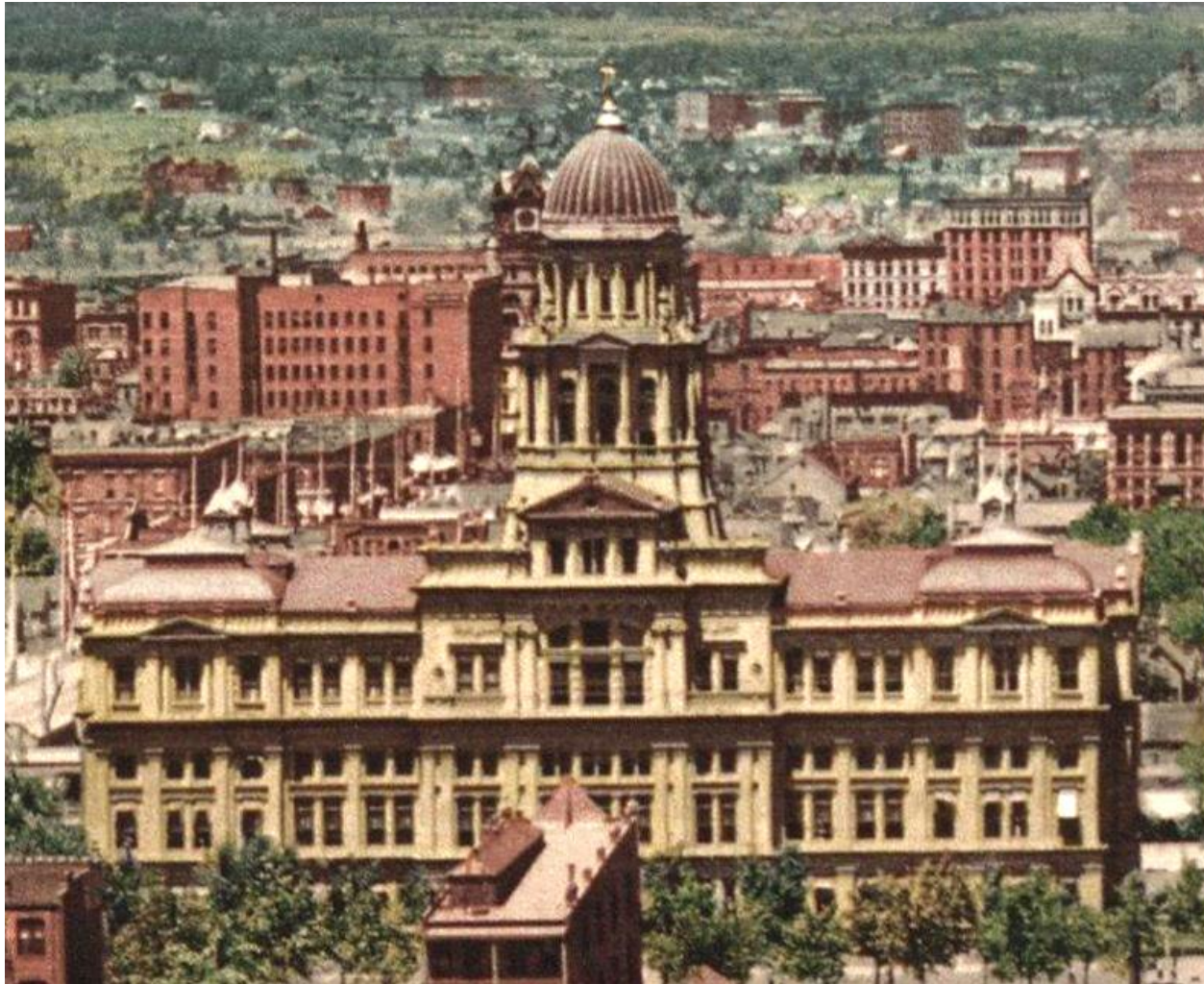
FORMER ARAPAHOE COUNTY COURT HOUSE – 1898

WHEN ARAPAHOE COUNTY INCLUDED THE CITY OF DENVER