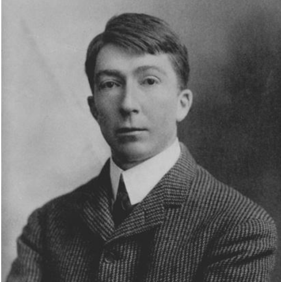
ARTUS VAN BRIGGLE